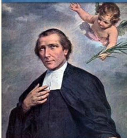
Saint Solomon Le Clercq