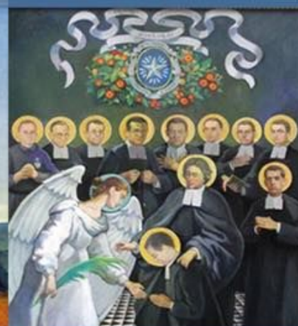
Saint Martyrs of Turón