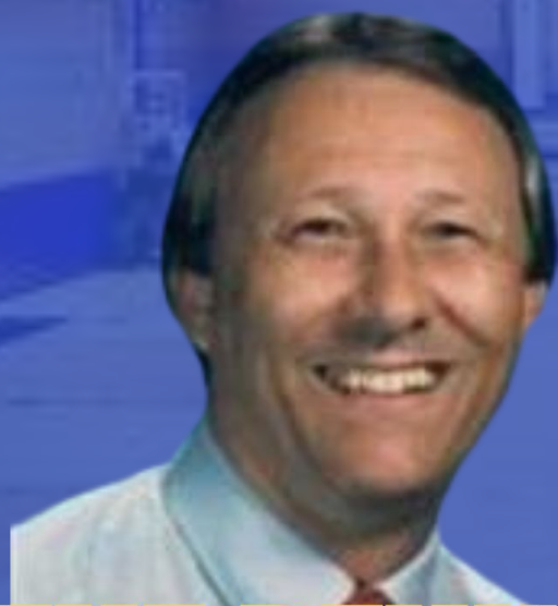
GENE BENNETT SPORTS COMPLEX