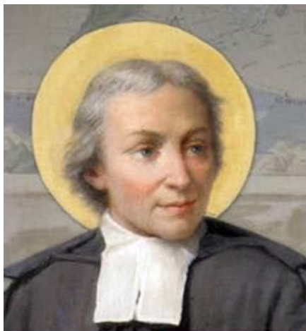
Saint John Baptist de La Salle