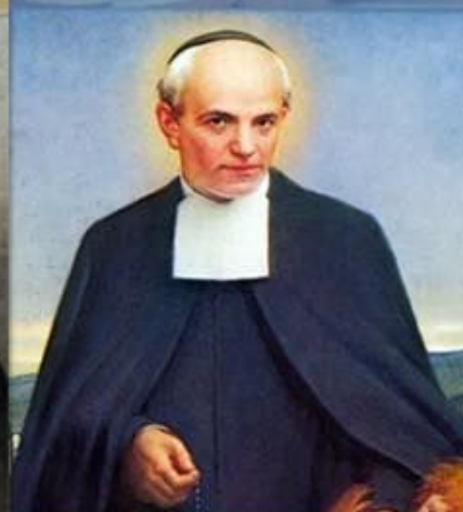
Saint Mutien-Marie Wiaux