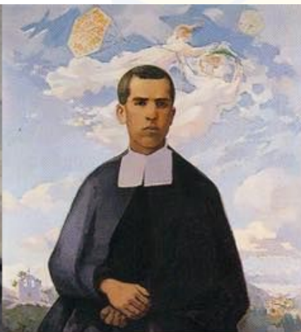
Saint Jaime Hilario Barbal