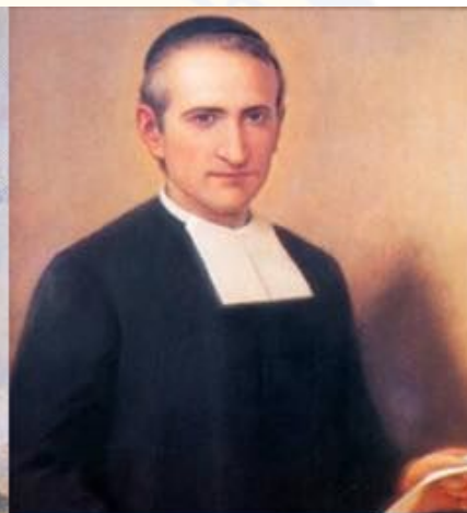
Saint Miguel Febres Cordero