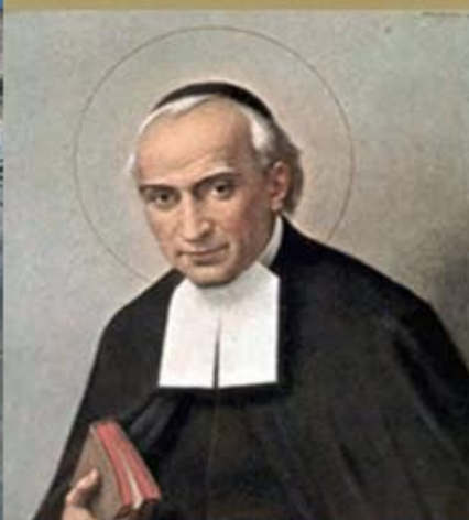
Saint Benildus Romançon