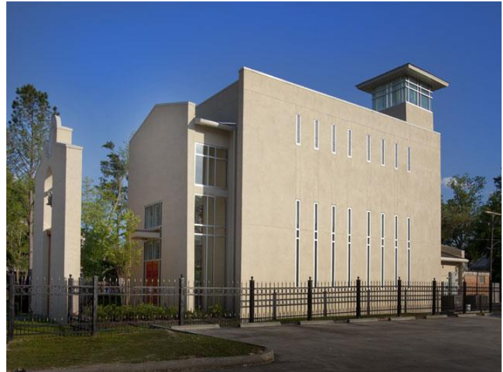
Right: Chapel at SSA

SAINT SCHOLASTICA ACADEMY ADVENT SERVICE: The Dove Ministries committee of the SSA Parent Board will hold its Advent service on Dec. 11 at 6:30 p.m. in the Our Lady of Perpetual Help Chapel (pictured below) on SSA's campus. For the first time, the event will be an evening candlelight service featuring the St. Peter's Parish musicians and choir. The program will follow the Taize style of songs and prayer, which was created in the 1940s by monks in France. The theme of the service is "Out of Darkness, Into Light" and will beautifully observe the Advent season as we prepare our hearts for the light that comes from the birth of Christ at Christmas. All family and friends of the SSA and St. Paul's communities are invited to attend.