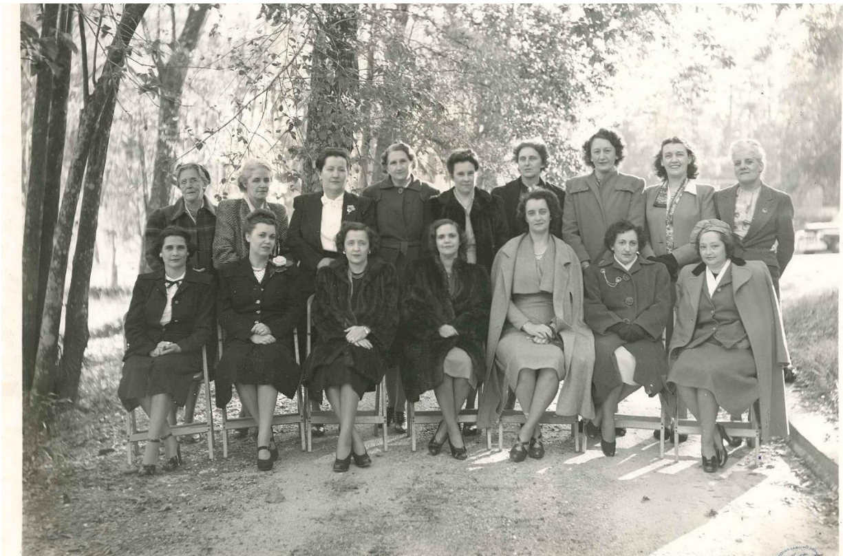
5570 #69 Mother's Club 1948