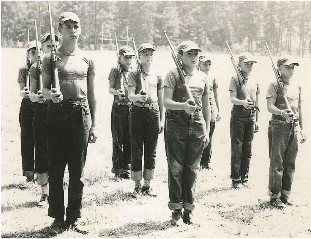
Mother's Club 1948