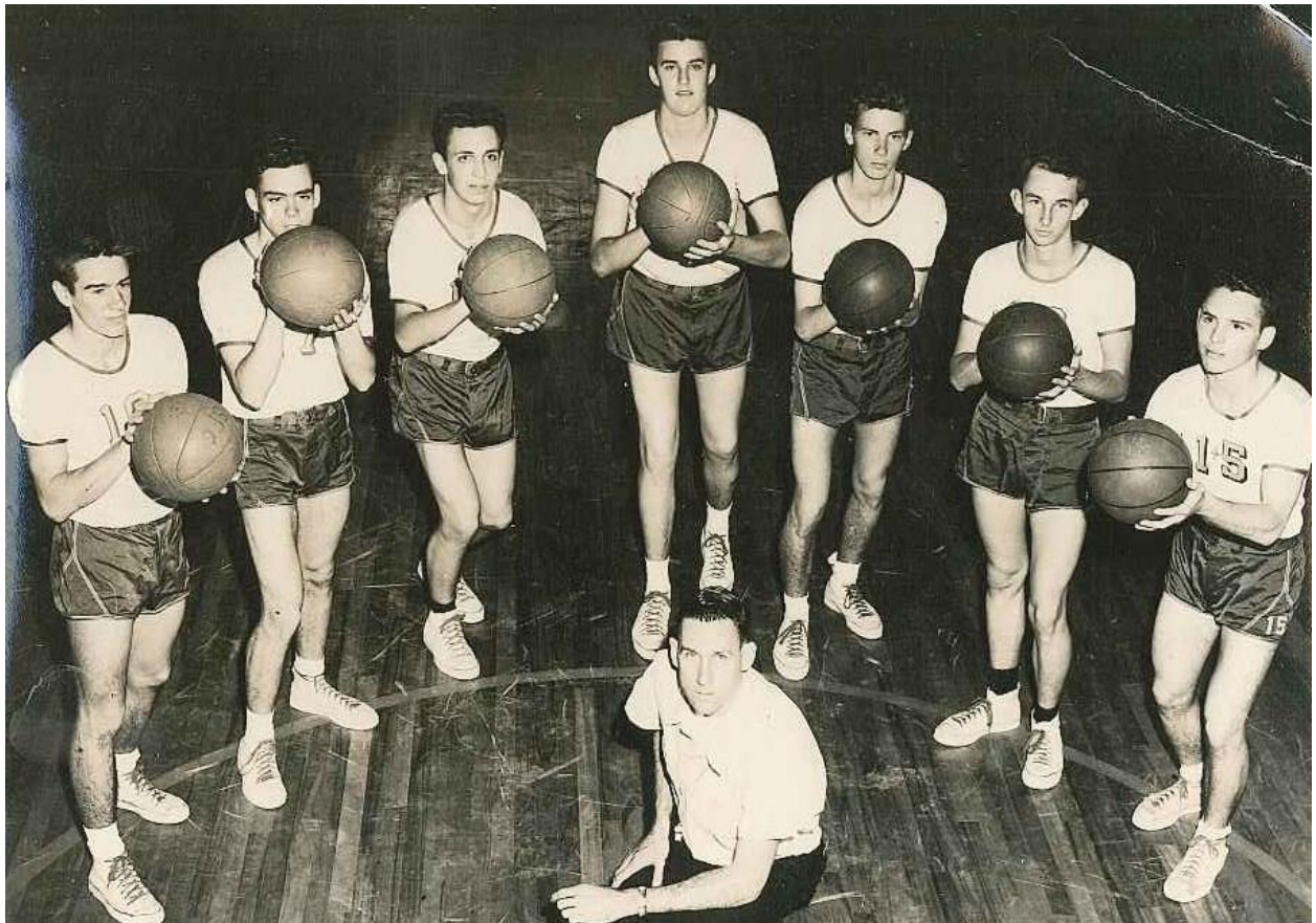
Below: Varsity Basketball Team 1955-56