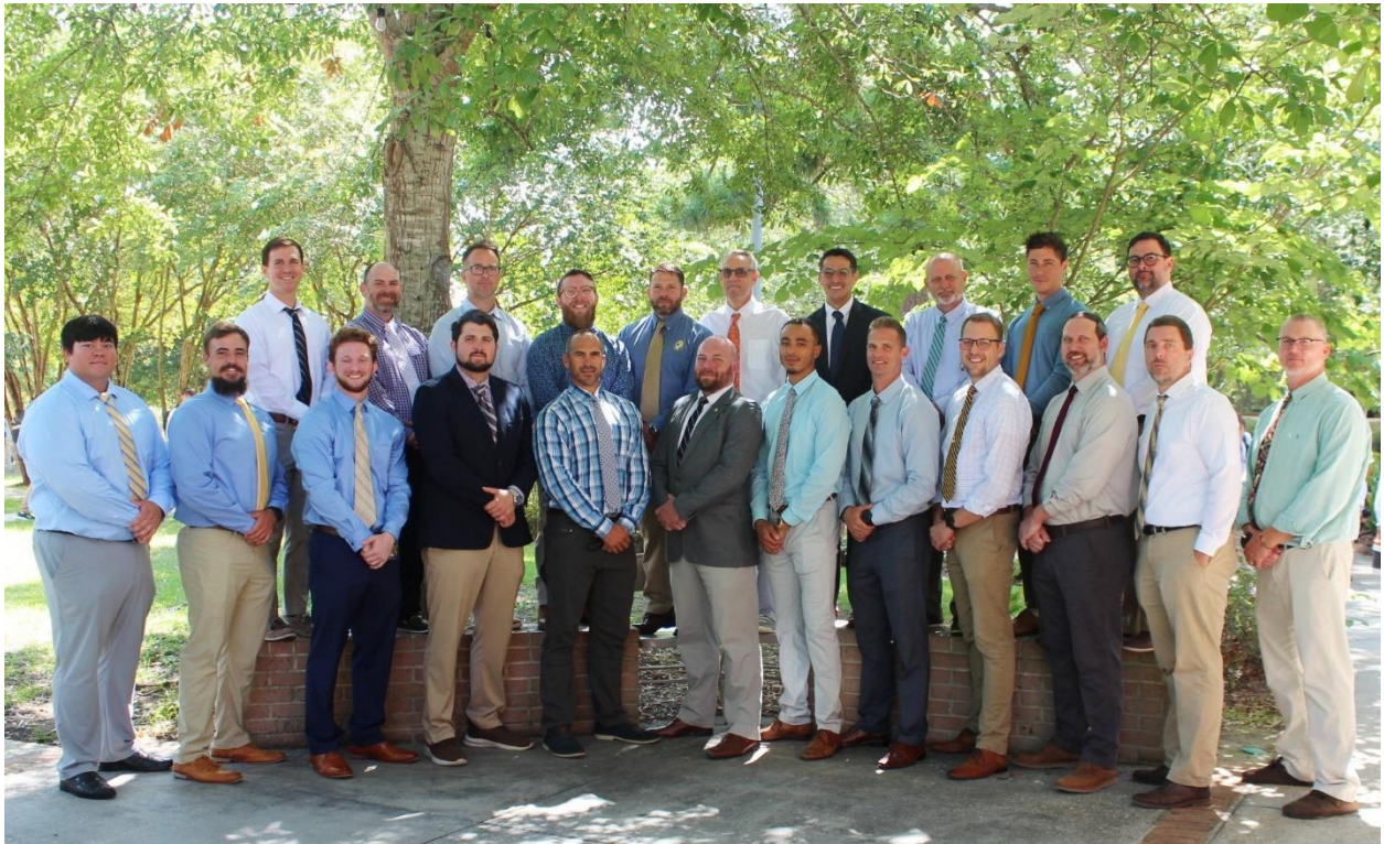
Below: SPS Alumni faculty and staff gather for a group photo.