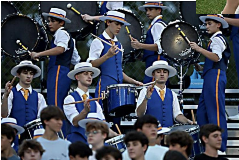
Left: The Marching Wolves drum section makes some noise.