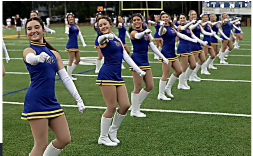
Above: Golden Blues perform at halftime at the football game on Friday.