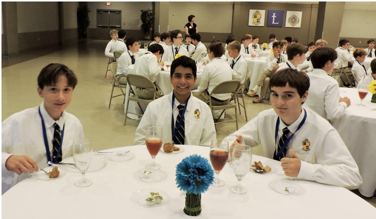
Below: Pre-Freshmen enjoy a meal as they put into practice what they have learned in the Etiquette Training class.