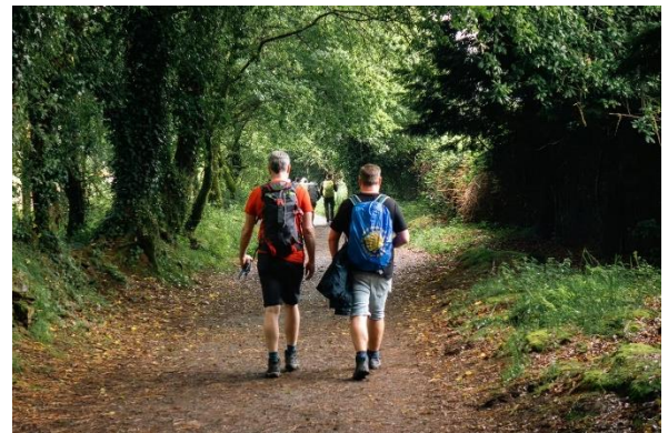
Above: Pilgrims on the Camino de Santiago on their way to Santiago de Compostela (left).

ACADEMIC SUCCESS: We reach the mid-point of the first quarter this week! If your son is struggling in any class, insist that he go seek help. Help your son develop proper attitudes and habits for success. Show confidence in his ability; work with him to set realistic academic goals. Help him develop an orderly study environment. Teens enjoy chaos, so the trick is to help your son create enough order in his chaos for proper study to occur. Designate a place and time to study. Require 1-2 hours of study per night. Do not accept the "I have no homework" excuse. He always has homework -- review, study, and advanced preparation. At the end of his study session, have him organize books, assignments, PE clothes, etc. for the next day.