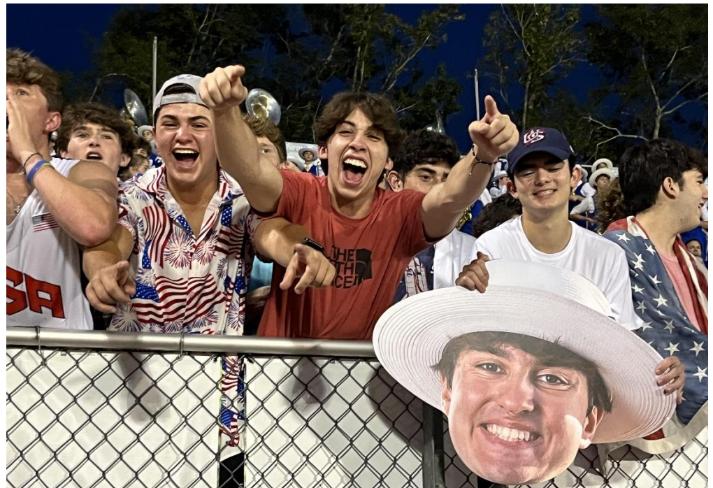
Right: Wolfnation Cheers on the Wolves Friday, September 8, at Hunter Stadium