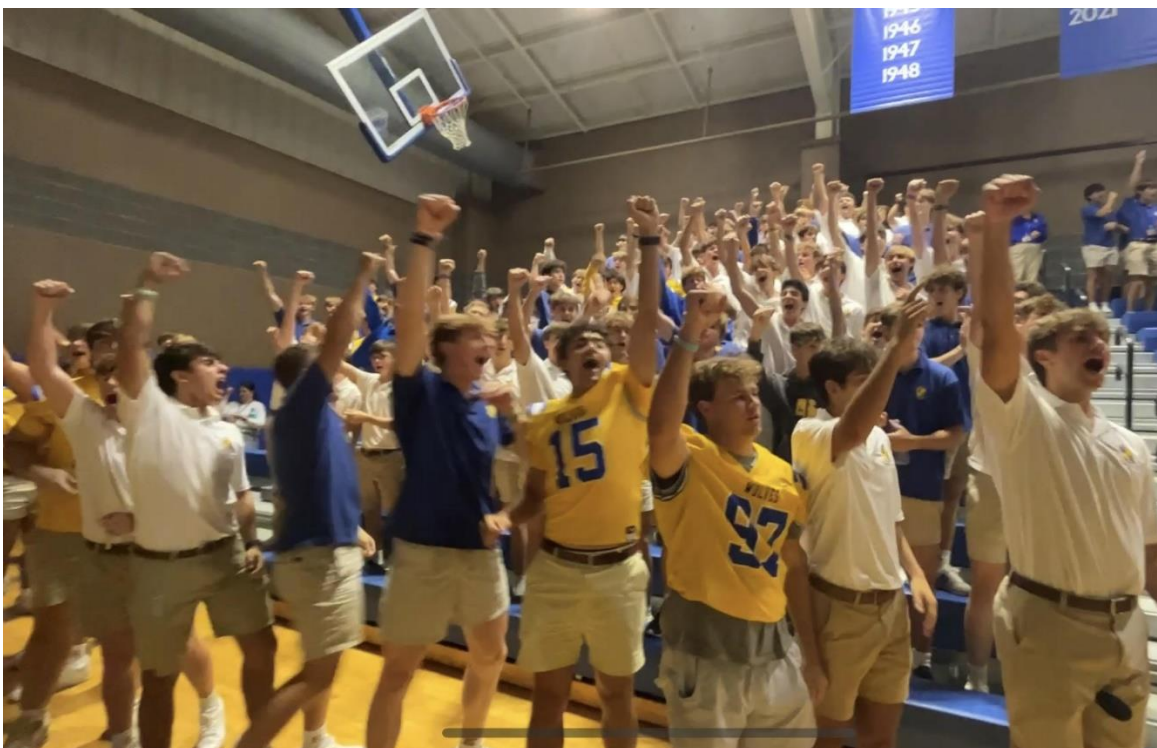
Left: Seniors lead the cheers at the first pep rally.