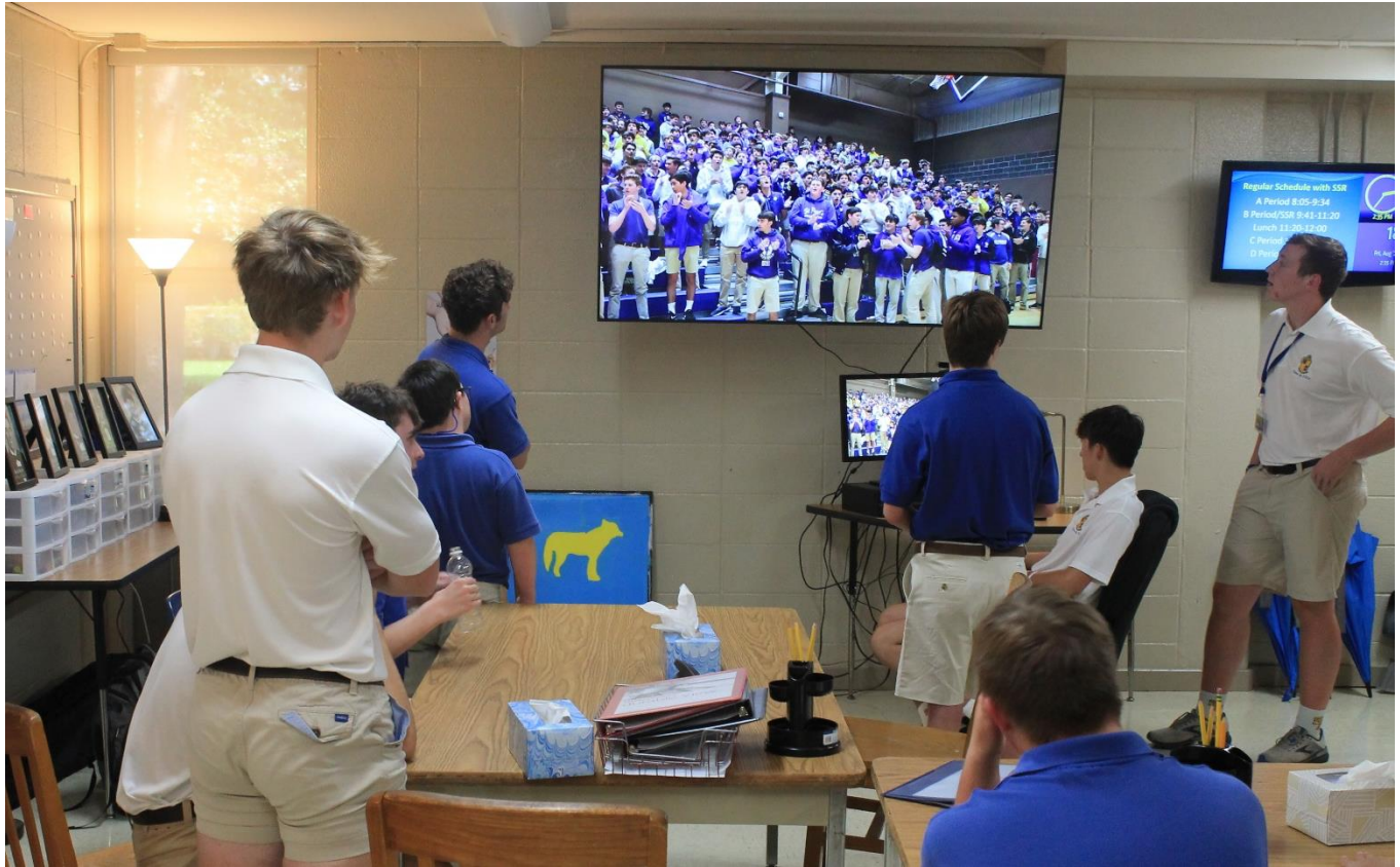
Above: Students in the CORE Pack and their mentors practice the school fight song prior to the assembly.