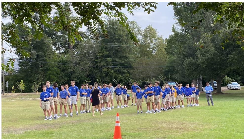
Left: Students line up in their muster zone during the recent fire drill.

SAFETY WEEK: Every year at the beginning of school we have a week dedicated to practicing all our procedures related to safety. These include tornado drills, intruder drills, fire drills and so on. During these drills we invite the Covington Fire and Police Departments to observe and critique our performance and ask them for suggestions to make our procedures better. Once we finish with Safety Week we evaluate how things went, make changes as needed, and then incorporate these improvements into later drills, held regularly during the year. My constant prayer is that we never have to use these protocols for an actual emergency. But, if we do, I hope that we are as prepared as we can be.