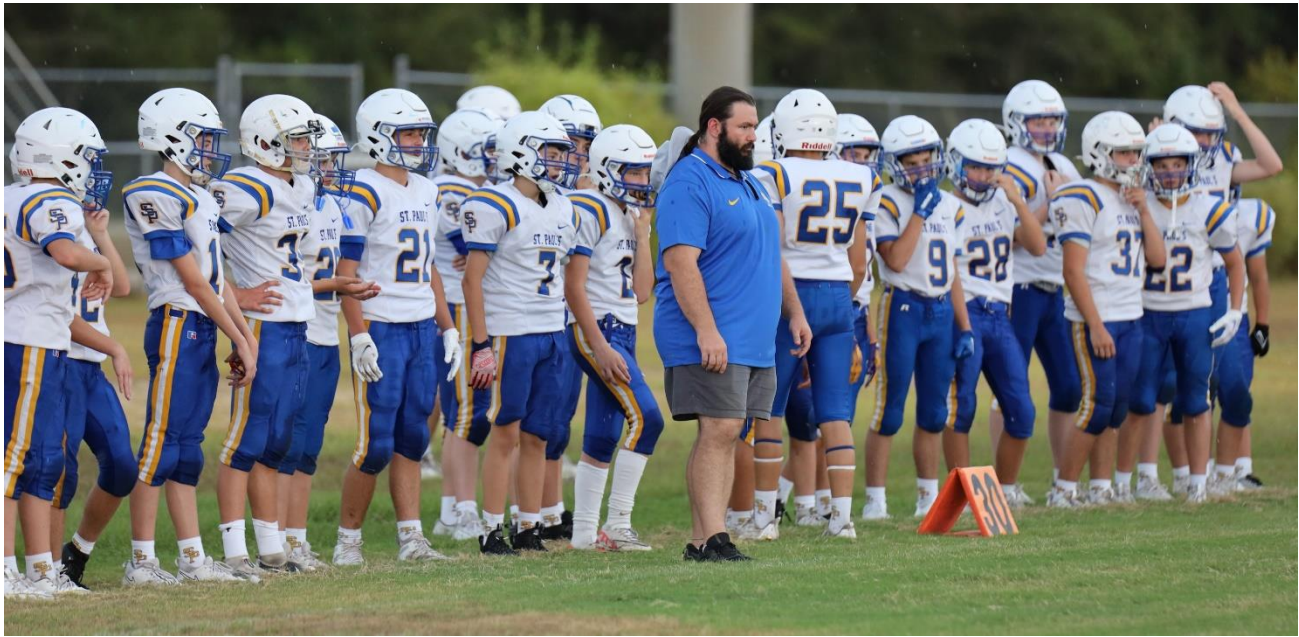
Above and Below: The 8 th Grade Wolf pups vanquished the formidable Franklinton Demons this past week. 8-0 was the final tally of this outing.