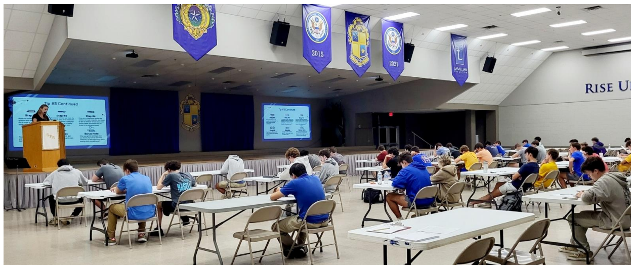
Above: Seniors at the first ACT Boot Camp session.

The first two sessions were held last week. The final two sessions are Tuesday and Wednesday of this week. It's not too late to sign up for the last two sessions. The registration link is on the class of 24 Google classroom.