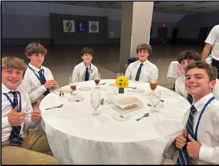
Pre-freshmen students anticipate their four course meal.

The students enjoyed the lessons and improved their manners, but the best part of the class was the delicious lunch of corn chowder, Caesar salad, chicken and pasta Alfredo, and bread pudding. The students returned to class for the rest of the afternoon, well-mannered and well-fed.