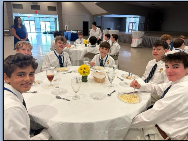
Students learn the art of twirling their pasta.

Volunteer moms (and grandmother) assist with serving the meal.