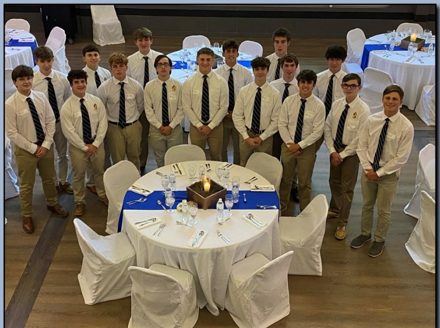
Saint Paul's Student Ambassadors assisted with serving the dinner.