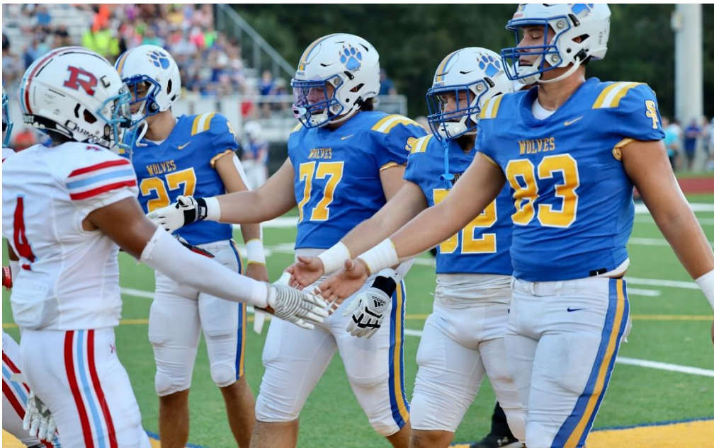
Left: SPS football Wolves shake hands with fellow Lasallians, Rummel Raiders, pre scrimmage.