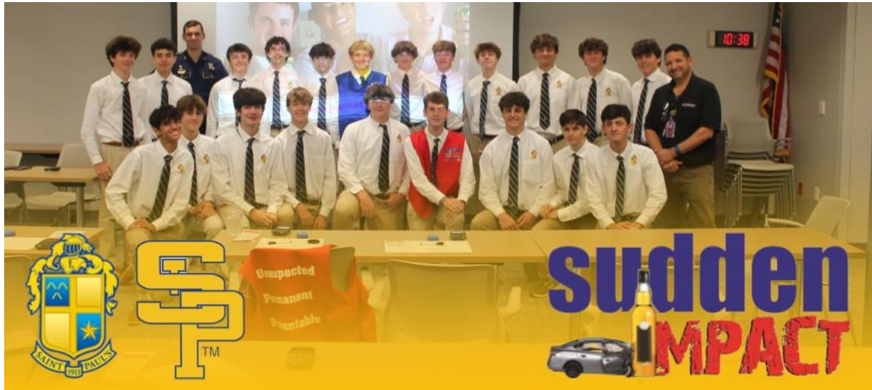
Above: Another sophomore group participates in the Sudden Impact program at St. Tammany Parish Hospital.