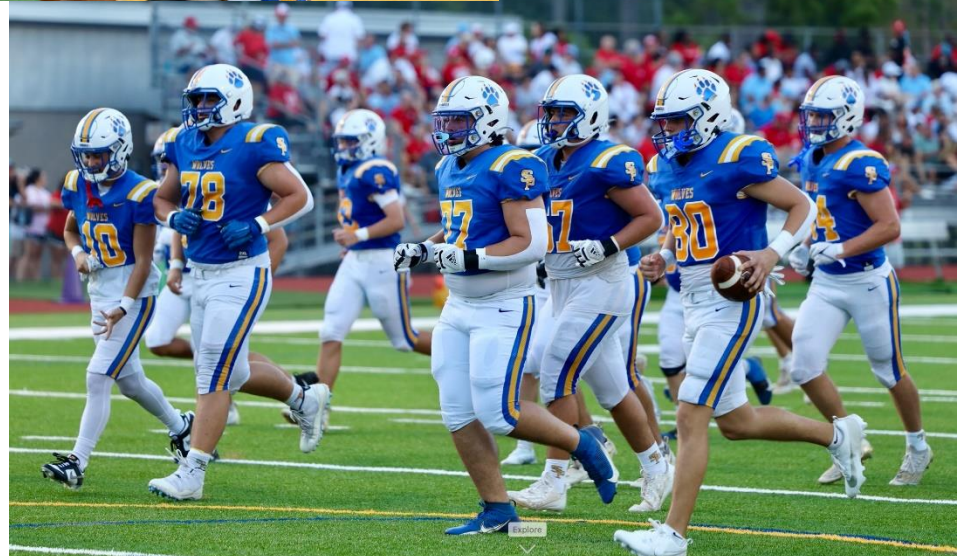
Right: Warming up pre-scrimmage on Friday night.