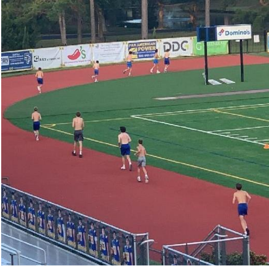
Left: Cross County runners take an early morning run to try and beat the heat.