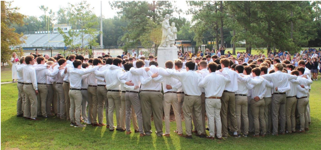
Below: Seniors gather at the statue of Saint La Salle after the MTA to sing Rise Up O Men of God .