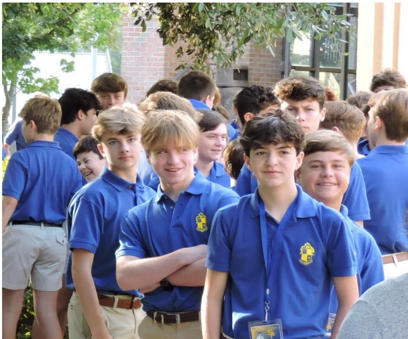
Left: Pre-Freshmen anxiously await the entrance to their first assembly in the New Gym.