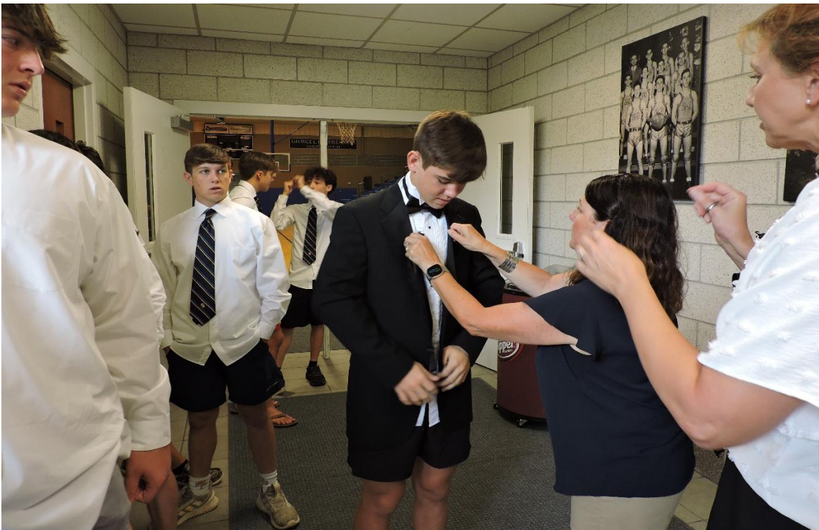
Left: Moms help seniors prepare for senior portraits in the New Gym lobby.