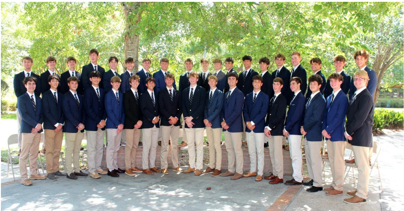
Below: Newly commissioned Extraordinary Ministers of the Eucharist pose for their first group picture after the first school Mass on Tuesday.