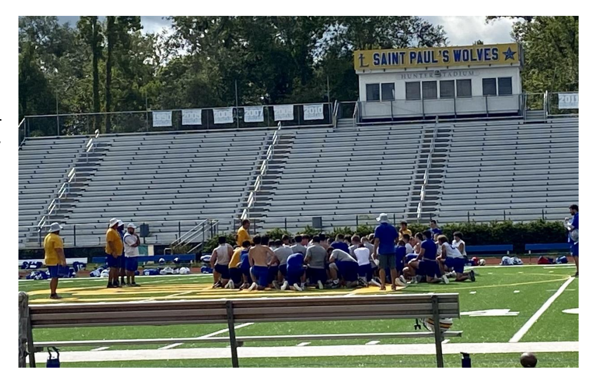
Right: Varsity football team gather at center field on the new turf after practice.