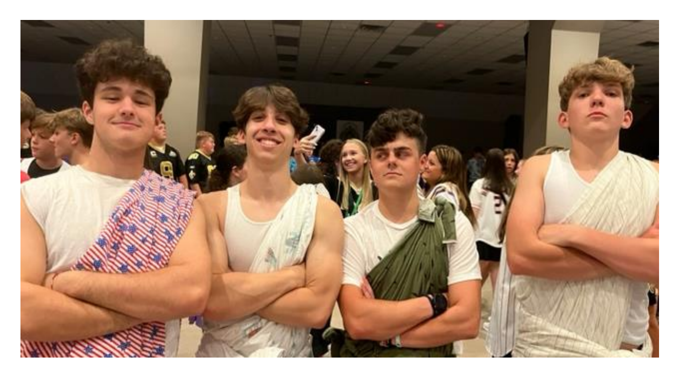
Right: Students having fun at Back-to-School Dance