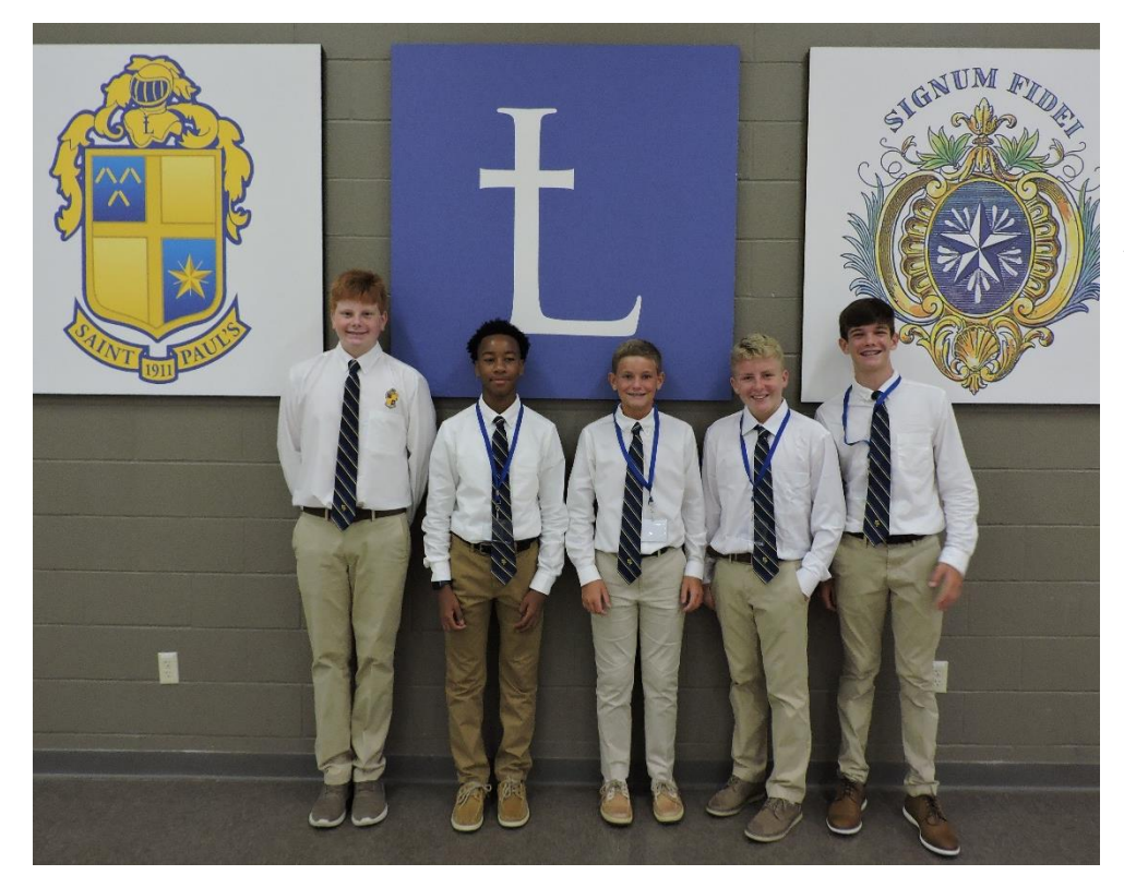
Left: Young Lasallians waiting for their yearbook and school ID picture taking session.