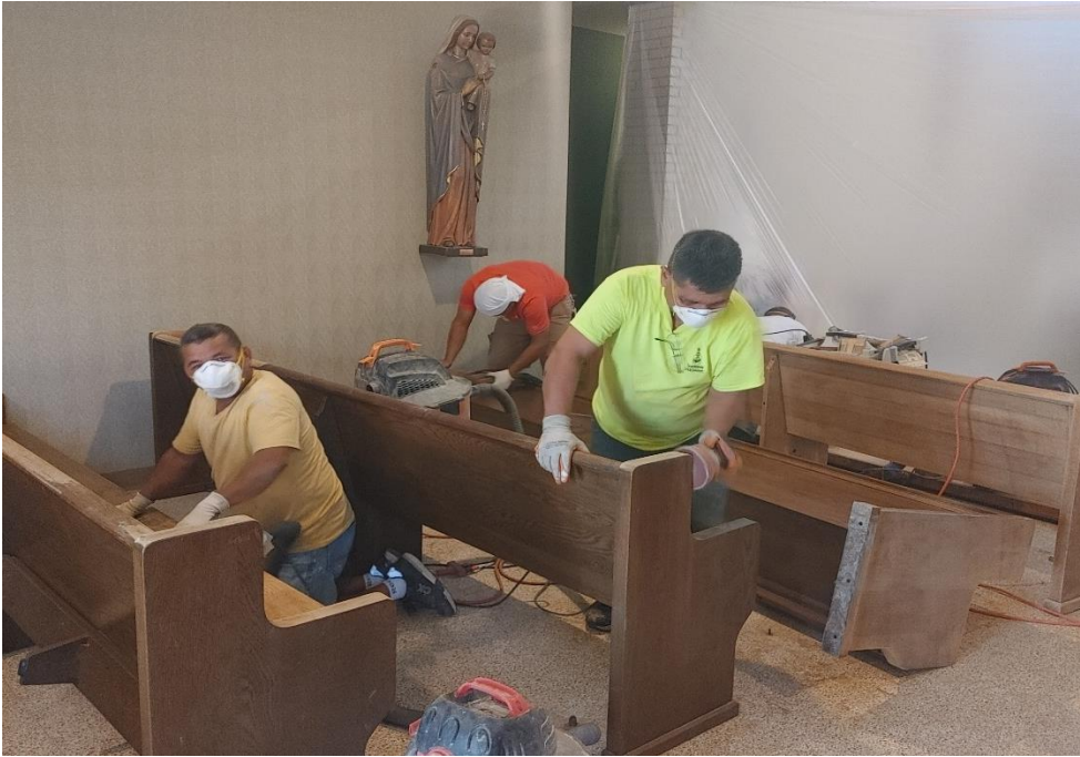
Left: Workers prepare the pews for refinishing.

Chapel Refurbishing: Last year we noticed water stains on the ceiling of Our Lady of Peach Chapel. Upon further inspection we realized that the old roof needed immediate replacement before more damage was done. This led to floor refinishing, ceiling repair and repainting and now, finally, the refinishing of the 60+-year-old pews. These improvements should give the chapel a new refreshed look just in time for the opening of school.