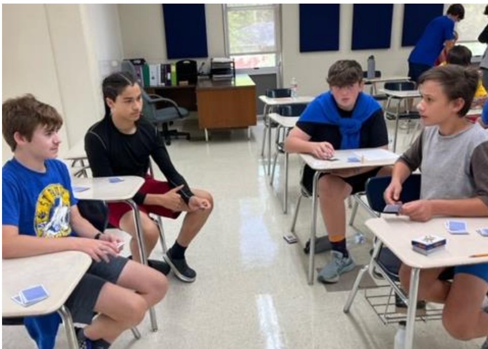
Left: Math Booster students work together to solve problems.

The annual Math Booster and Algebra Bridge Workshops were a huge success this summer. Our newest Wolves brushed up on their basic math skills while our older students focused on specific algebra skills needed for their next math course.