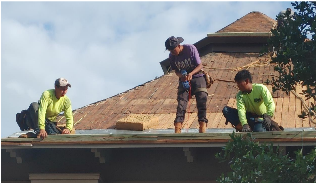
Left: Roofers work on the theater roof.

Theater Completion: This summer work was finally completed on the much storm-delayed renovation of the 120-year-old Theater (Odeon) building. Significant shoring work needed on the foundation was an unpleasant discovery when we began the project. Workers have since made the building structurally sound, painted, reroofed, added insulation, and upgraded the backstage area. Still to come: upgraded sound and AV equipment and possibly new seating (depending on the budget).