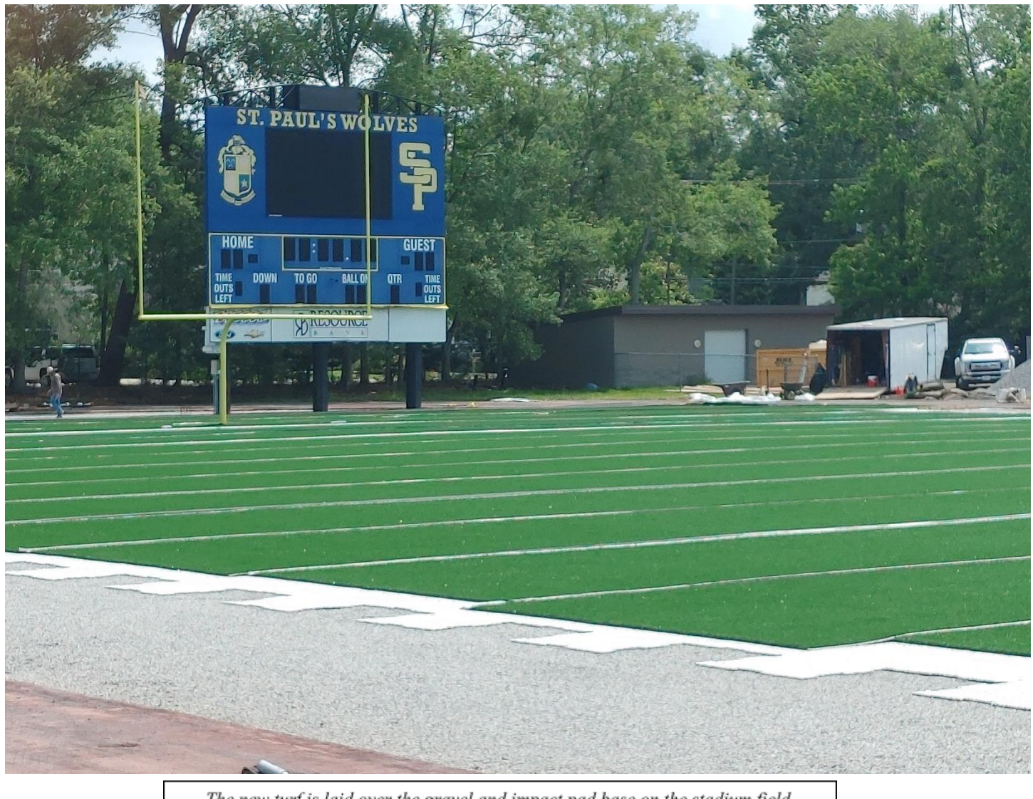
The new turf is laid over the gravel and impact pad base on the stadium field.

• If you need help, please let a member of the clergy, a Catholic School Administrator, a Director of Religious Education, or your youth minister know.