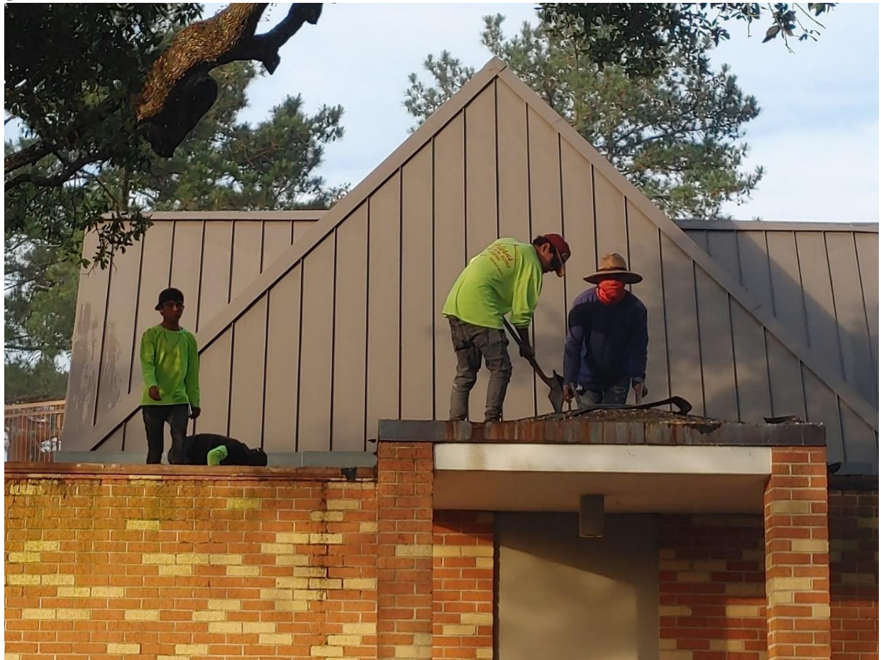
Above: Workers remove the old chapel roof to prepare the surface for the new roof.