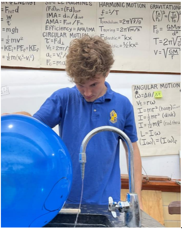
St. Paul's Physics students observe the nature of electricity by creating static charges with balloons, cellophane tape, combs, and other items. They used the charged items to cause free electrons to migrate in other objects such as paper and aluminum cans. They were also able to 'bend' a stream of water due to the polarized nature of water molecules.