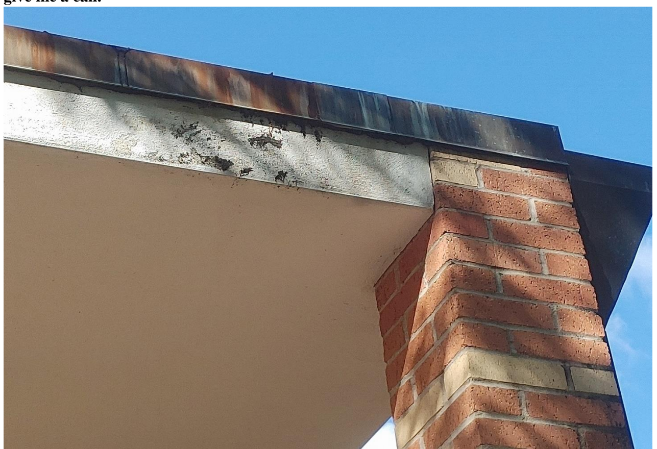
Flashing and facia show their age at Our Lady of Peace Student Chapel.

Interested in helping fund these repairs and improvements to the chapel? Please give me a call.