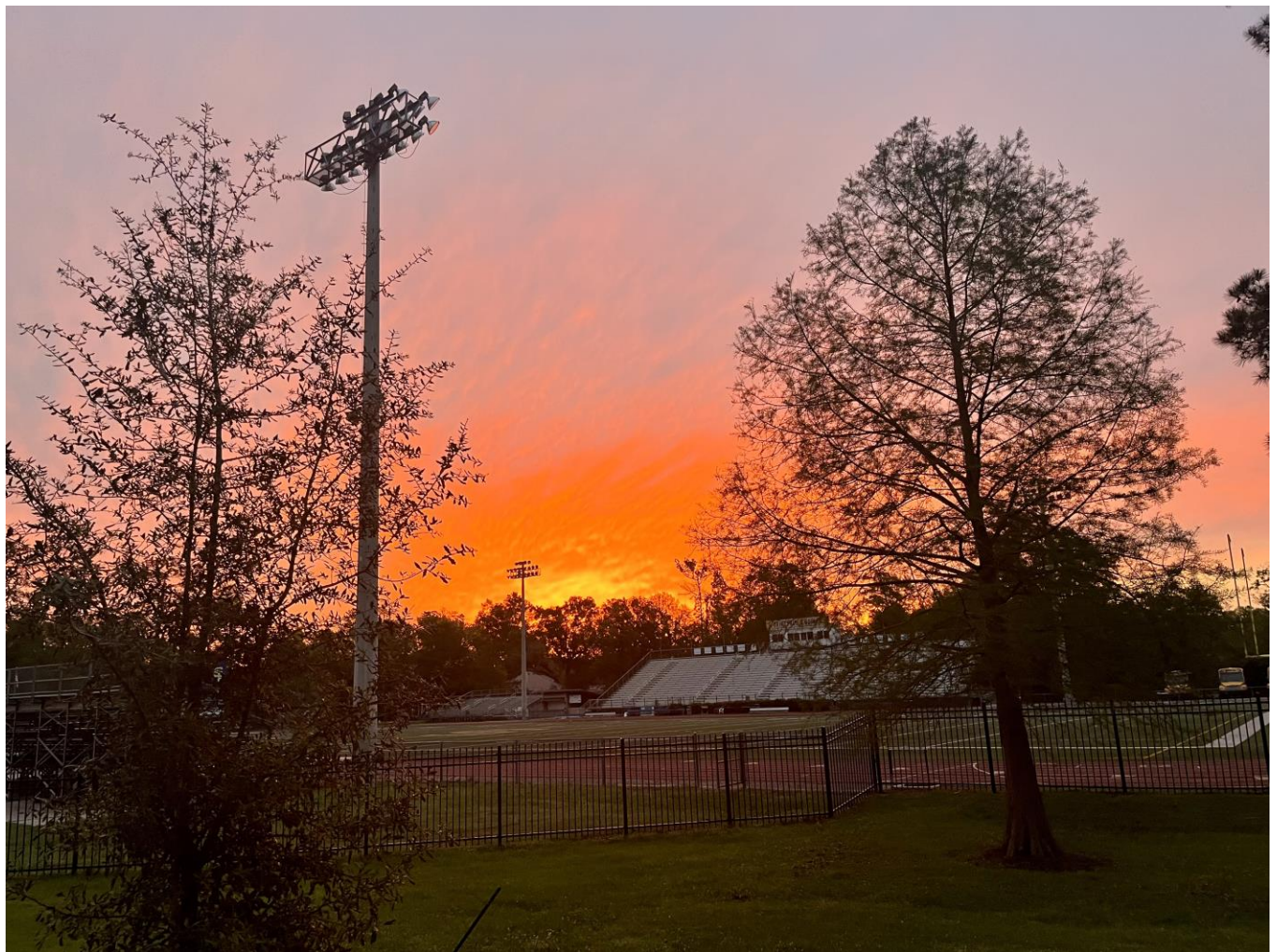
Sunrise over Hunter Stadium earlier this week.