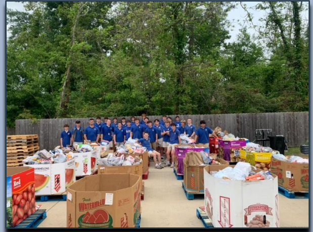
The Northshore Food Bank is well stocked for the summer months.