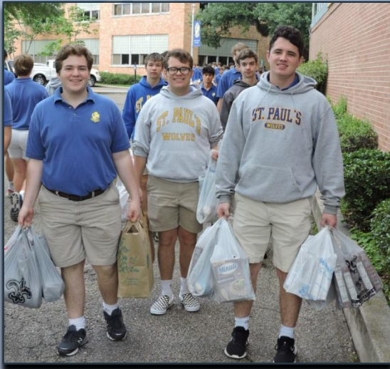
Students assist with carrying food to the loading area.