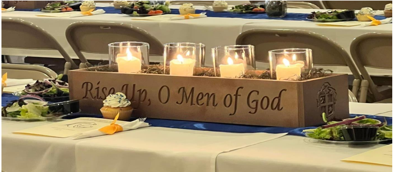
Table decoration from Mother-Son Dinner

ANNUAL APPEAL AND GRANDPARENTS: We are blessed with many supportive grandparents. Many schools solicit donations from grandparents directly. Again, I do it differently than other schools that directly solicit grandparents. I ask that you inform your son's grandparents or, if you want, I'll be happy to send them the information directly if you wish. Just provide me with the information. I do not want to ask grandparents without your consent but we need their support. I have already received a number of grandparent gifts. Again, no gift is too small – and, of course, no gift is too large.