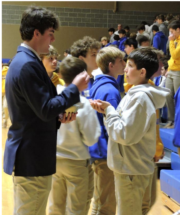
Food for the body and food for the soul.