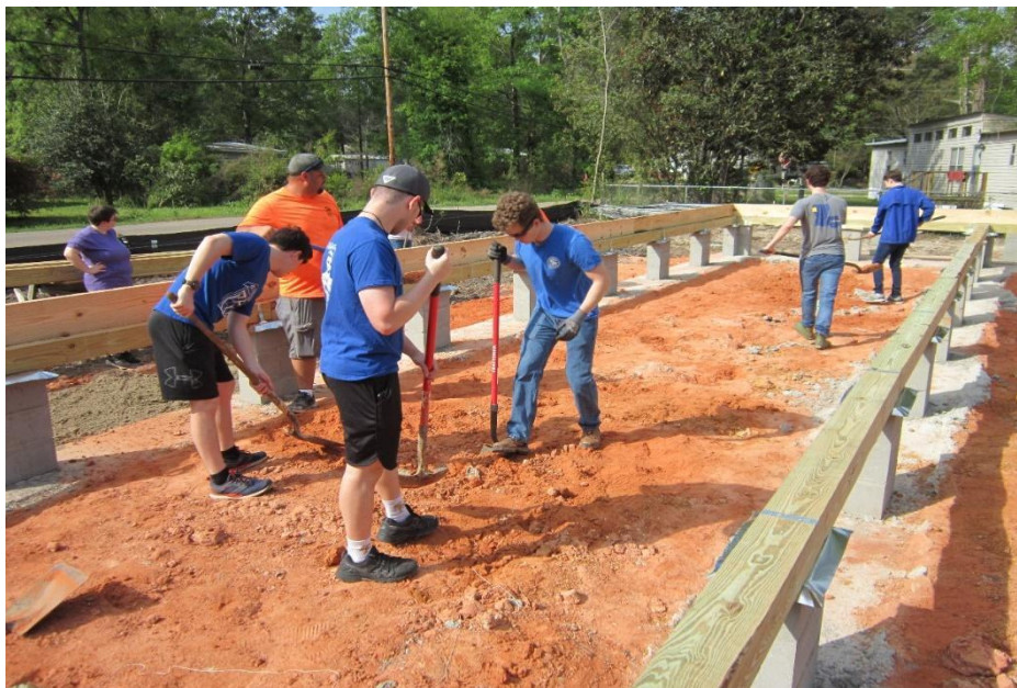
SPS boys spreading some red clay and love of neighbor.

HABITAT FOR HUMANITY CLUB: From Mr. Pichon, Moderator: On March 11, 7 awesome guys showed up and worked so hard that we finished early. A new house is in the very early stages and we needed to smooth out the ground. We took shovels and spread the red clay that was piled up where the foundation was recently built. Then we unloaded 3 truckloads of sand to spread on top of the red clay which made it smoother. What we did prepared the way for college students who arrive Monday (March 13) to spend their spring break helping others.