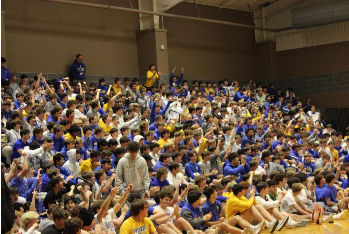
Students cheer on the SPS team!