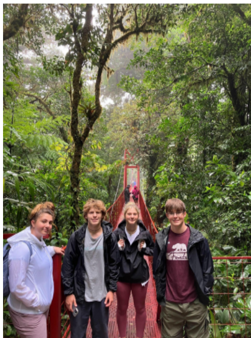
Students from SPS and SSA enjoy a trip through the Costa Rican rainforests.