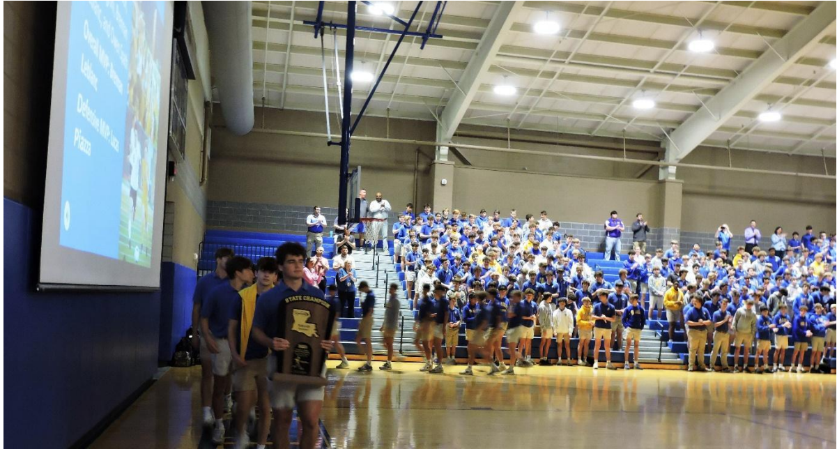
The State Championship soccer team parades around the gym with their trophy to the enthusiastic applause of the student body.