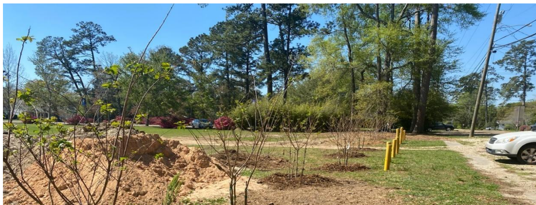
Eagle Scout Project trees along 14 th Avenue