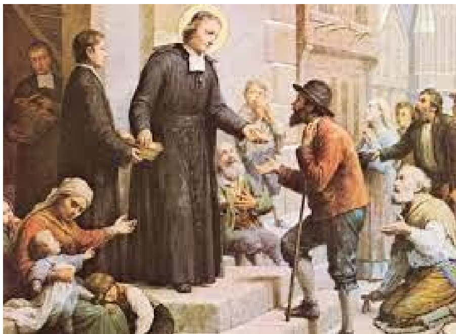
Image of St. John Baptist De La Salle giving away his fortune in Reims, France.

I encourage all of us, teachers and parents, to consider “what feeds our students/sons” and what “gets facetime.” Let’s use the season of Lent to give them the “means that are easy and accommodated to their age” so that “when older they will have acquired these maxims as a kind of habit and will practice them without great difficulty”.