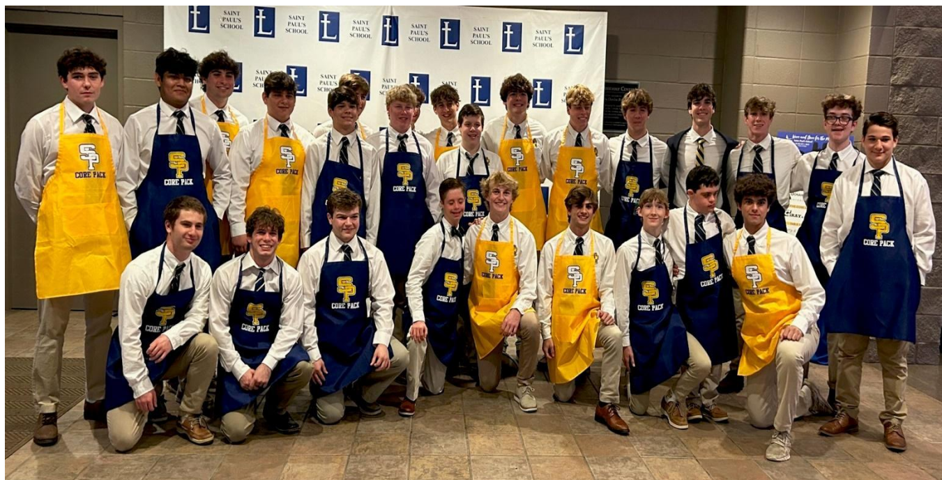
From the Tuesday Student Assembly: