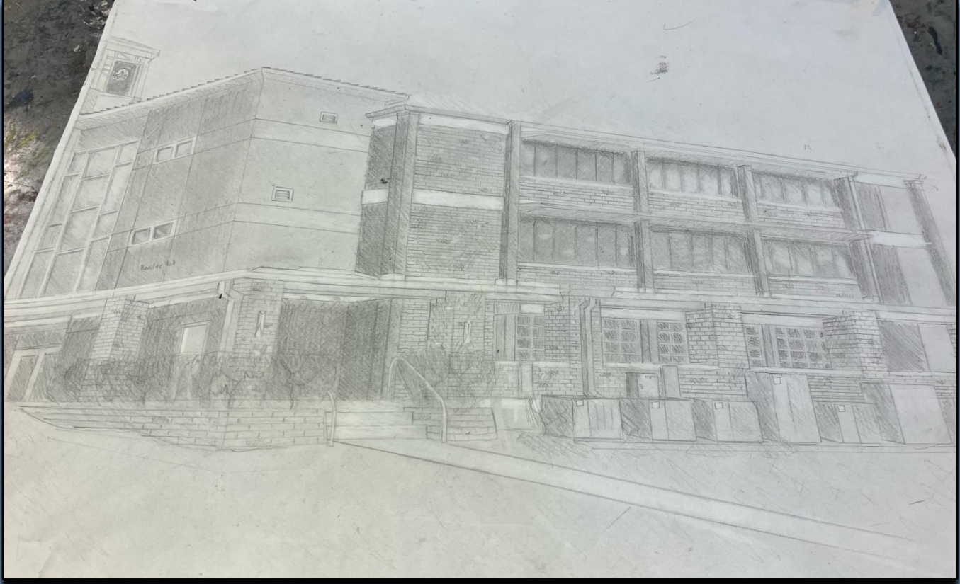
Benilde Hall Pencil on Paper by Theo Hadskey '26