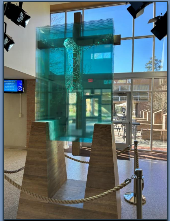
Glass sculpture in La Salle Hall