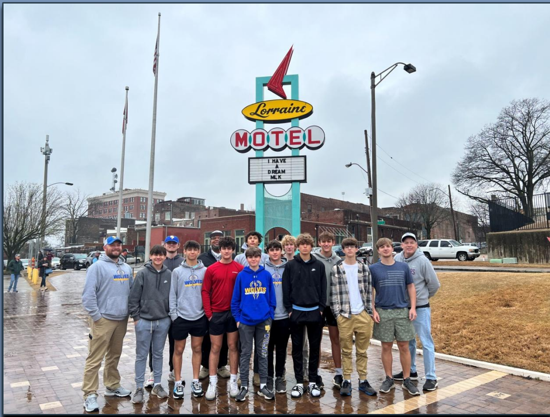
Lacrosse students visit the National Civil Rights Museum at the Lorraine Motel in Memphis.

by Aaron Falkenstein Head Lacrosse Coach