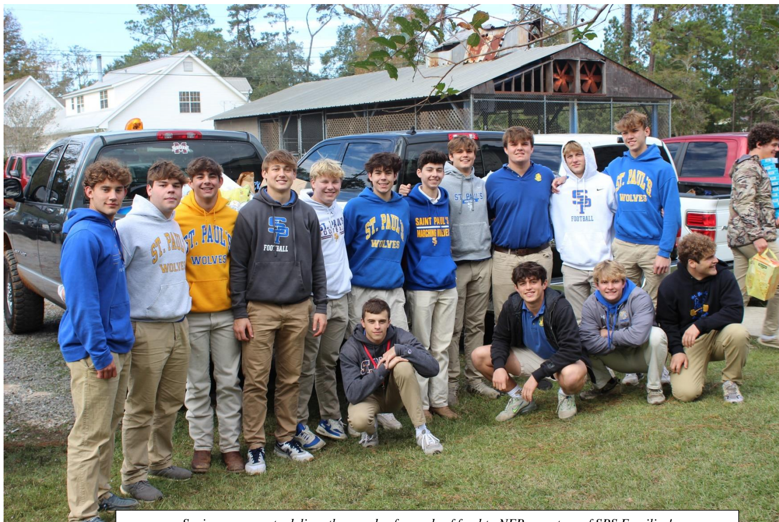
Seniors prepare to deliver thousands of pounds of food to NFB, courtesy of SPS Families!