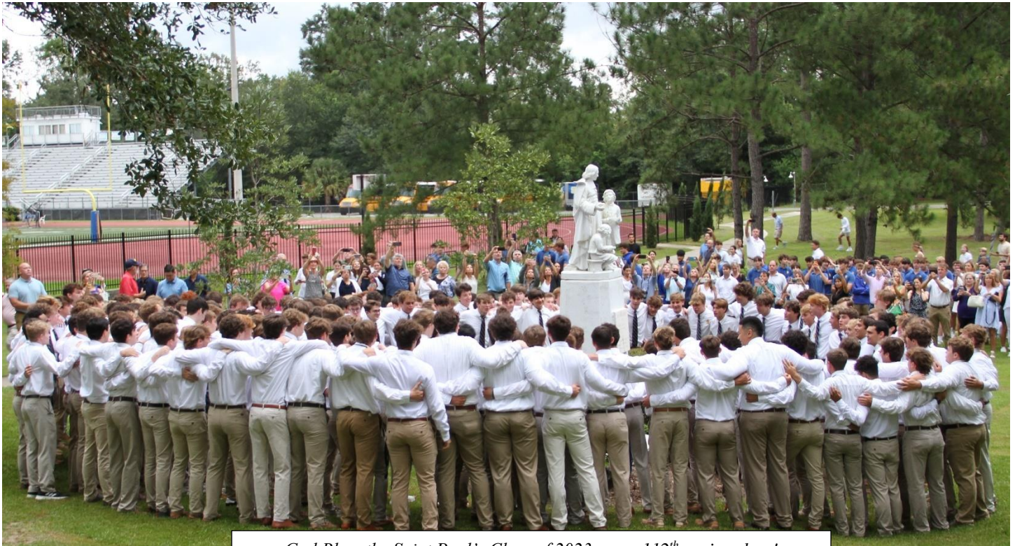
God Bless the Saint Paul's Class of 2023 – our 112 th senior class!