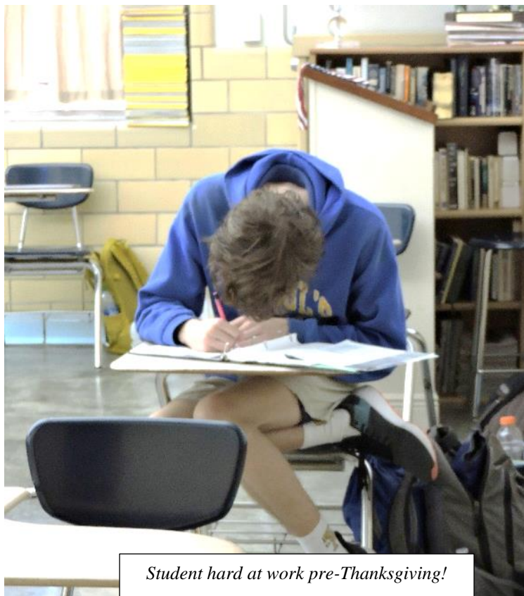
Student hard at work pre-Thanksgiving!