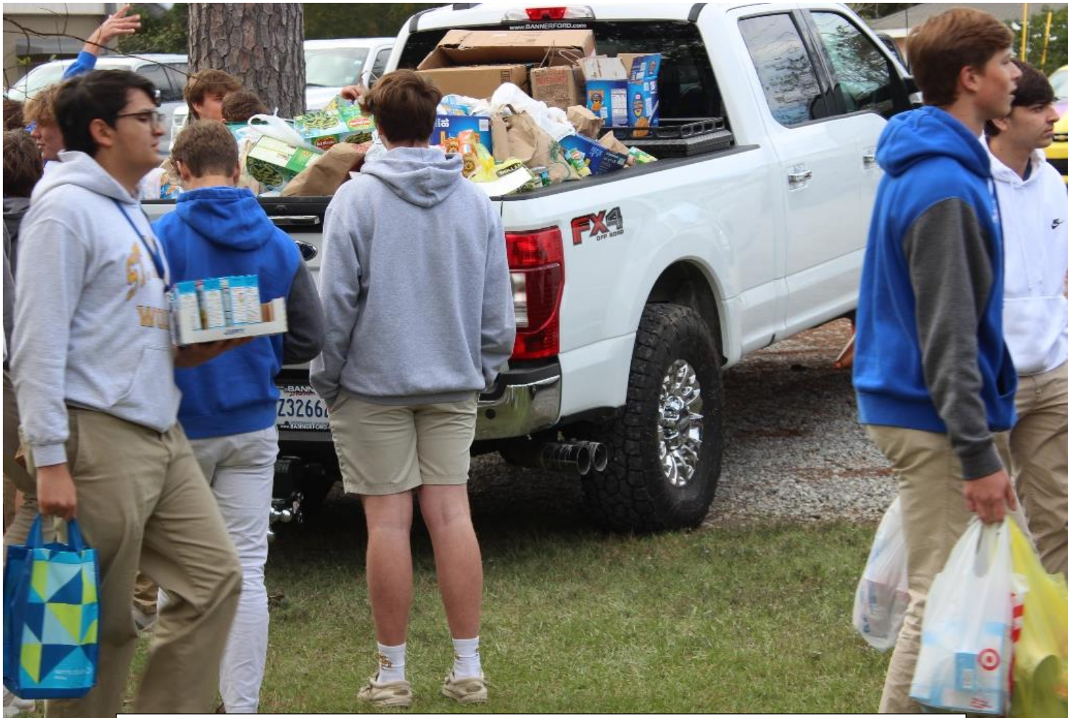
Students load thousands of canned goods into trucks for delivery to Northshore Food Bank, courtesy of SPS Families – a Lasallian core principle.