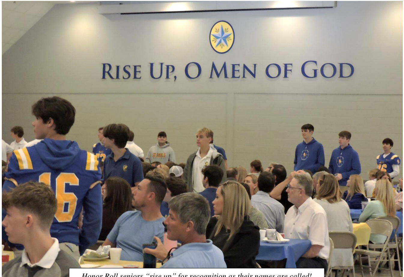
Honor Roll seniors "rise up" for recognition as their names are called!

Mon, Nov 21 – Sun, Nov 27 – Thanksgiving Holidays! Enjoy! Note: Now that we are on Thanksgiving holiday, the newsletter won't list all the many events (mostly sports – related) for this week. The newsletter also needs a break (and so do you) and, hence, won't publish next Sunday. Next edition is Sun, Nov 27. Check Plus Portals calendar for events.