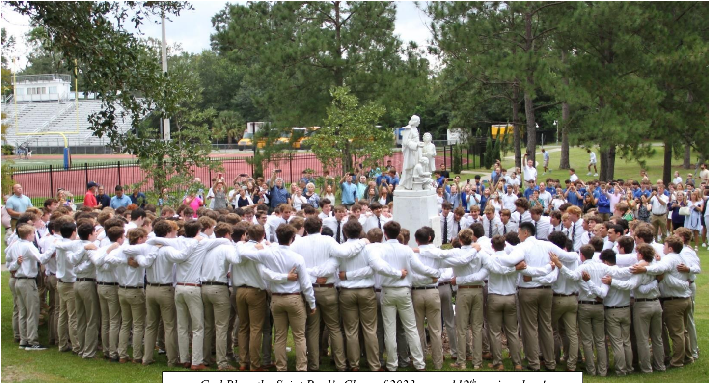
God Bless the Saint Paul's Class of 2023 – our 112 th senior class!

Thanks to Expressions for making this year's pics so memorable.