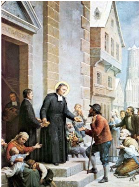
St. La Salle distributes bread to the poor.

One of those authentically Catholic values – as espoused by Pope Francis and enshrined as one of the seven social justice issues by the US Catholic Conference of Bishops – is concern for the poor -- not coincidentally one of our five Lasallian core principles.