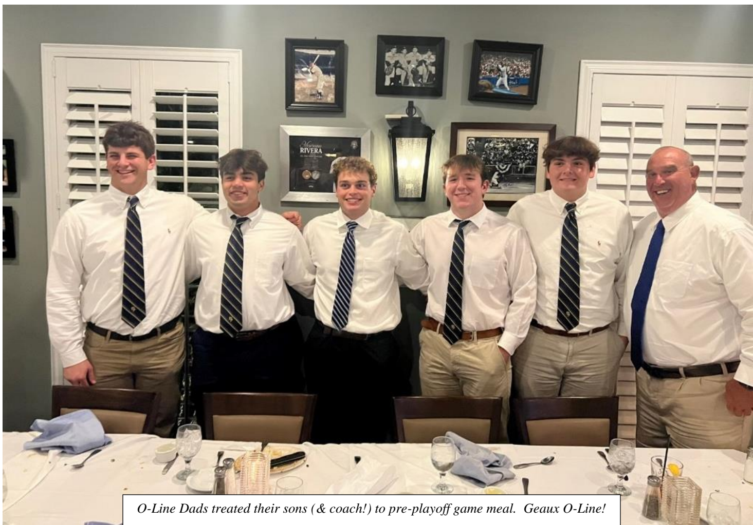
O-Line Dads treated their sons (& coach!) to pre-playoff game meal. Geaux O-Line!