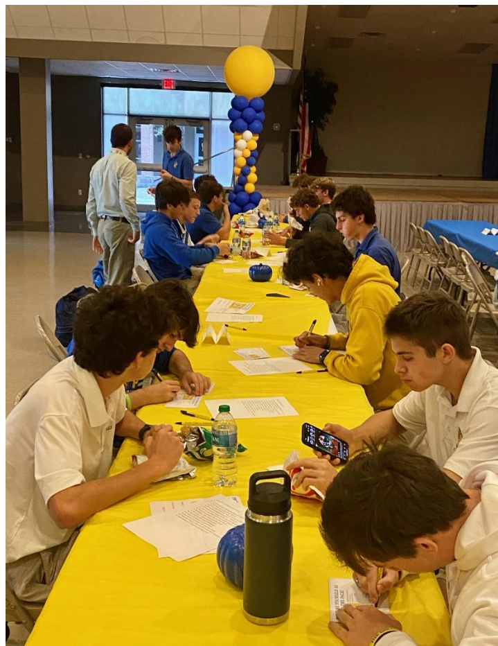
Student hosts write thank you notes to prospective students who attended Open House – and receive a Chick-fil-A lunch for their efforts!