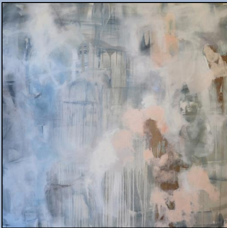
Original Kris Muntan painting