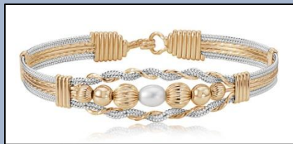
Lovely gold and silver bracelet from Deluca's.