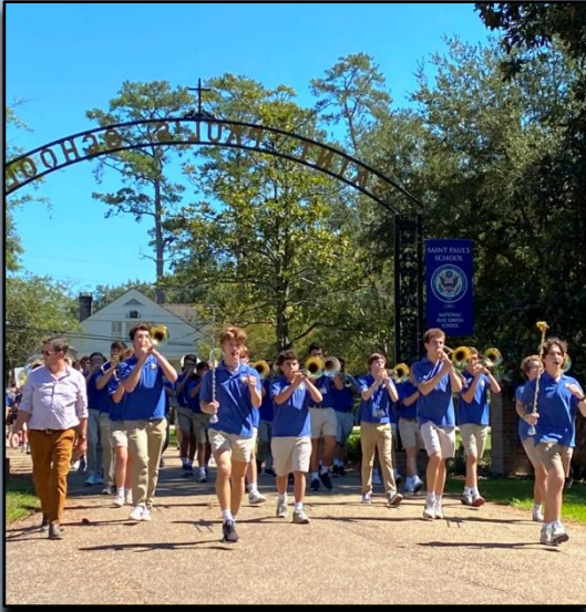
The Marching Wolves lead the student body during the parade to celebrate Saint Paul's birthday.