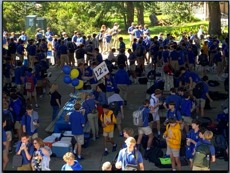
Saint Paul's Mothers' Club provide snacks for the student body.