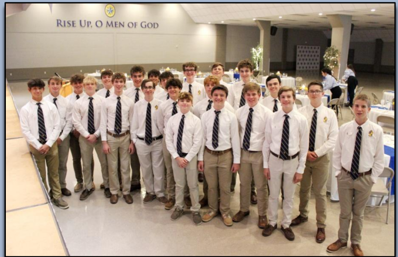
Student Ambassadors assist with dinner throughout the evening.