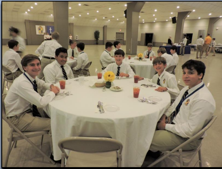
Pre-freshmen students anticipate their four course meal.

Saint Paul's pre-freshmen students had the opportunity to refine their dining skills with a course sponsored by the Saint Paul's Development Office. The students were divided into groups and the training took place during lunch over a period of three days. The lunches were held in the Briggs Assembly Center on September 7, 8, and 22 and were catered by Bosco's Italian Café in Mandeville. Tony Bosco's staff presented a program on dining etiquette which included tips on: setting the table, using the correct utensils, taking and passing food, appropriate dinner conversation, and ordering, treating and tipping wait staff. Parent volunteers assisted with serving the pre-freshmen their meals. The students enjoyed the lessons and improved their manners, but the best part of the class was the delicious lunch of corn chowder, Caesar salad, chicken and pasta Alfredo, and bread pudding. The students returned to class for the rest of the afternoon, well-mannered and well-fed.