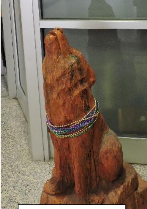
The Howlin' Wolf gets festooned with beads!

Welcome to the eighth and penultimate week of the Third Quarter – and the final week before the Mardi Gras / Beginning of Lent Holidays! It is important to note that our week off is really for two reasons: Mardi Gras for two days and the beginning of Lent for three.