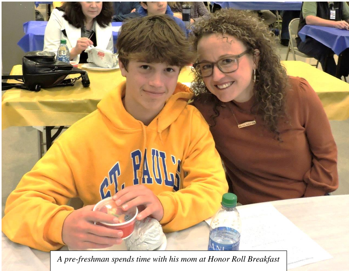
A pre-freshman spends time with his mom at Honor Roll Breakfast