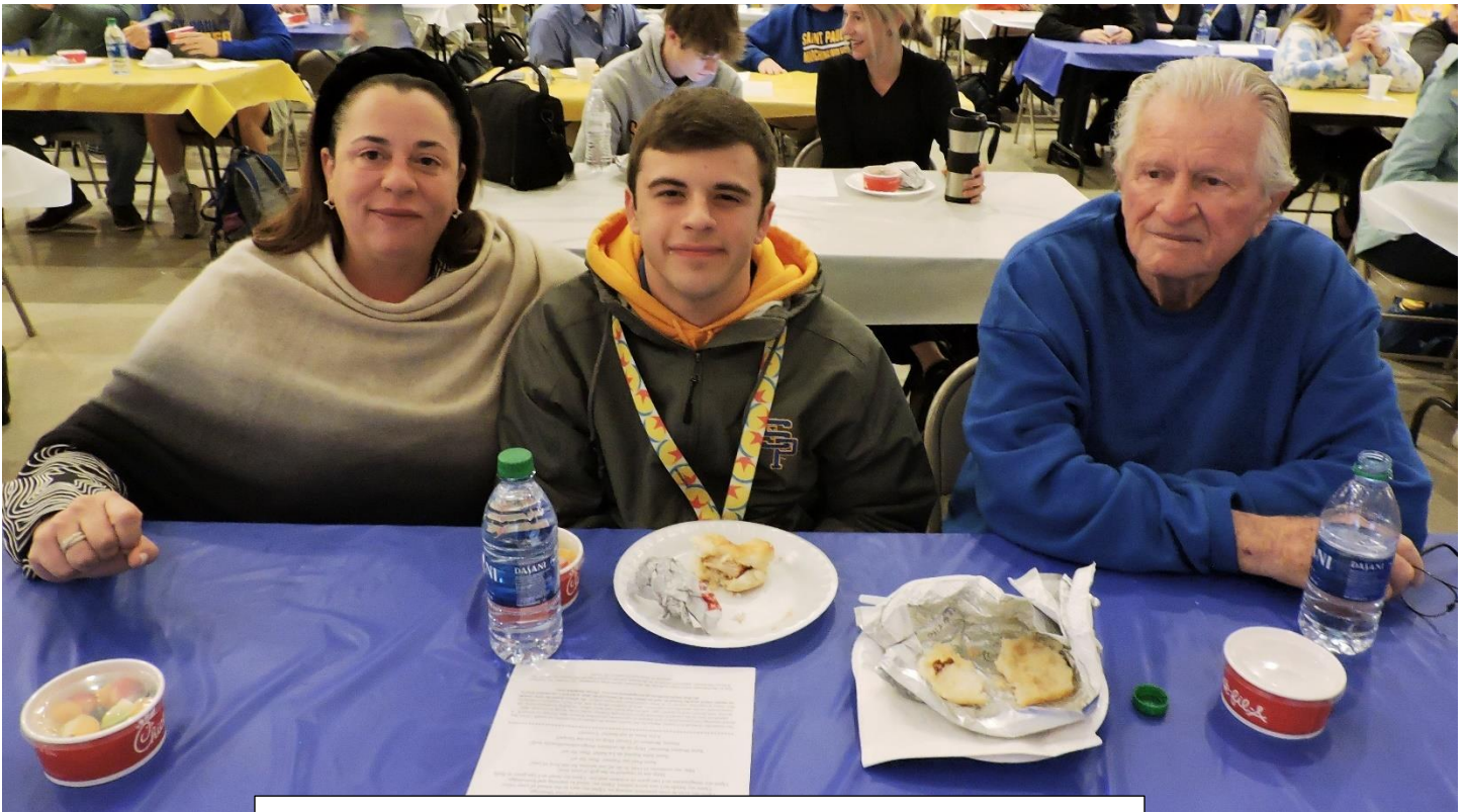
A junior family enjoys HR Breakfast on Thu!