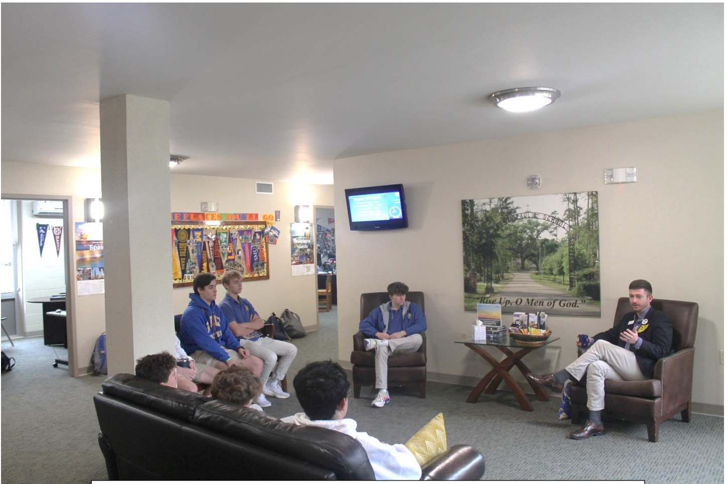
A rep from Spring Hill College meets with interested Wolves last week.

COLD WEATHER CLOTHING: Only Saint Paul's outwear is permissible in cool/cold weather. If your son needs an SPS sweatshirt and money is tight right now, just have him come see me. This will be handled confidentially and appropriately. ONLY SPS cool weather clothing is allowed.