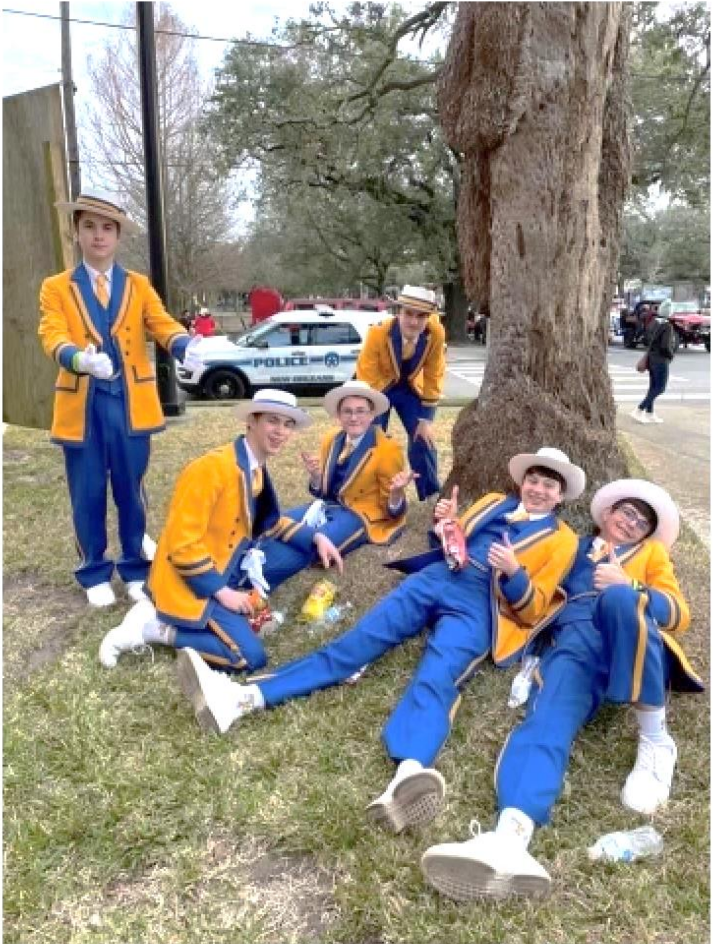
Marching Wolves chillaxin' before start of Cleopatra Parade Geaux Marching Wolves!