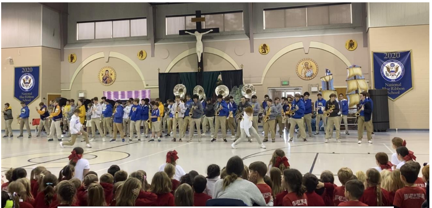
Marching Wolves entertain the OLL student body at their Catholic Schools Week Pep Rally. Like SPS, OLL is a multiple Blue Ribbon School awardee – and our largest feeder school!