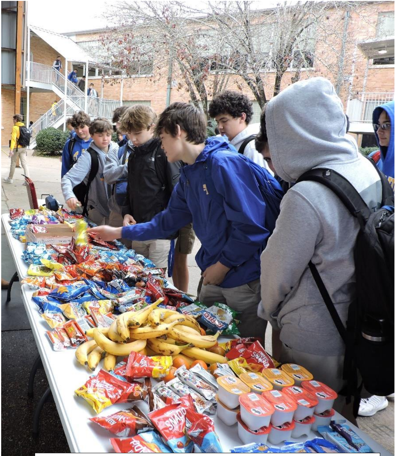
Lots of choices for the students on last Tuesday's snack day. The healthy stuff is to your left, guys! Thanks, Mothers' Club, for all you do for the students of SPS.