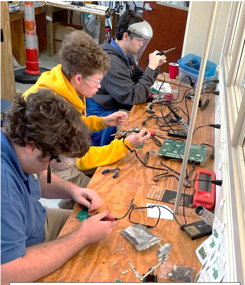
More high-tech STEM activities! I have no idea what they are doing but they tell me it's pretty cool.