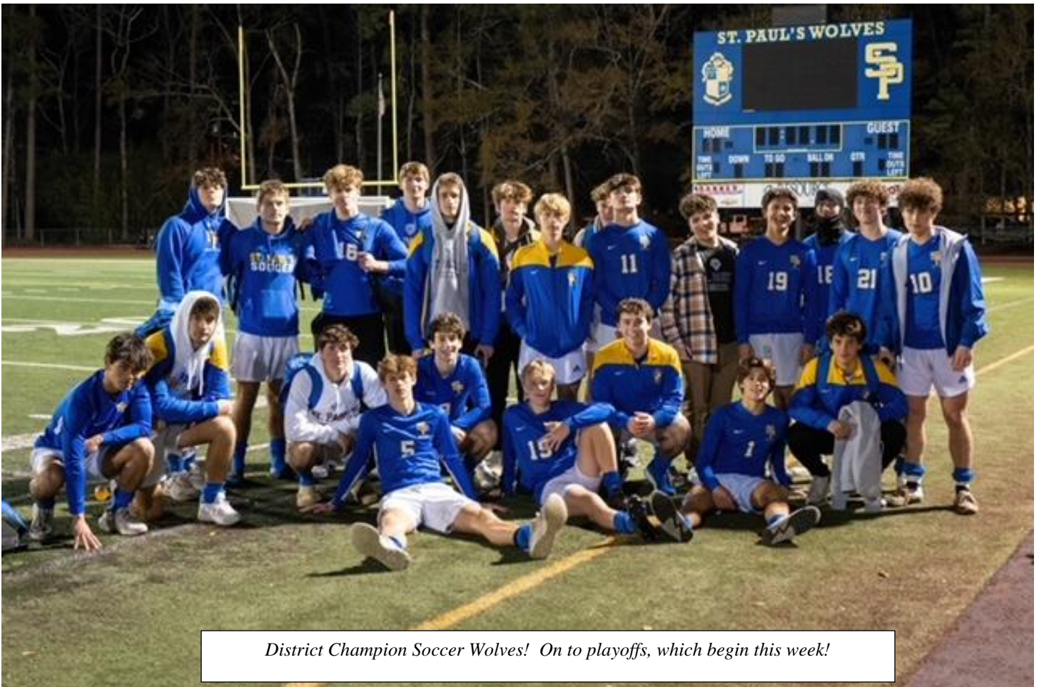
District Champion Soccer Wolves! On to playoffs, which begin this week!

BOOK STORE: All school supplies will be available for purchase, as well as St. Paul's apparel. Hours?