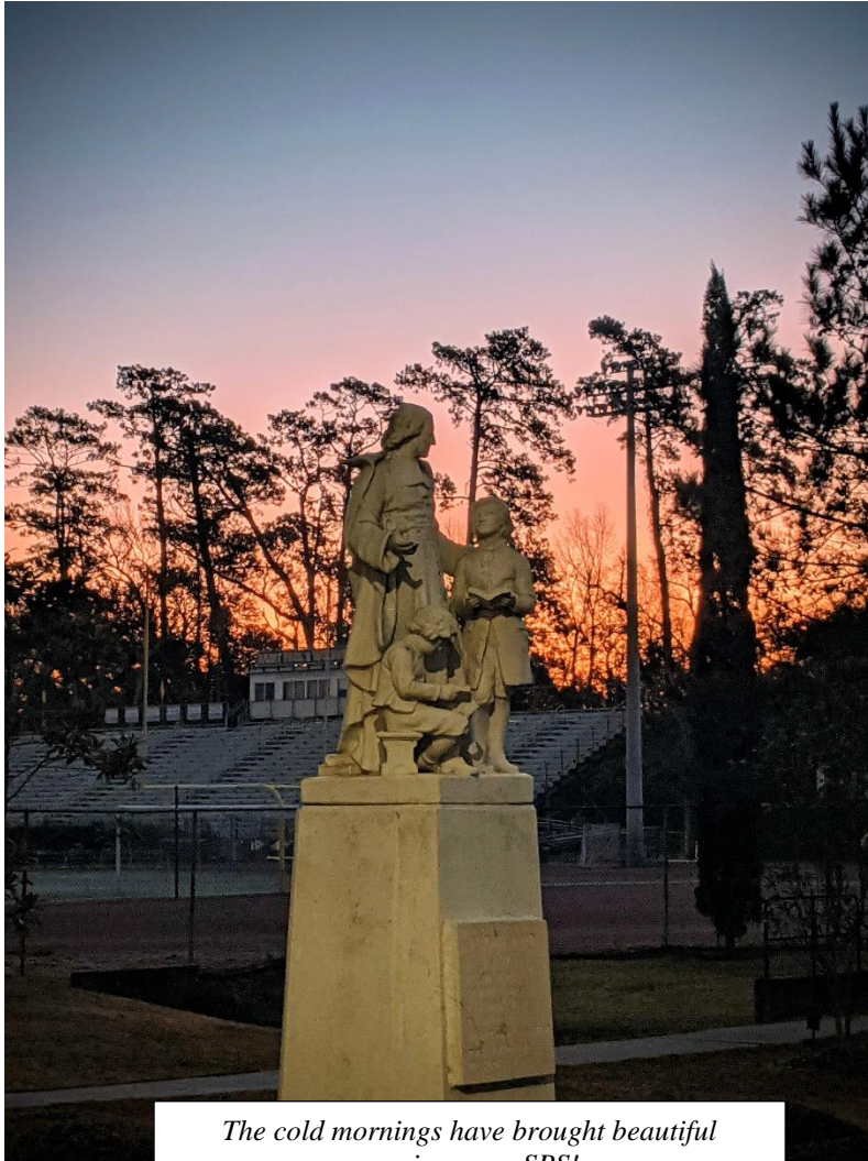
The cold mornings have brought beautiful sunrises over SPS!

Welcome to February! Today begins Catholic Schools Week, when Catholic schools throughout the US celebrate and affirm the Catholic identity of our schools. The National Catholic Education Association has designated the theme of the week as: "Catholic Schools: Faith. Excellence. Service."