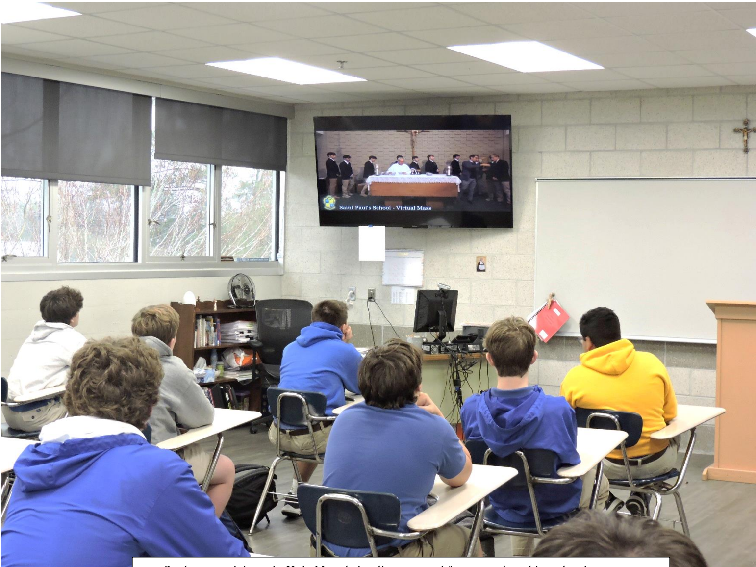
Students participate in Holy Mass being livestreamed from our chapel into the classrooms.