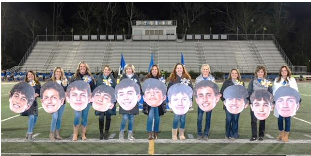
Soccer Senior Moms pose on Senior Night with their sons' "big head" pics!