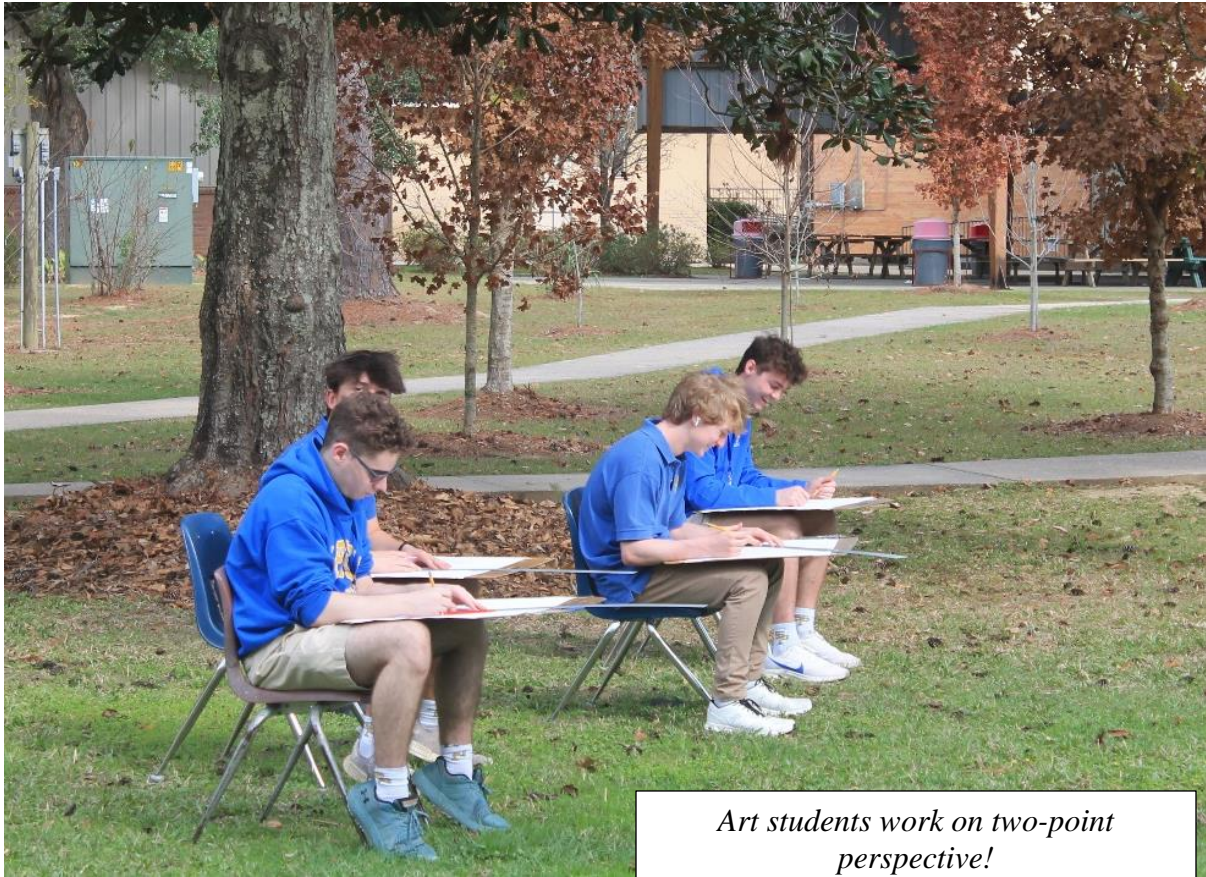
Art students work on two-point perspective!