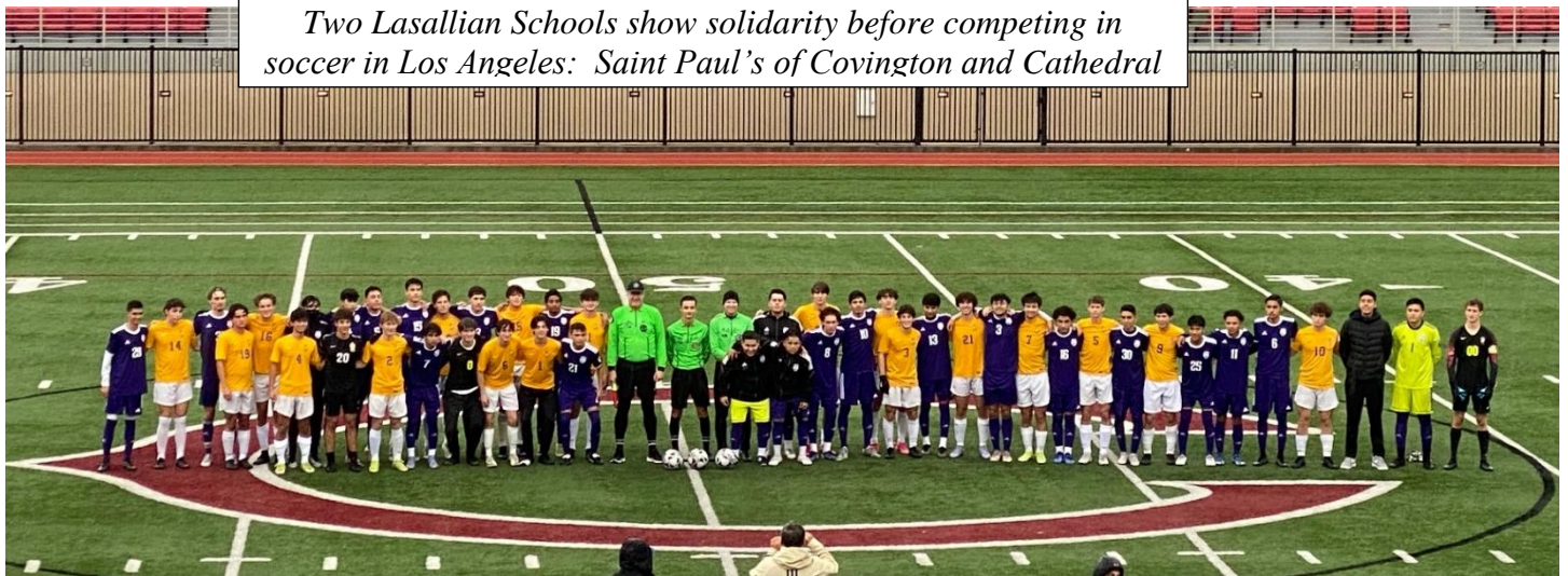
Two Lasallian Schools show solidarity before competing in soccer in Los Angeles: Saint Paul’s of Covington and Cathedral

APPLICATION LETTER EXCERPTS: Each year, I print unedited excerpts from the letters next year’s applicants write as part of the admissions process. Here is the first batch. Enjoy.