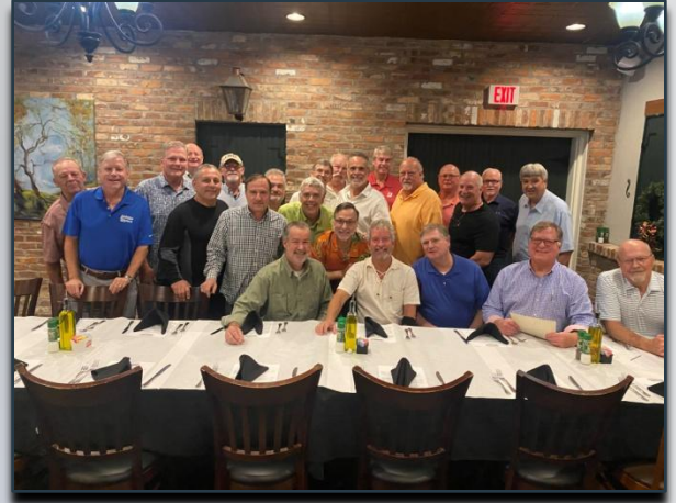
The class of 1975 gather for their Christmas luncheon.