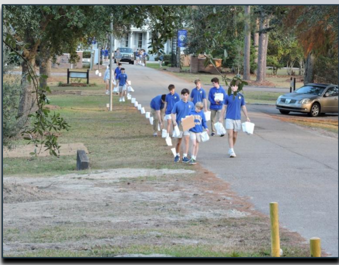
Students set up 2000 luminary bags around campus.