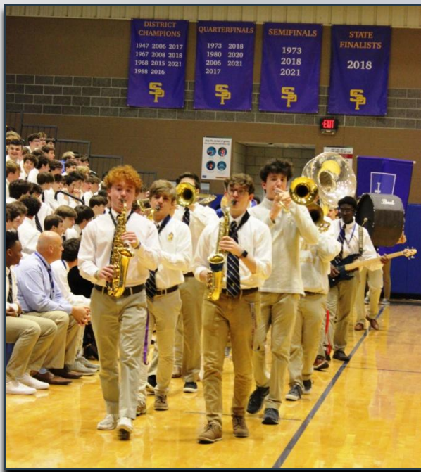
Saint Paul's School Jazz Band plays at National Blue Ribbon School Recognition Ceremony.