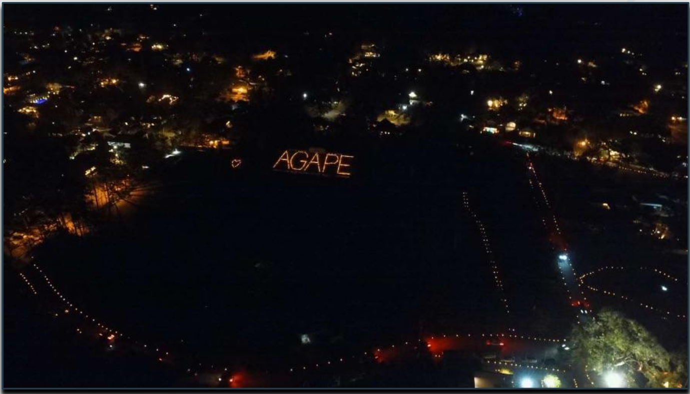
Saint Paul's Christmas Luminaries Thursday, December 2, 2021