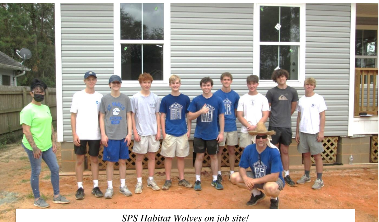
SPS Habitat Wolves on job site! # Concern for the Poor and Social Justice