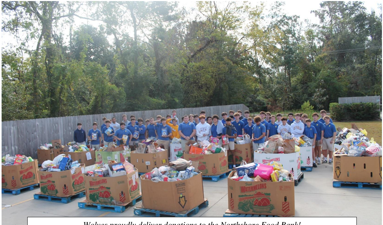
Wolves proudly deliver donations to the Northshore Food Bank! # Concern for the poor and Social Justice

HANUKKAH: Our Jewish brothers and sisters began their Hanukkah (or Chanukah) celebrations on the evening of Nov 28. They will celebrate until the evening of Dec 6. The eight-day Jewish celebration commemorates the rededication during the second century B.C. of the Second Temple in Jerusalem, where according to legend Jews had risen up against their Greek-Syrian oppressors in the Maccabean Revolt. Hanukkah, means "dedication" in Hebrew. Often called the Festival of Lights, the holiday is celebrated with the lighting of the menorah, traditional foods, games and gifts. We wish our Jewish brothers and sisters and blessed and joyous celebration of Hanukkah!