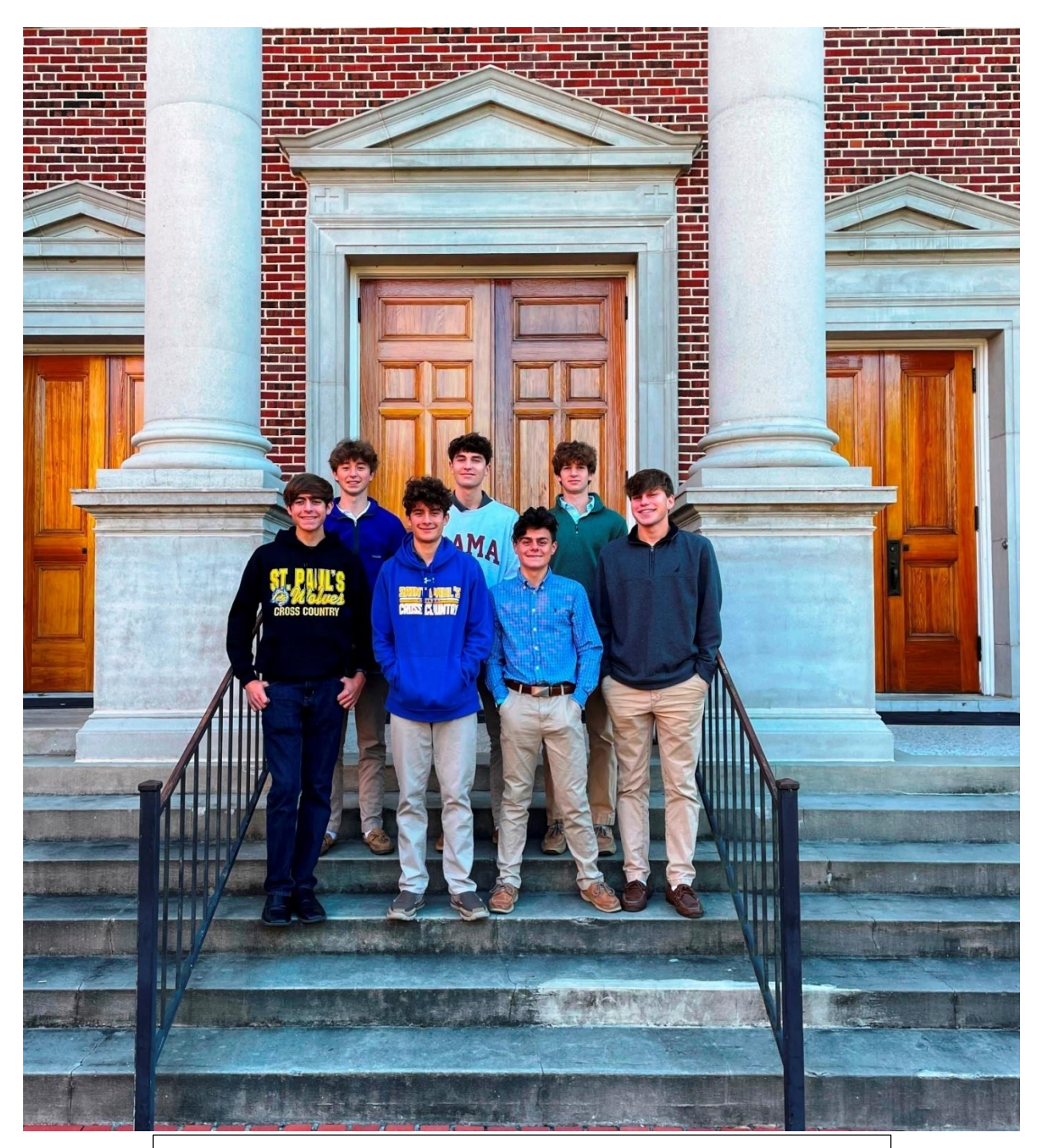
State Cross Country qualifiers continue the tradition of attending Holy Mass at St. Joseph Abbey prior to departing for the meet. #Faith in the presence of God

SOCIAL MEDIA II: Parents, speak with your sons about social media use. We have already dealt with issues. Inappropriate postings can have legal ramifications. In addition, SPS reserves the right to impose consequences on our students who misuse social media. And read about Tic Toc!