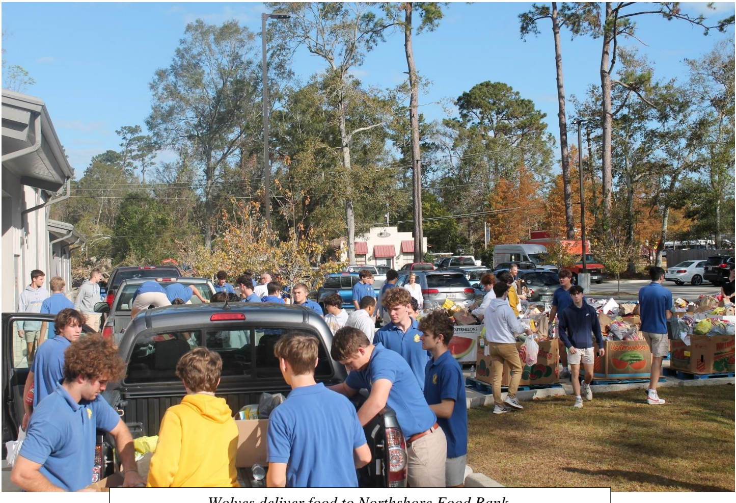
Wolves deliver food to Northshore Food Bank. #Concern for the poor and social justice