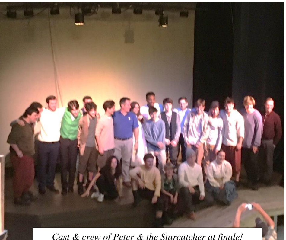
Cast & crew of Peter & the Starcatcher at finale! # Inclusive Community