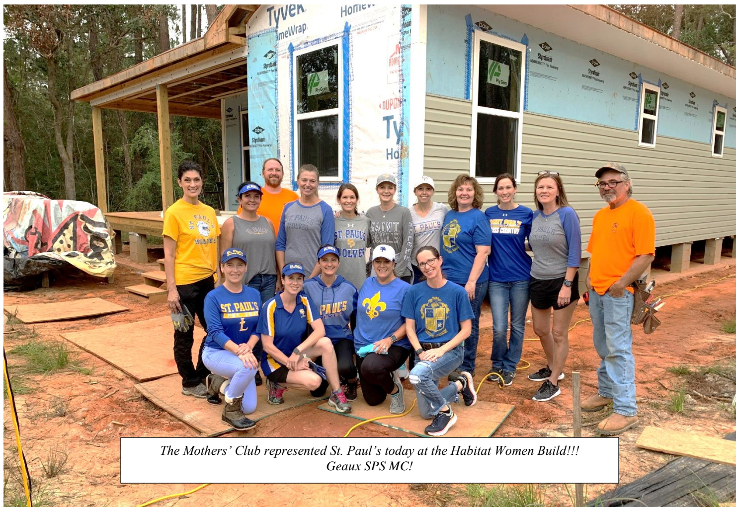
The Mothers' Club represented St. Paul's today at the Habitat Women Build!!! Geaux SPS MC!