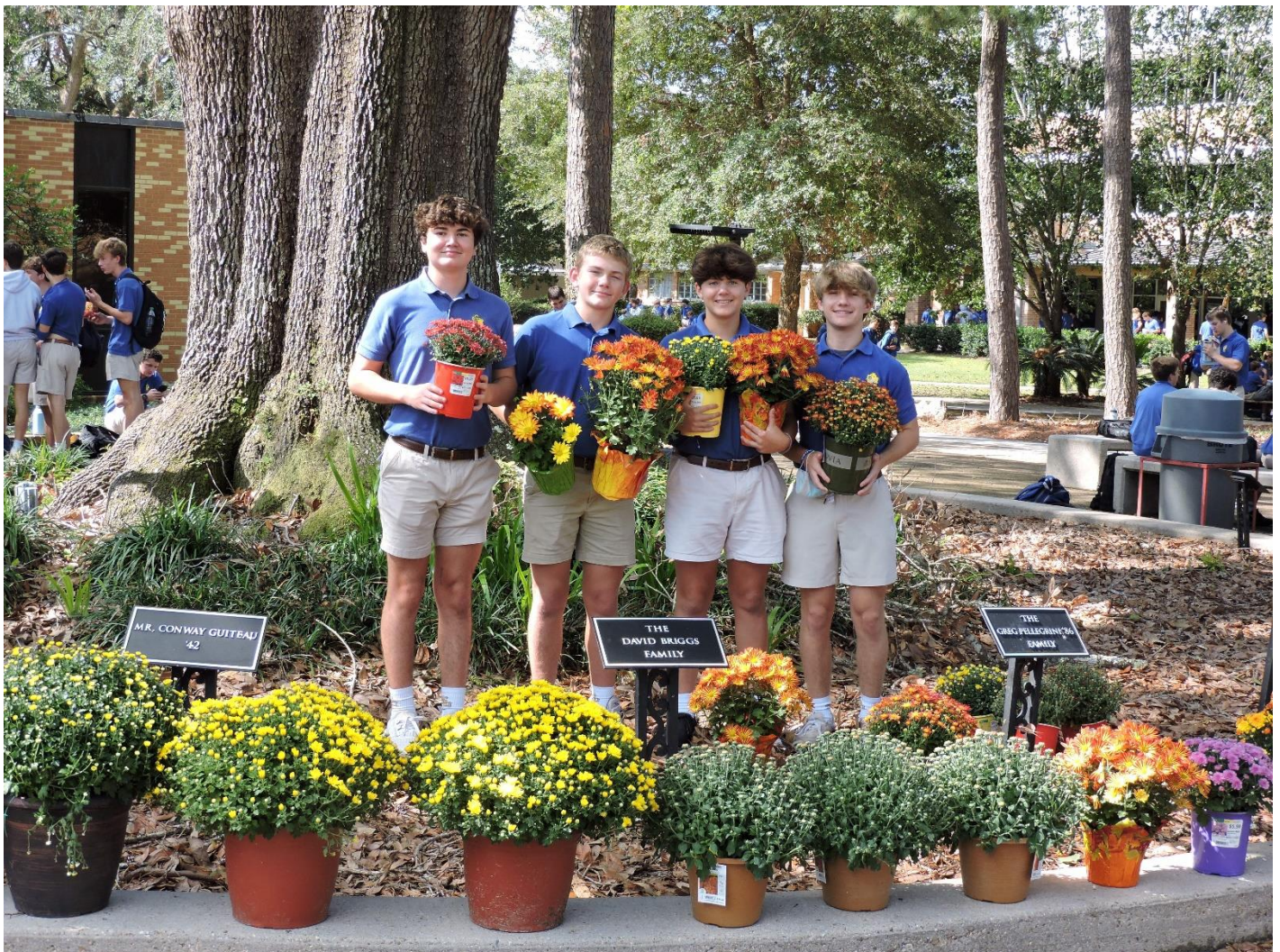
Boys help with Moms for Mums project!