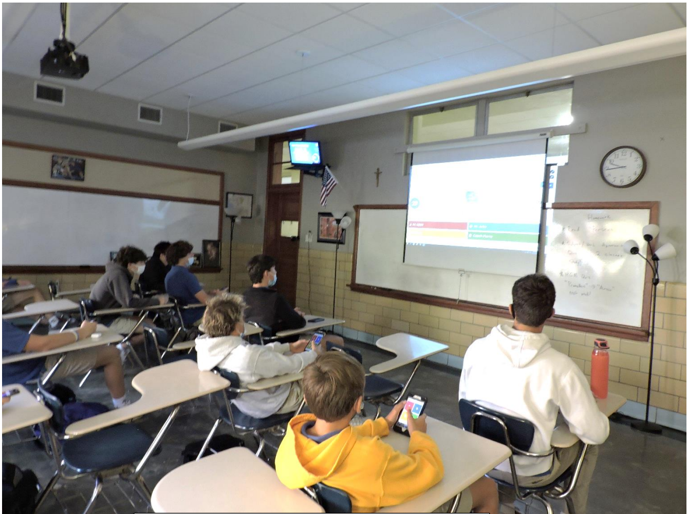
Students enjoy Kahoot during Wolf Pack last week.

HAND SANITIZING: School policy calls for each student to hand sanitize when entering each class. Ample supplies of hand sanitizer are in each classroom. Please encourage your sons to cooperate with this hygienic practice. As flu season approaches, sanitizing becomes more important than ever.