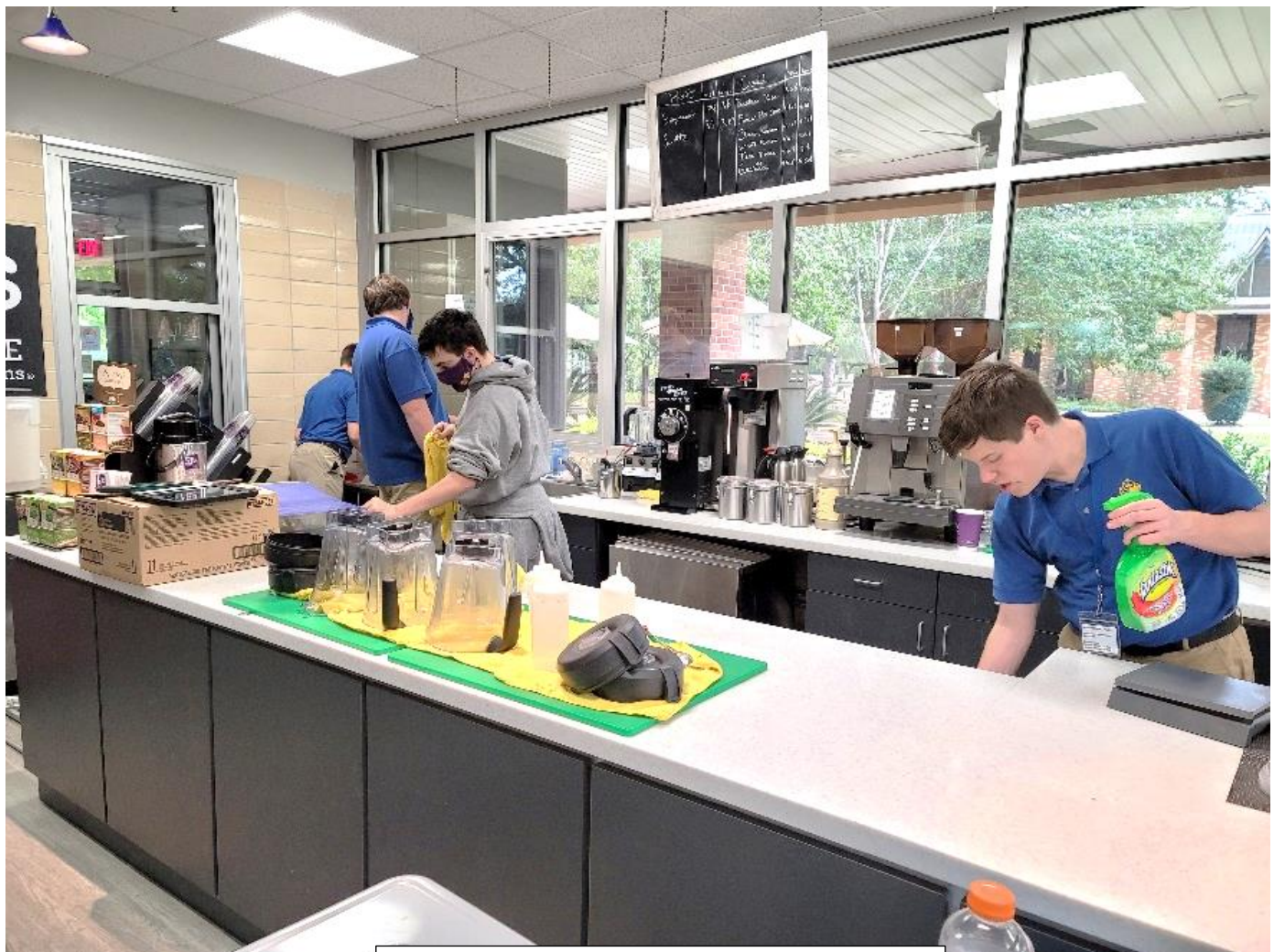
CORE Pack students work the PJ's Coffee Shop