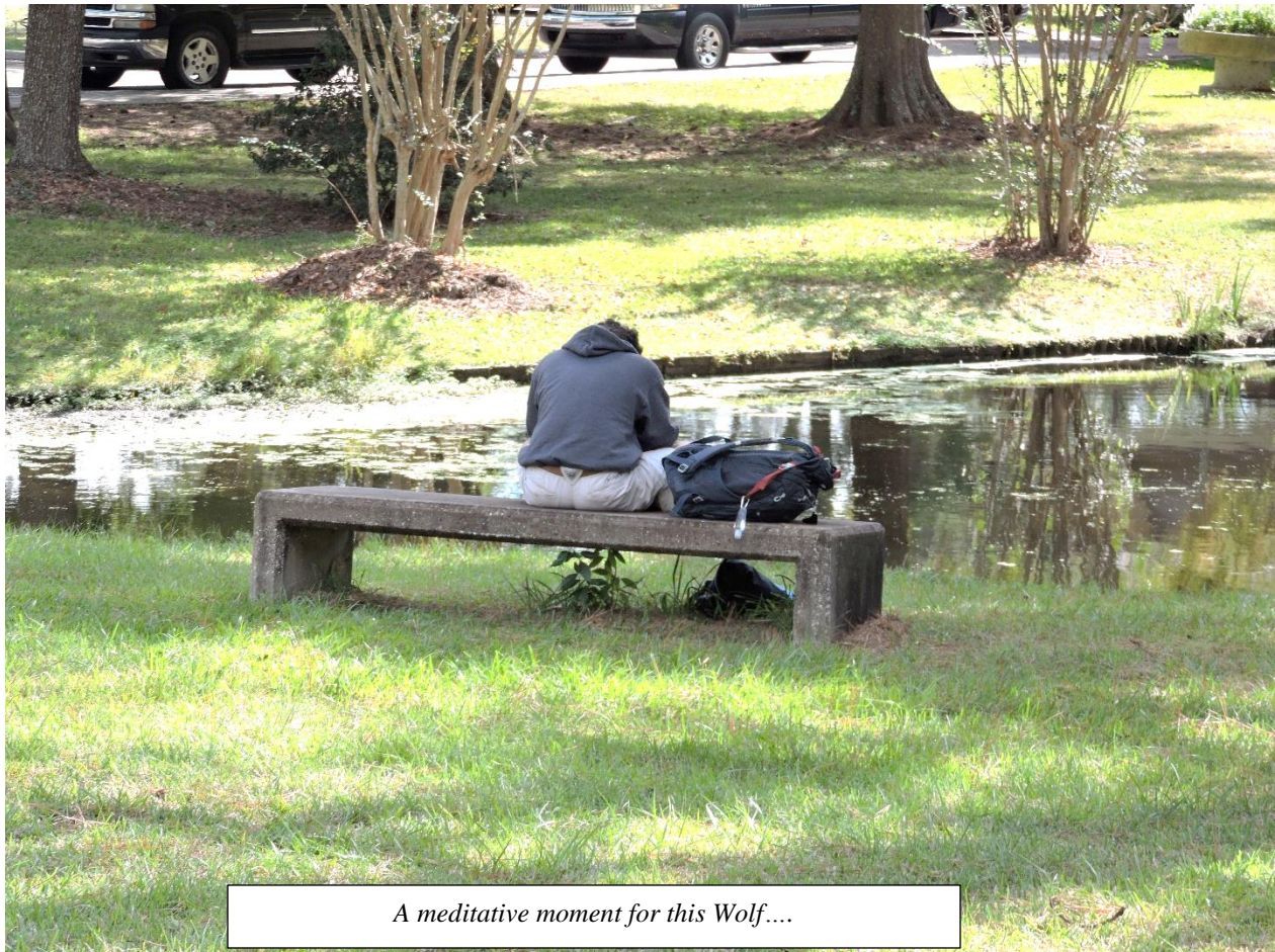
A meditative moment for this Wolf....