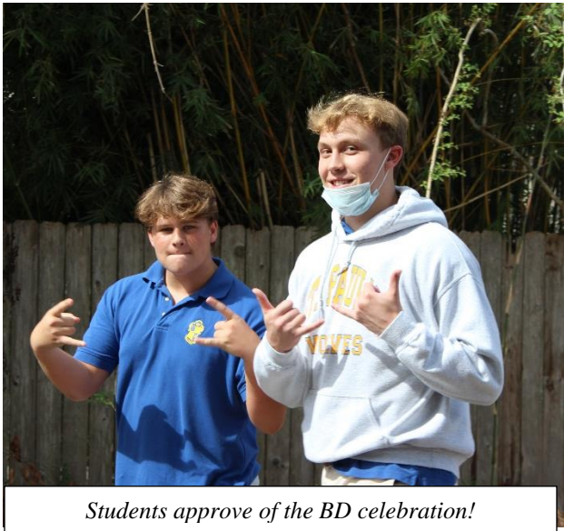
Students approve of the BD celebration!

EMERGENCY CLOSINGS: As with Ida, I remind all of our emergency or weather-related closing policy – which is to follow both the civil parish and / or the directives of the Archdiocese of New Orleans. Thus, if needed (and we hope it's not), Saint Paul's School will follow the same decision of closure as the public school system of St. Tammany Parish. School messaging will also be activated with updated information and situations unique to SPS. For multi-day closings, Saint Paul's reserves the right to re-open when our situation warrants, even if the public school remain closed, as was the case in Hurricane Katrina. e pray.