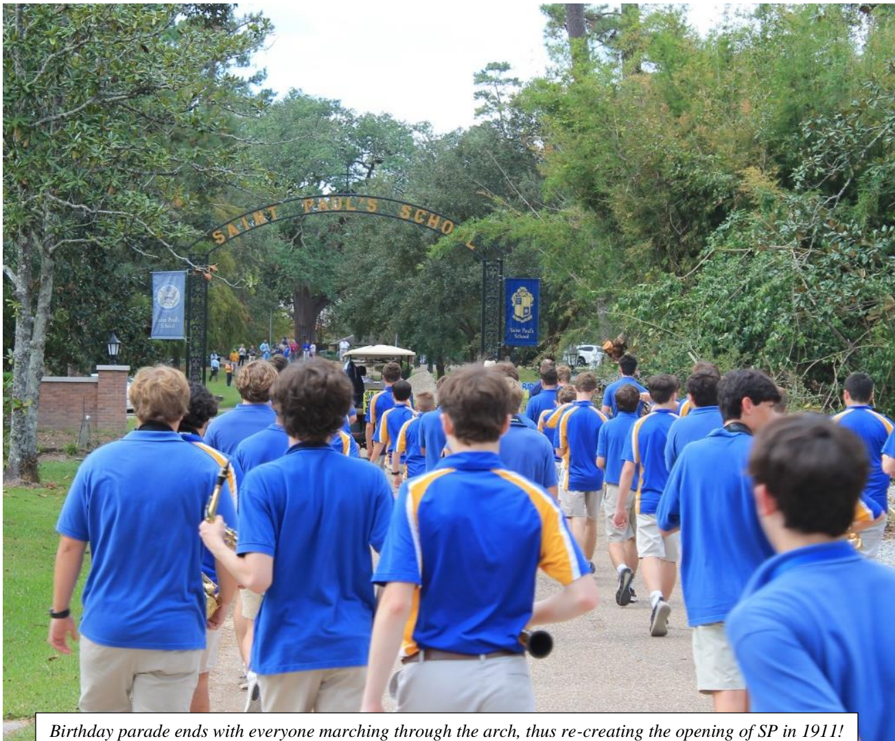
Birthday parade ends with everyone marching through the arch, thus re-creating the opening of SP in 1911!