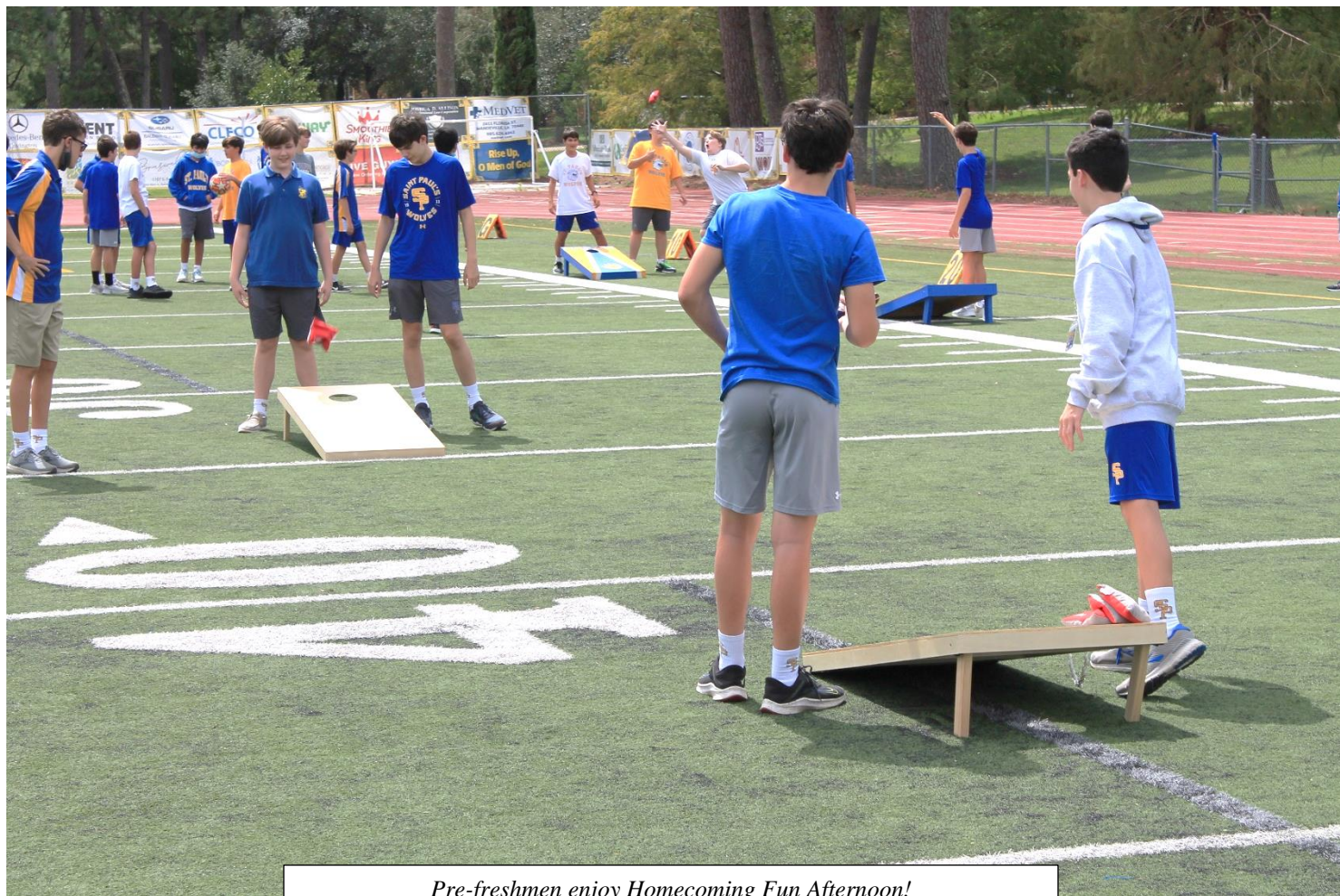
Pre-freshmen enjoy Homecoming Fun Afternoon!