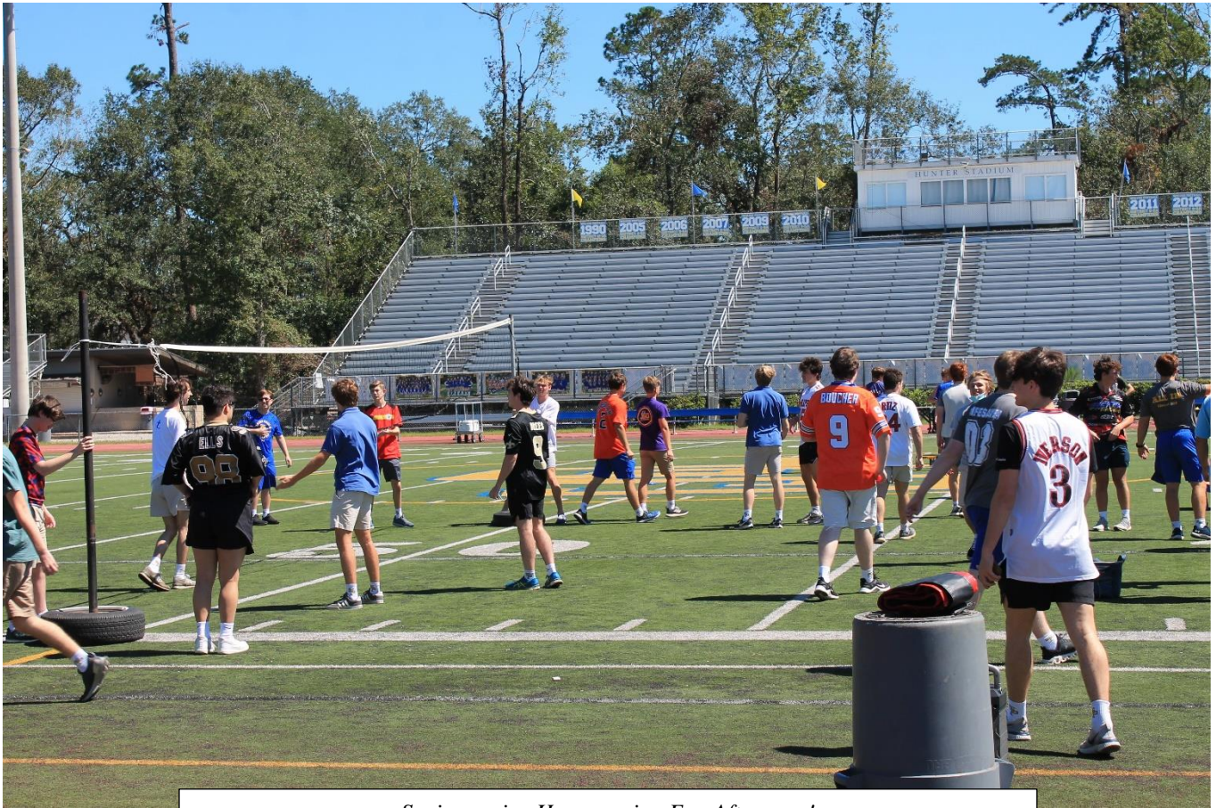
Seniors enjoy Homecoming Fun Afternoon!

SCHOOL SAFETY: School safety remains paramount for all. Promote safety with your son. In our meetings, faculty reviewed all safety procedures that we have – and they are many. Safety is EVERYONE’S JOB. Report ANY rumor or safety threat. Encourage your sons to report, too. All visitors to campus must sign in and receive a Visitor’s Pass – and wear a mask. You may not just wander the campus. Thanks for understanding this procedure. Our prayers rise to heaven for a safe school year and the elimination of violence of all kinds in our schools – and in all of society.