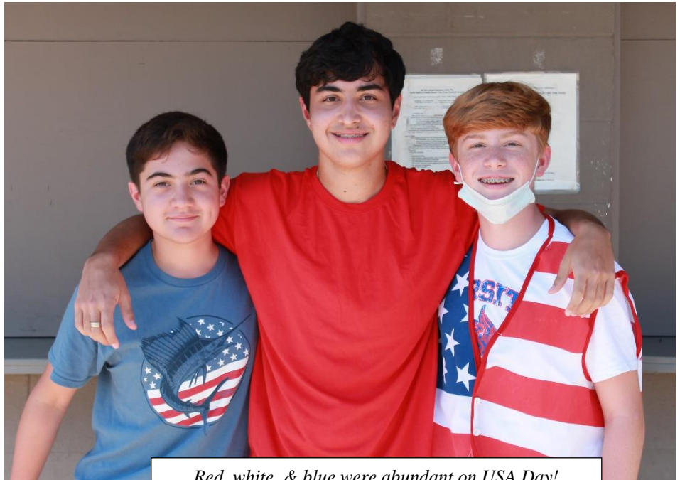
Red, white, & blue were abundant on USA Day!