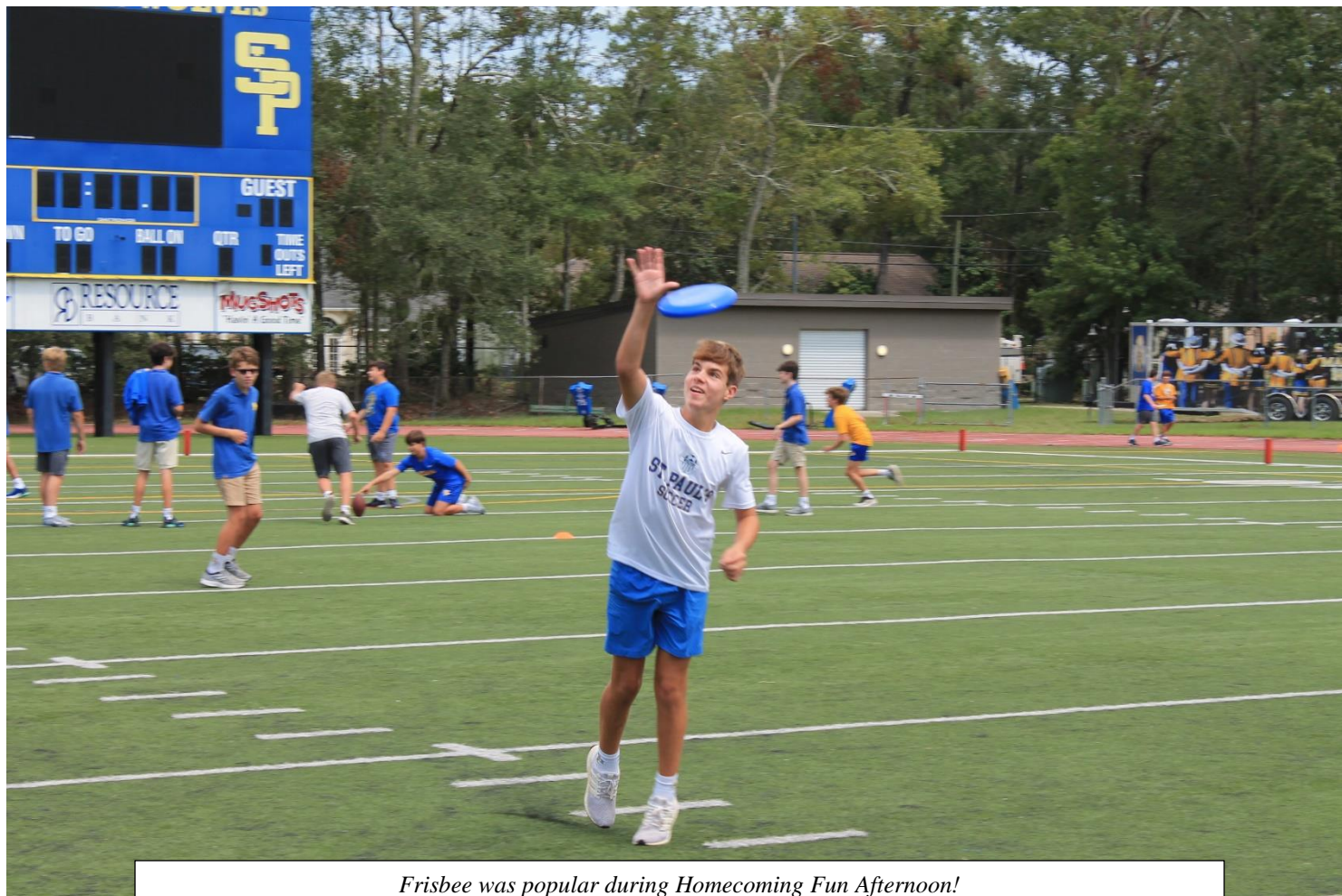
Frisbee was popular during Homecoming Fun Afternoon!

COVID: With Ida occupying our every waking moment for the past few weeks, we must not forget that COVID is still very much in our midst. Thus, all of our COVID mitigation efforts remain in place, especially the mask mandate, which was extended by Governor John Bel Edwards until September 29. While we hope the mandate will be lifted, we must follow it. Please make sure your son comes to school with this mask, prepared to wear it inside any building.