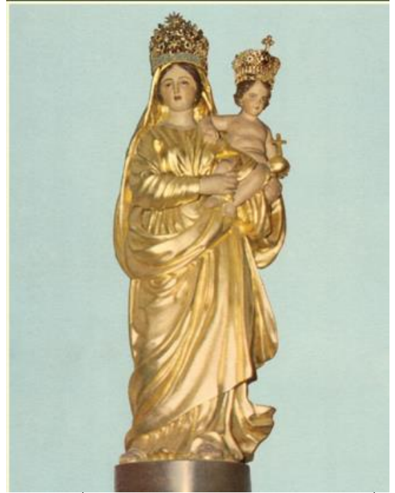
Our Lady of Prompt Succor! Hasten to help us!