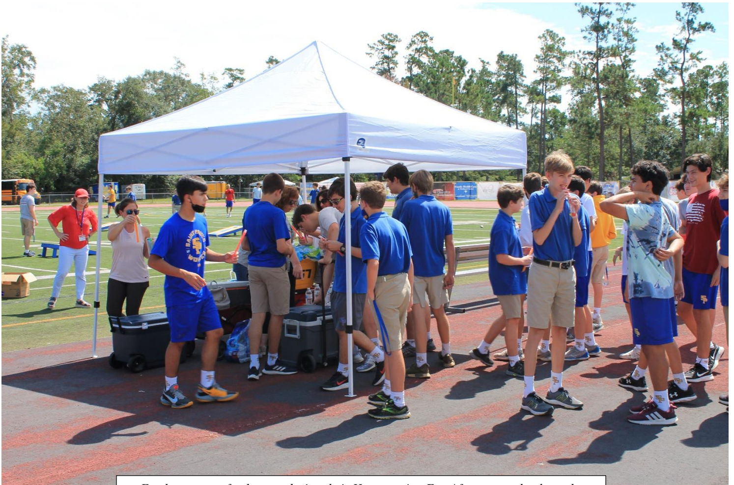
Freshmen get refreshments during their Homecoming Fun Afternoon – thanks to the Mothers Club!

TIC TOC SCHOOL VANDALISM: This is tragic and embarrassing: TIC TOC (don't ask me to explain it; ask your son) is encouraging school bathroom vandalism – and it is spreading throughout the nation. Just google it. Unfortunately, and this is the embarrassing part, it hit SPS recently, with soap dispensers being ripped off of walls – in our newly constructed buildings, no less! PLEASE speak with your son about this and have him report any vandalism about which he knows. SERIOUS disciplinary measures will be imposed when we find the perpetrators – and we will. They will be looking for other schools.