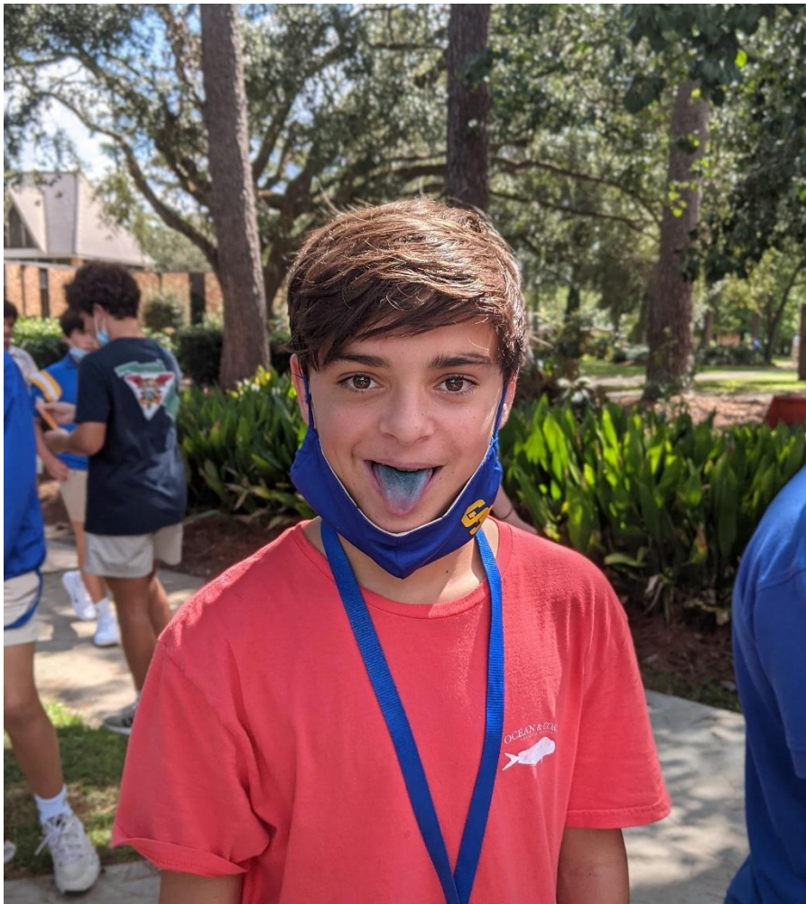
This pre-freshman enjoyed his blue popsicle in honor of our Blue Ribbon Award!