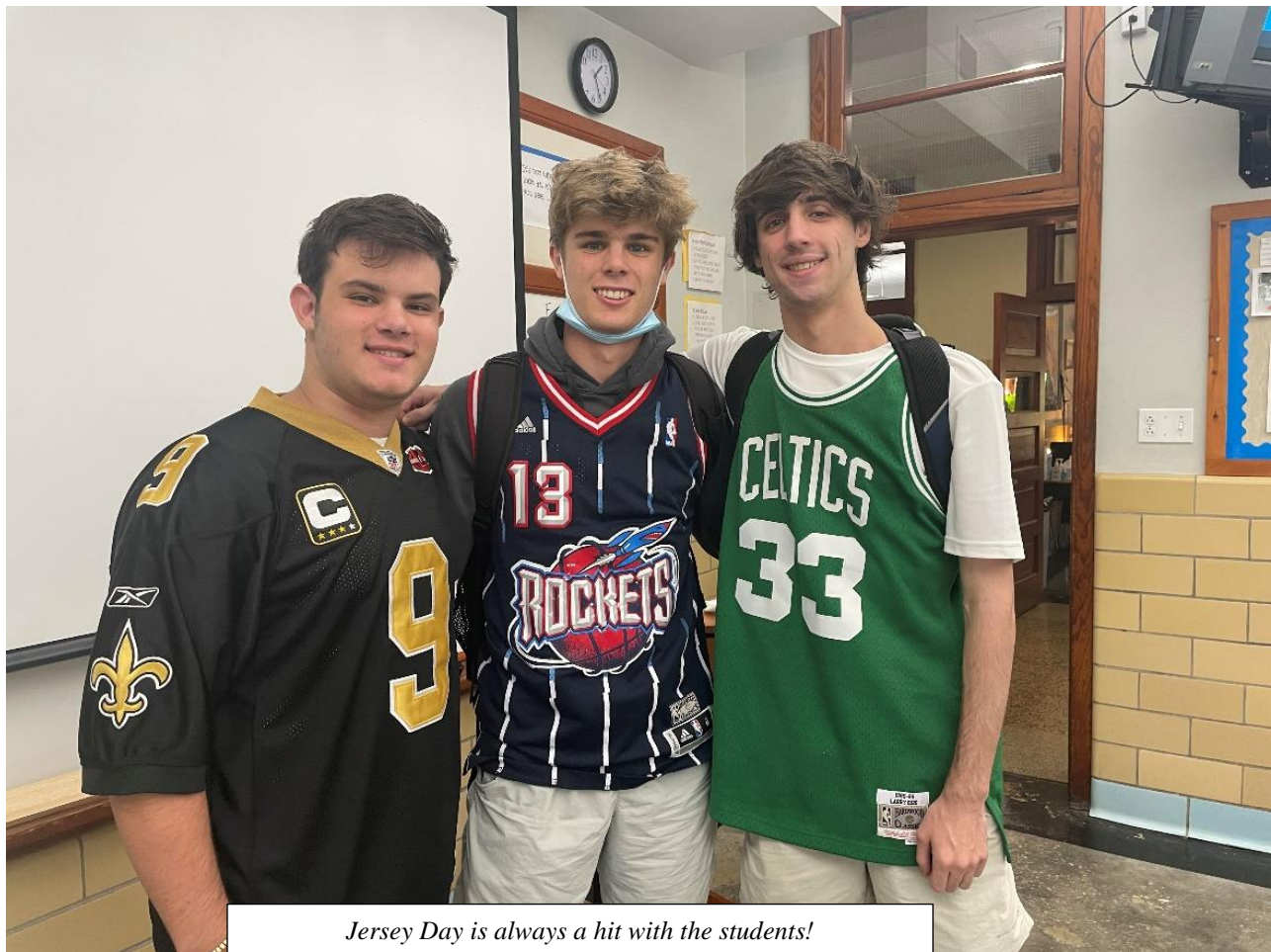
Jersey Day is always a hit with the students!

WOLF PACKS: We began WPs before Ida -- a time to practice a quality of Lasallian education: building relationships. Each student is assignment to a multi-level Wolf Pack, led by a staff member. Most students stay with that staff member throughout their SPS career. We address various issues during the twenty-minute meeting.