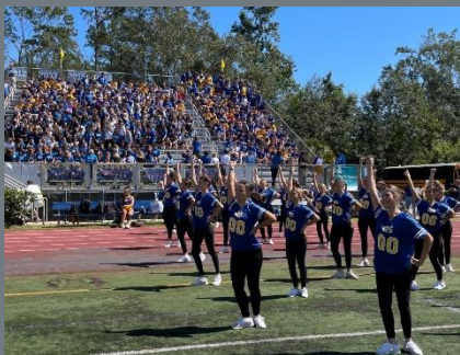
Both Saint Paul's and SSA were recently named 2021 National Blue Ribbon "Exemplary High Performing" Schools