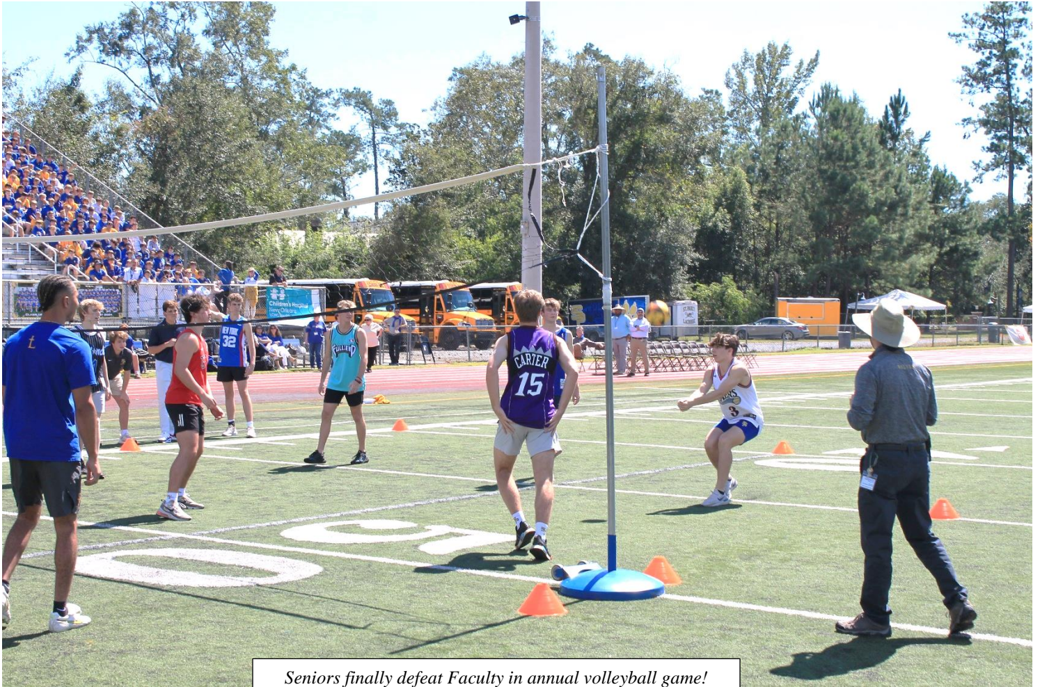
Seniors finally defeat Faculty in annual volleyball game!

TRAFFIC FLOW ON CAMPUS: If you drop off or pick up your son, you will meet road congestion around our campus. We ask your help in improving the traffic flow and safety: