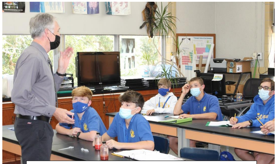
Biomed I students pay close attention to directions for experiment.