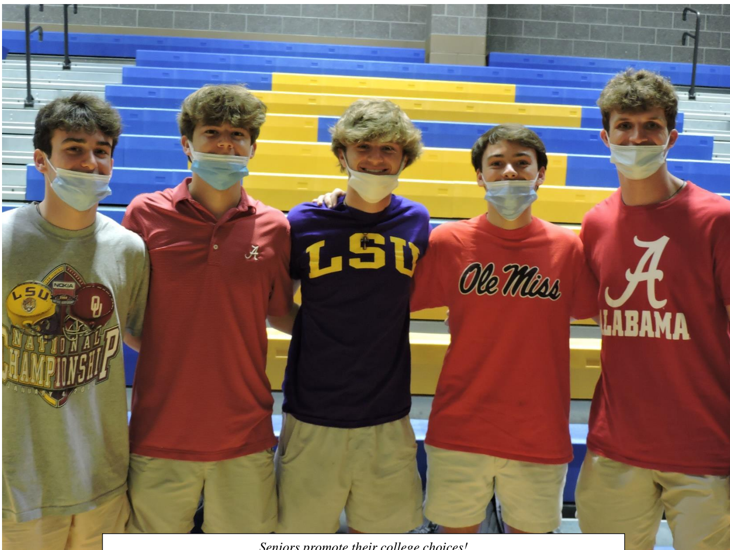
Seniors promote their college choices! (We had them adjust their masks right after the pic!)

A LOOK AHEAD AND SECOND SEMESTER PERIOD ROTATION: Here is the period rotation for rest of year. This is subject to change if unavoidable conflicts (weather, etc.) occur: