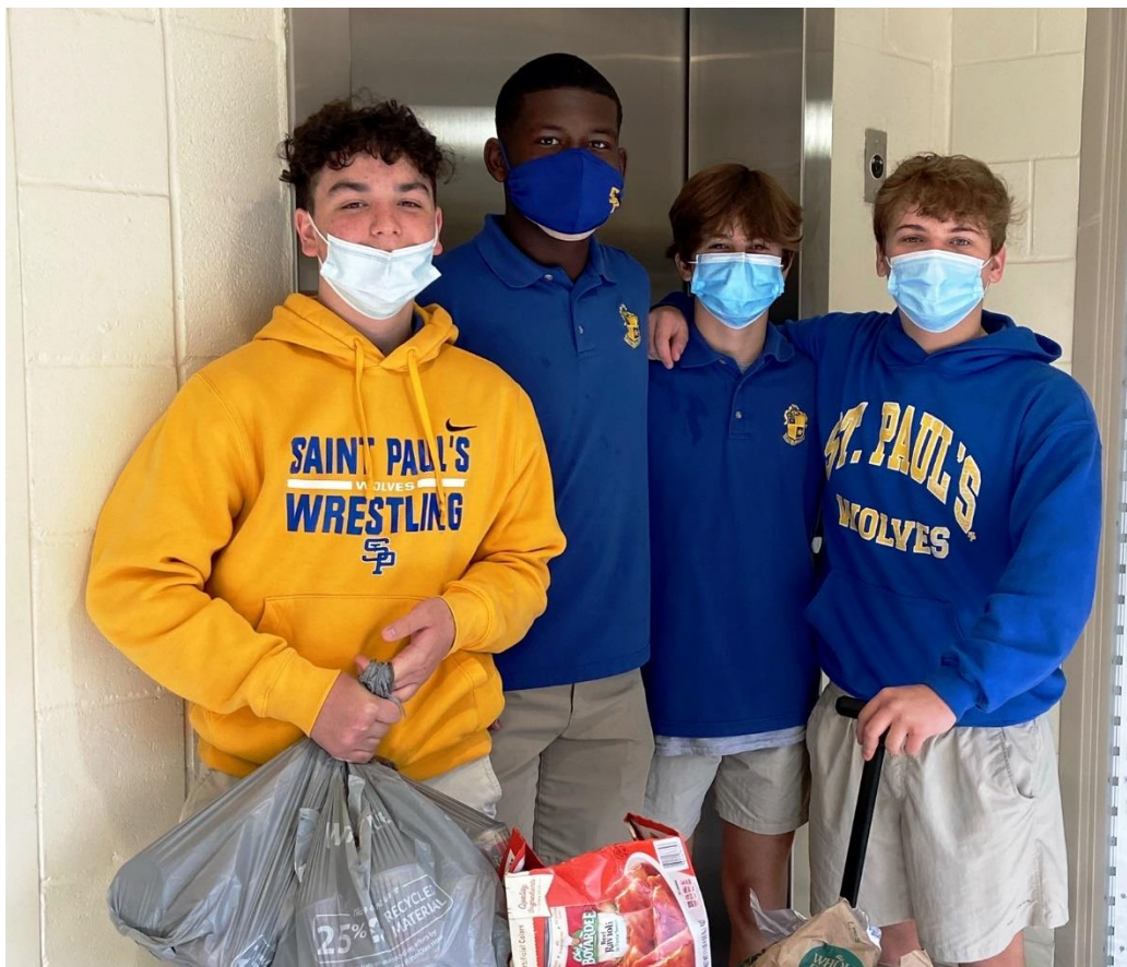
Pre-freshmen learn the Lasallian Way by bringing food for Stuff the Bus for the Foodbank!

Our Lady of Prompt Succor! Hasten to help us!