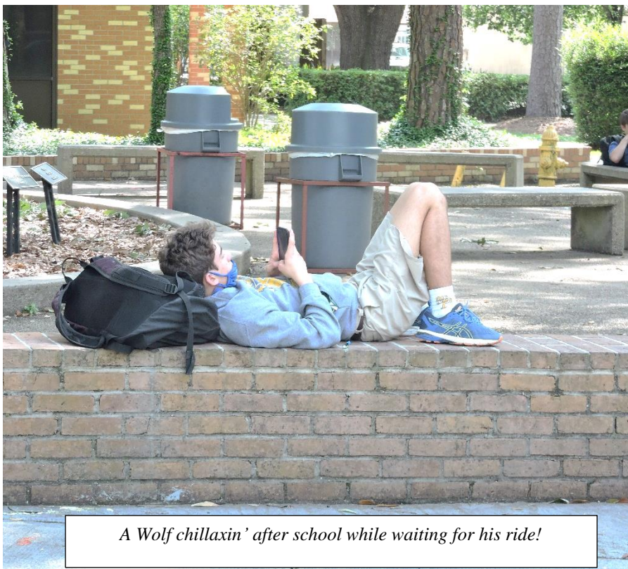
A Wolf chillaxin' after school while waiting for his ride!