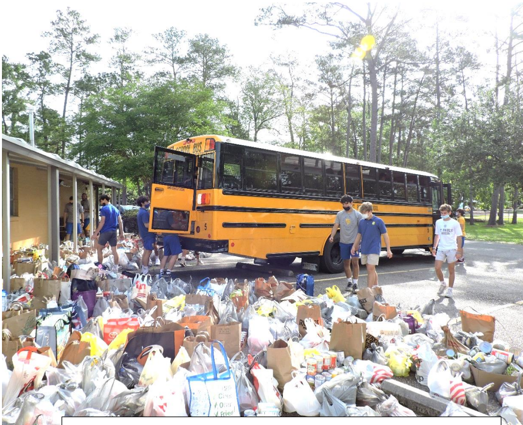
Wolves help Stuff the Bus for the Foodbank!