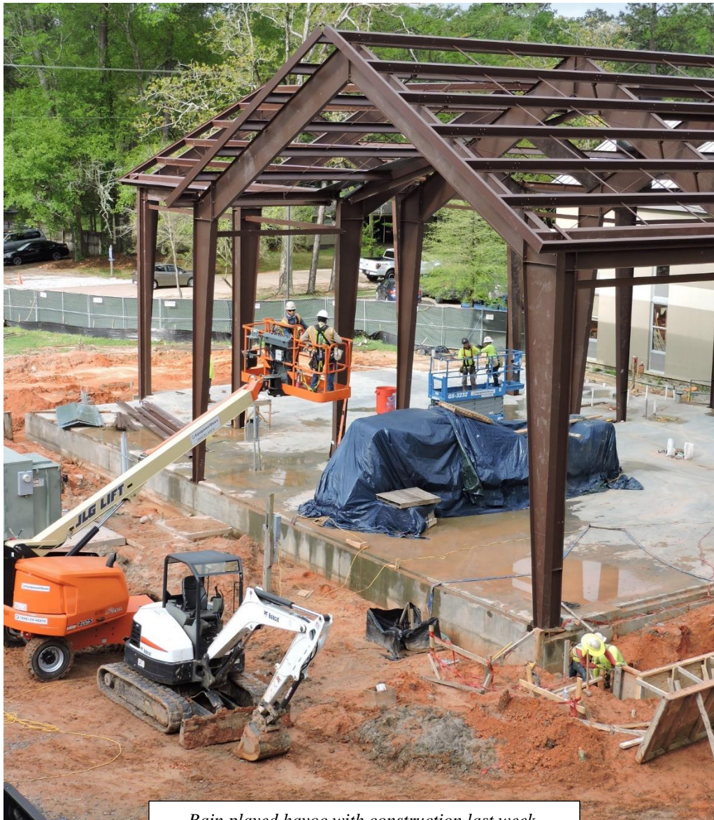
Rain played havoc with construction last week.

The building has served the Marching Wolves well since that time, but, again, needs dictate change. In addition to overall building deterioration, our band programs have been expanding of late and now include concert, jazz, and drum corps components in addition to the renowned Marching Wolves, now almost one hundred members strong! They are deserving of a better facility. This new facility will provide expanded space, restrooms, acoustics, and aesthetics to our music program. Construction has begun and this $2.3 million project will be completed in the summer of 2021. Interested in supporting the renovation, whose overall cost will approach $2.3 million? We have Naming Opportunities! For more information, call Danielle Lavie at 985-892-3200 ext 1970 or development@stpauls.com or Br. Ray Bulliard at 985-892-3200 ext 1901 or broray@stpauls.com .