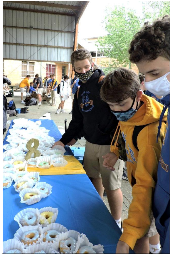
Pre-freshmen enjoy snack day thanks to MC!

3 – GABC 4 – DEFG – Pack Time 5 – ABCD 6 – EFGA 7 – BCDE 10 – FGAB 11 – CDEF – President’s Assembly 12 – GABC 13 – DEFG – Academic Awards TBD 14 – ABCD – Athletic Awards TBD 17 – EFG 18 – Exams 8-11th 19 – Exams 8-11th 20 – Exams 8-11 th 21 – Exams 8-11 th