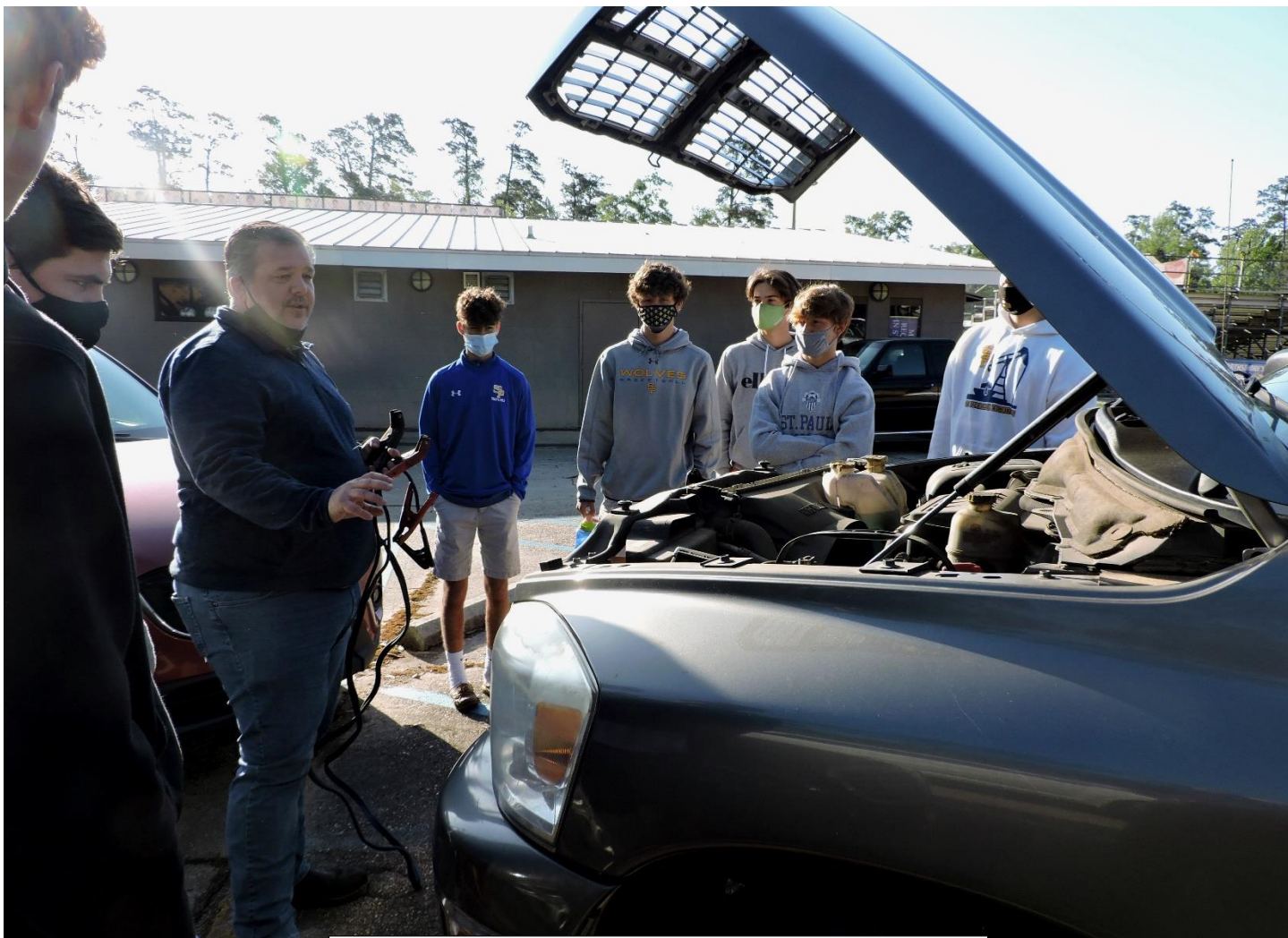
Seniors get Auto Mechanics 101 on Life Skills day. Here they learn how to jump start a dead battery.

TUTORING: Tutoring offered by National Honor Society members is underway and occurs every day at lunch in the library for the remainder of the school year. All students are welcome to utilize this free tutoring service. Essay proofreading services also provided. Encourage your son to use this awesome opportunity to get help from their most capable peers. It is not embarrassing to do so!