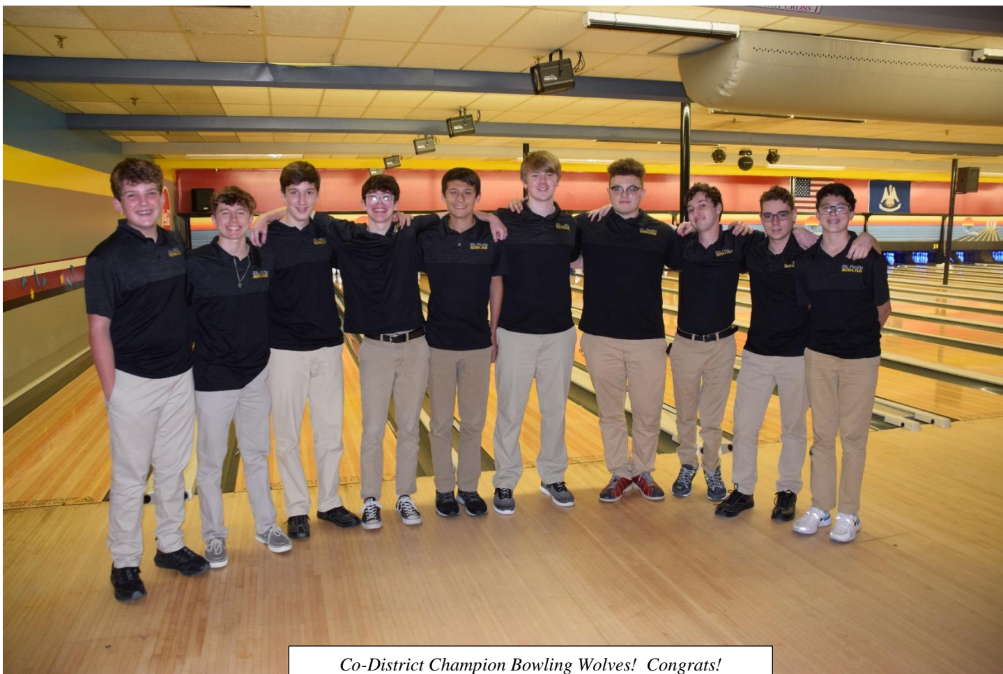
Co-District Champion Bowling Wolves! Congrats!