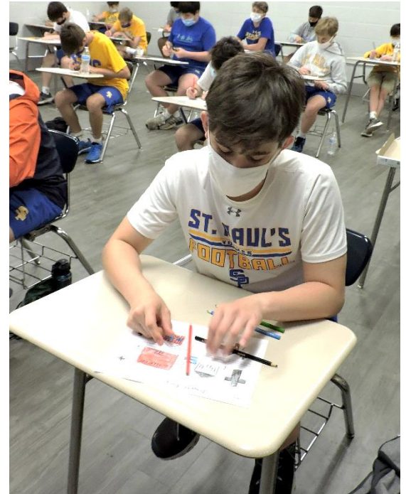
A freshman thoughtfully examines his life during Holy Week retreat.