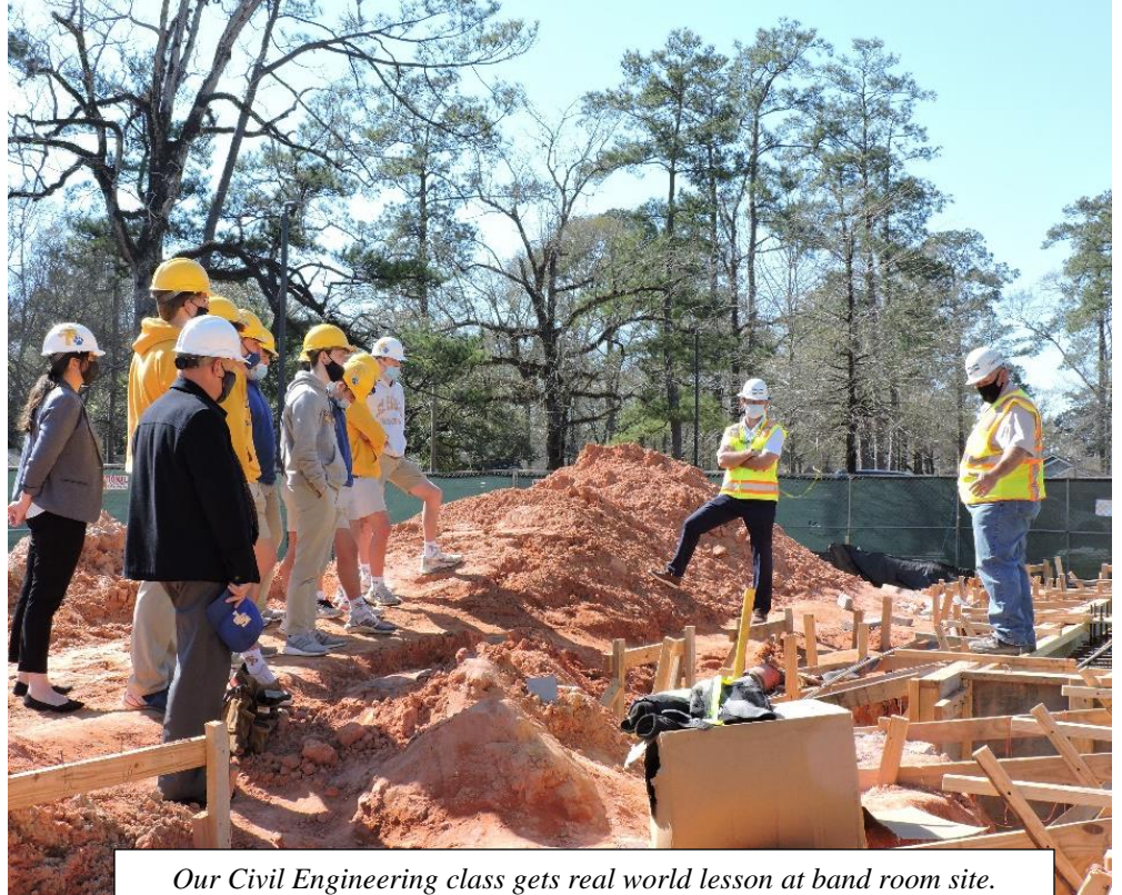
Our Civil Engineering class gets real world lesson at band room site.