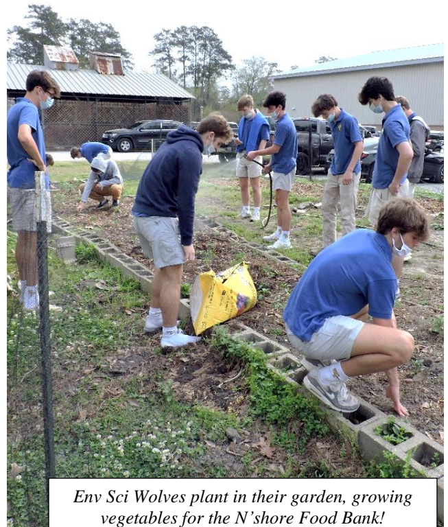
Env Sci Wolves plant in their garden, growing vegetables for the N'shore Food Bank!