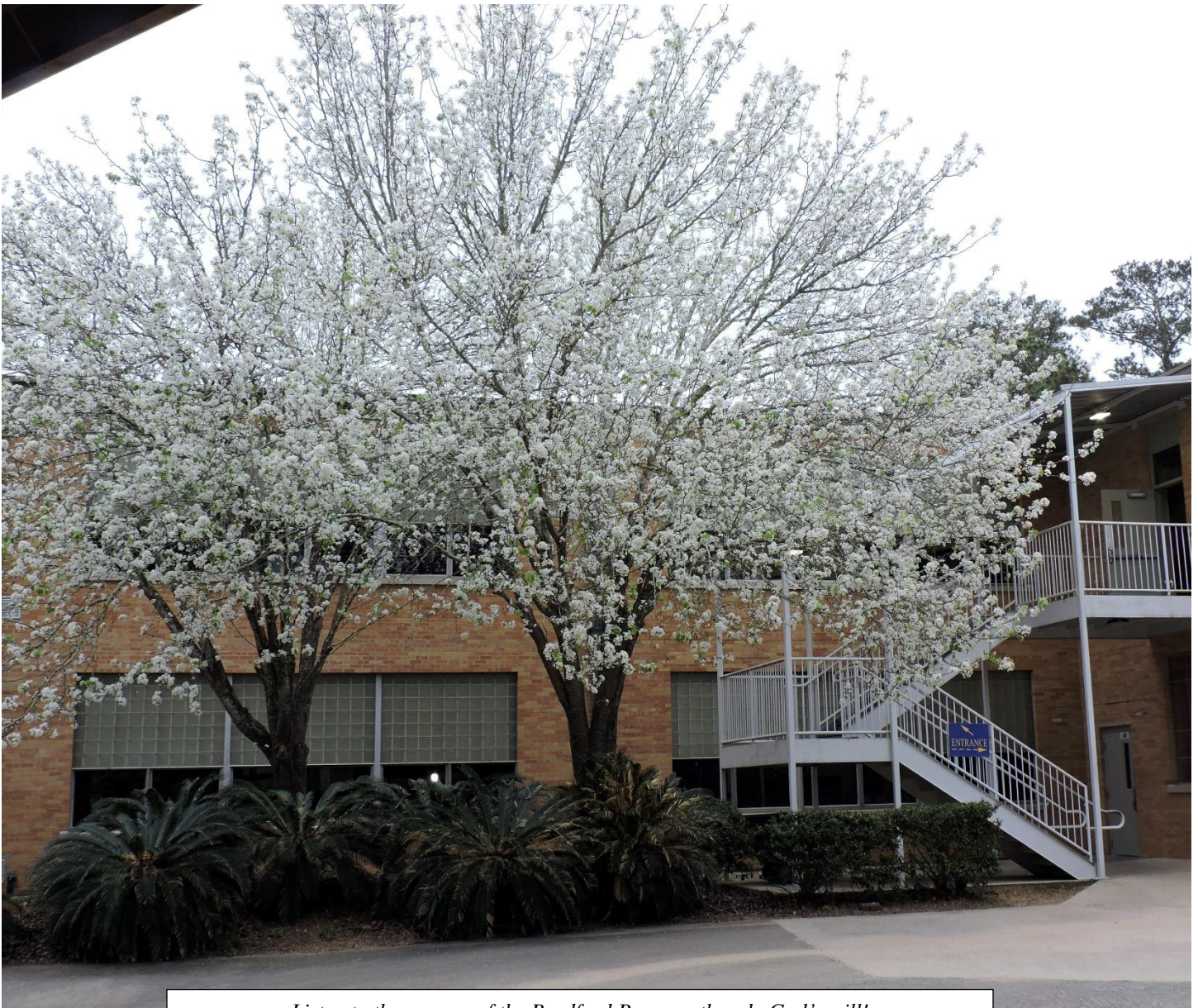
Listen to the sermon of the Bradford Pears as they do God's will!

STUDY HALL AFTER SCHOOL: Ben's Den (aka the library) opens every afternoon (Monday-Friday) until 4:00. You are encouraged to mention this service to your sons who are on campus after school with nothing to do or who may be waiting for a late ride or a practice to begin. All we ask is that they treat the facility with respect and that they are quiet. The space will be supervised by faculty.