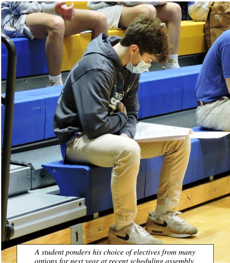
A student ponders his choice of electives from many options for next year at recent scheduling assembly.