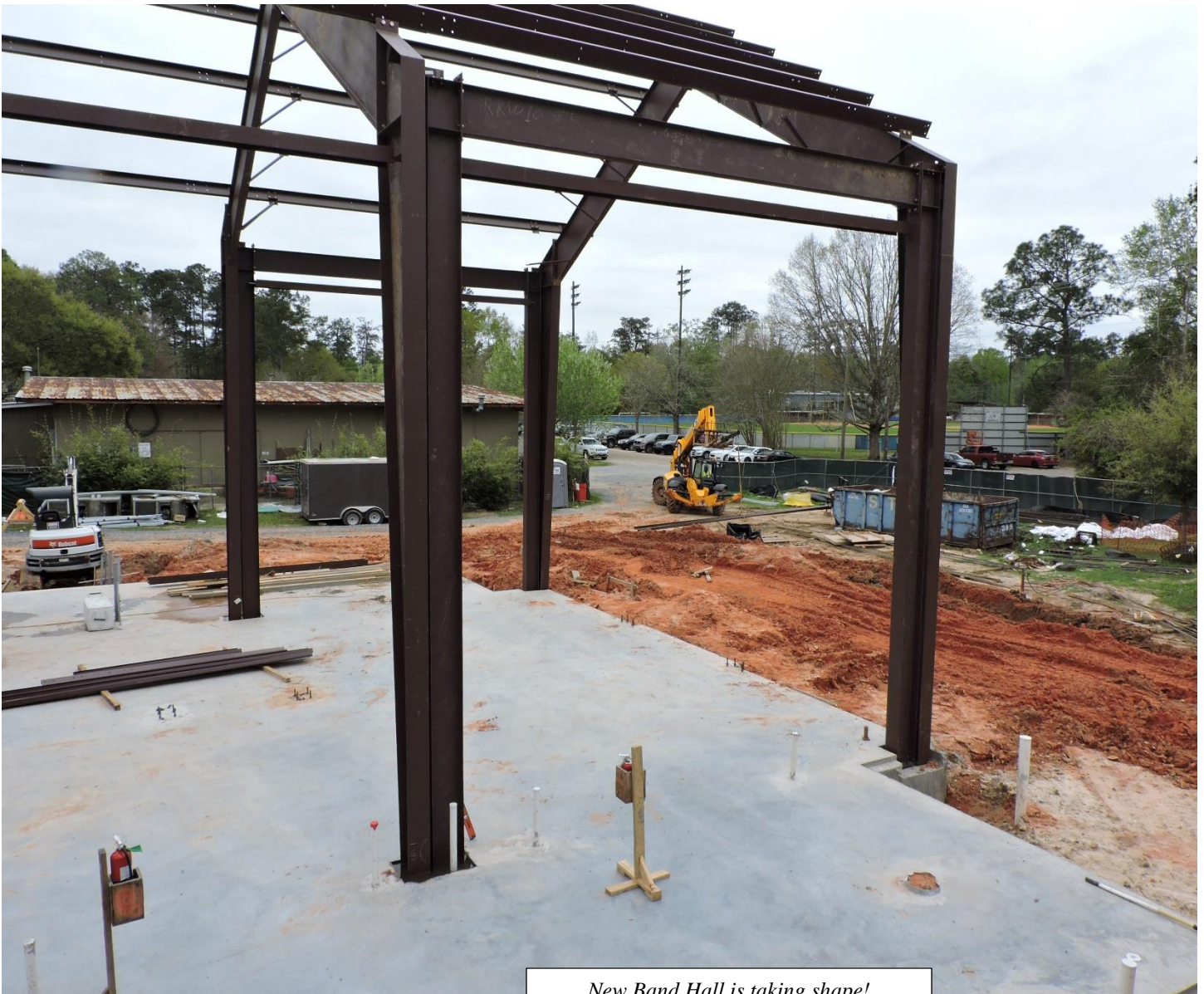
New Band Hall is taking shape!

The building has served the Marching Wolves well since that time, but, again, needs dictate change. In addition to overall building deterioration, our band programs have been expanding of late and now include concert, jazz, and drum corps components in addition to the renowned Marching Wolves, now almost one hundred members strong! They are deserving of a better facility. This new facility will provide expanded space, restrooms, acoustics, and aesthetics to our music program. Construction has begun and this $2.3 million project will be completed in the summer of 2021. Interested in supporting the renovation, whose overall cost will approach $2.3 million? We have Naming Opportunities! For more information, call Danielle Lavie at 985-892-3200 ext 1970 or development@stpauls.com or Br. Ray Bulliard at 985-892-3200 ext 1901 or broray@stpauls.com .