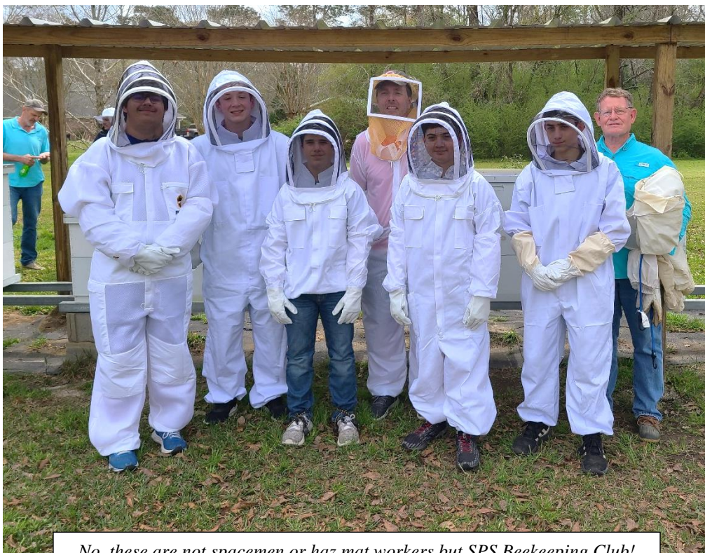
No, these are not spacemen or haz mat workers but SPS Beekeeping Club!