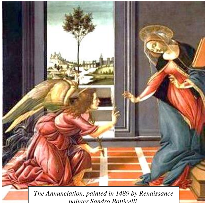
The Annunciation, painted in 1489 by Renaissance painter Sandro Botticelli.