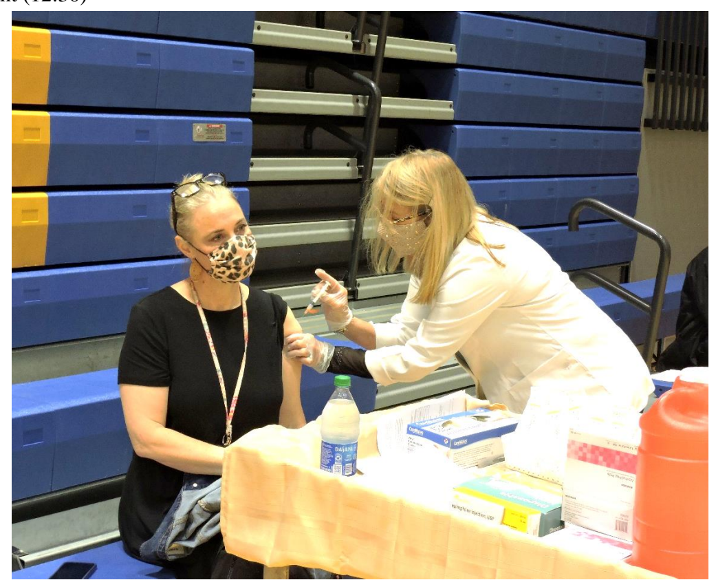
Faculty/staff receive COVID vaccine – thanks, Braswell's Drugs for your assistance!