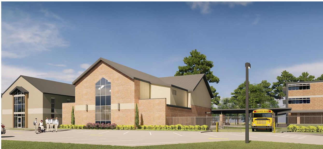
Construction on new Band Building is underway!

BAND HALL HISTORY: In the summer of 1966, the school constructed a “recreation center” for the recreational needs of the students living in La Salle Hall dorm. At a cost of $15,000, a building was constructed to provide ping pong, pool, games and TV for boarders. Eventually, arcade-type games and a snack bar were added. In addition, a nine-hole miniature golf (putt-putt) course was built in front of the building, complete with lighting for nighttime use.