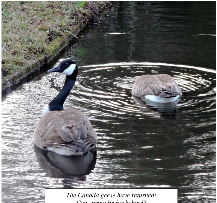
The Canada geese have returned! Can spring be far behind?