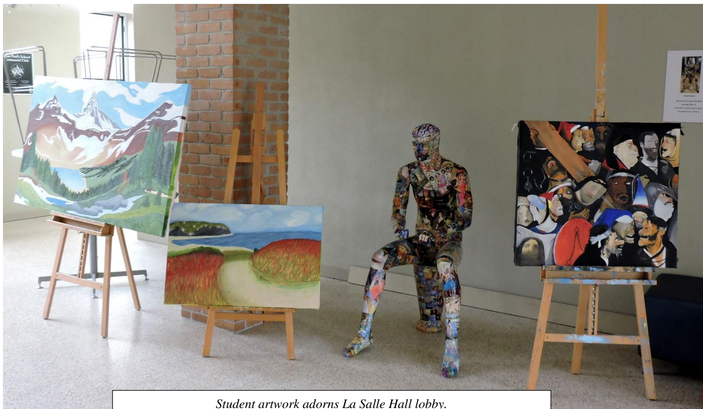
Student artwork adorns La Salle Hall lobby.