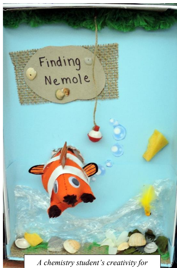
A chemistry student's creativity for Mole Day! Wonderful!