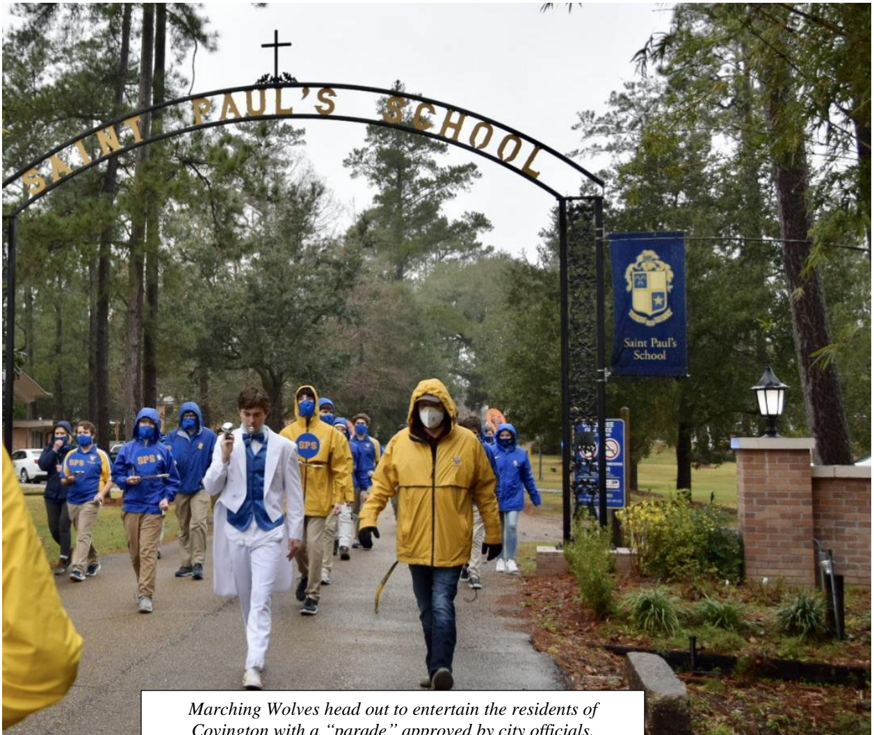
Marching Wolves head out to entertain the residents of Covington with a "parade" approved by city officials.