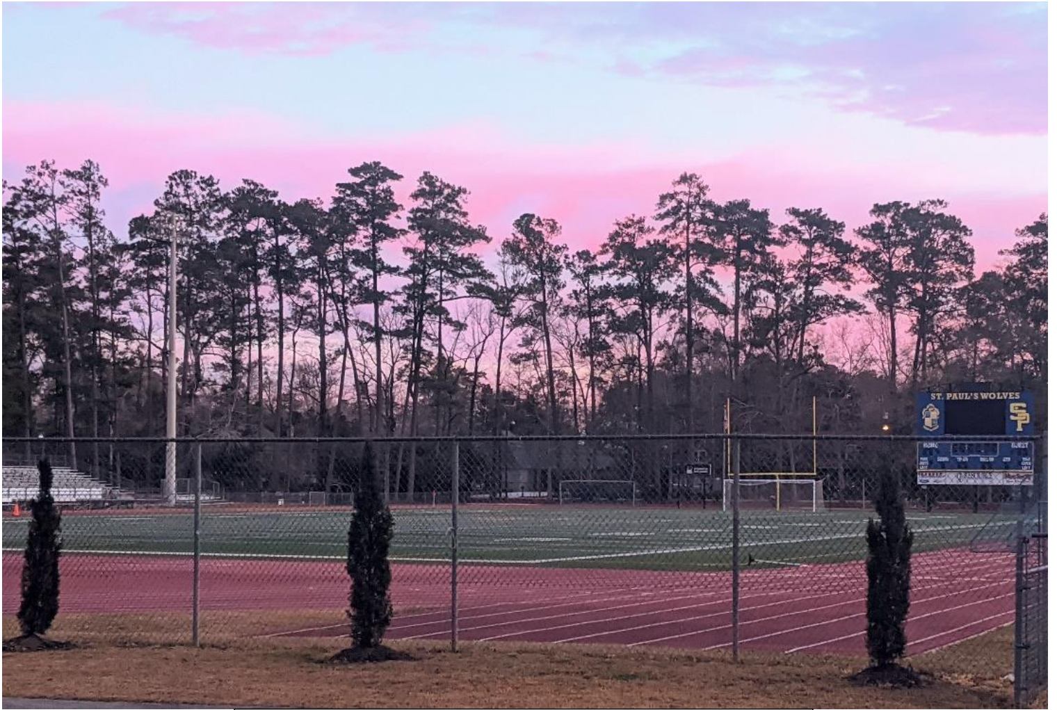
Another Bro. Javier pic: A cold February morning dawns at SPS!