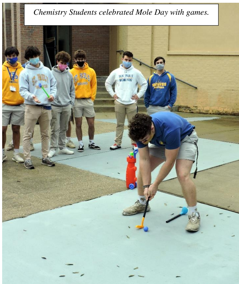
Chemistry Students celebrated Mole Day with games.