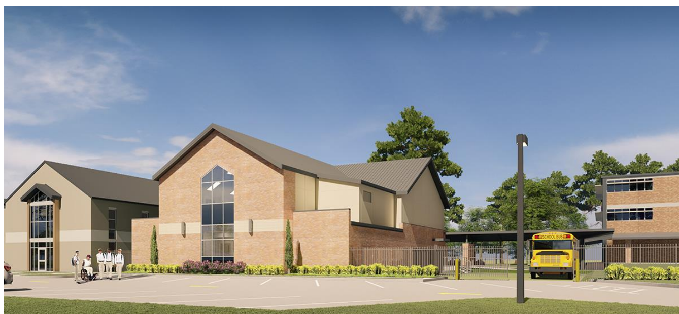
Construction on new Band Building is underway!