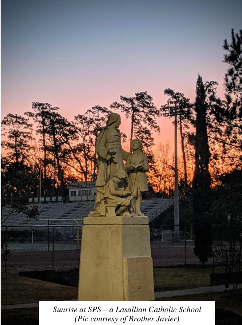
Sunrise at SPS – a Lasallian Catholic School

Welcome to February! Today begins Catholic Schools Week, when Catholic schools throughout the US celebrate and affirm the Catholic identity of our schools. The National Catholic Education Association has designated the theme of the week as: "Catholic Schools: Faith. Excellence. Service."