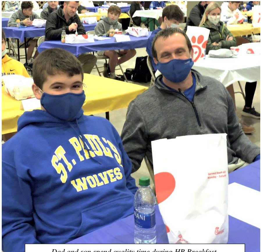
Dad and son spend quality time during HR Breakfast.