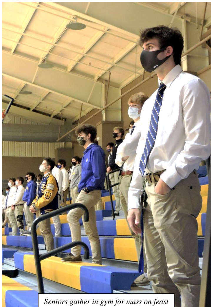
Seniors gather in gym for mass on feast of Conversion of St. Paul. It was great to have the senior class together, even if they had to socially distance themselves.