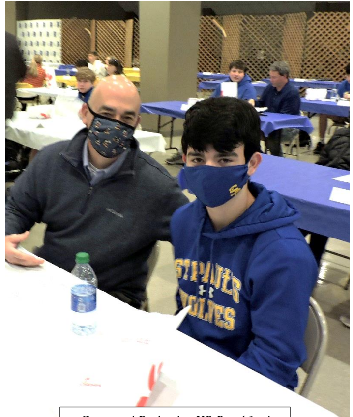
Grant and Dad enjoy HR Breakfast!