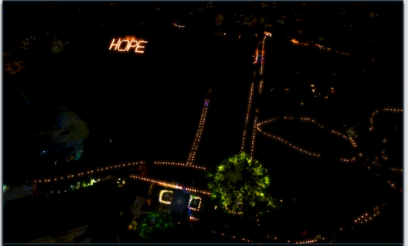
Saint Paul's Christmas Luminaries Thursday, December 6, 2020