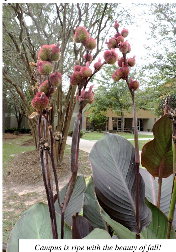
Campus is ripe with the beauty of fall!

FOOD DRIVE: Our Fall Food Drive to benefit the Northshore Food Bank runs Mon through Wed.