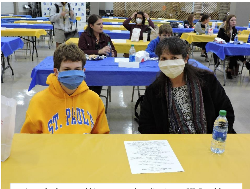
A pre-freshman and his mom spend quality time at HR Breakfast

Thu, Nov 12 (D E F G; Field Day for sophomores during Period G)