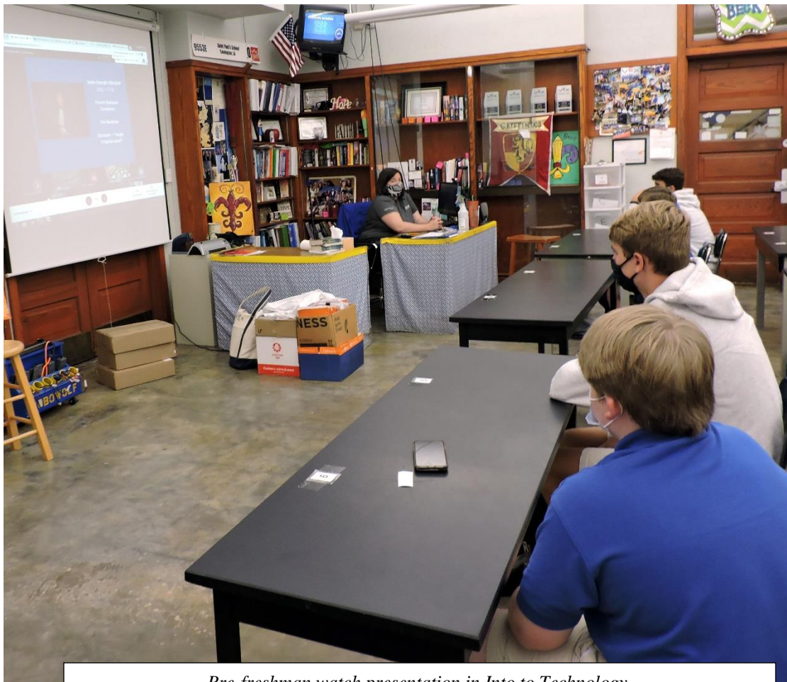
Pre-freshman watch presentation in Into to Technology.