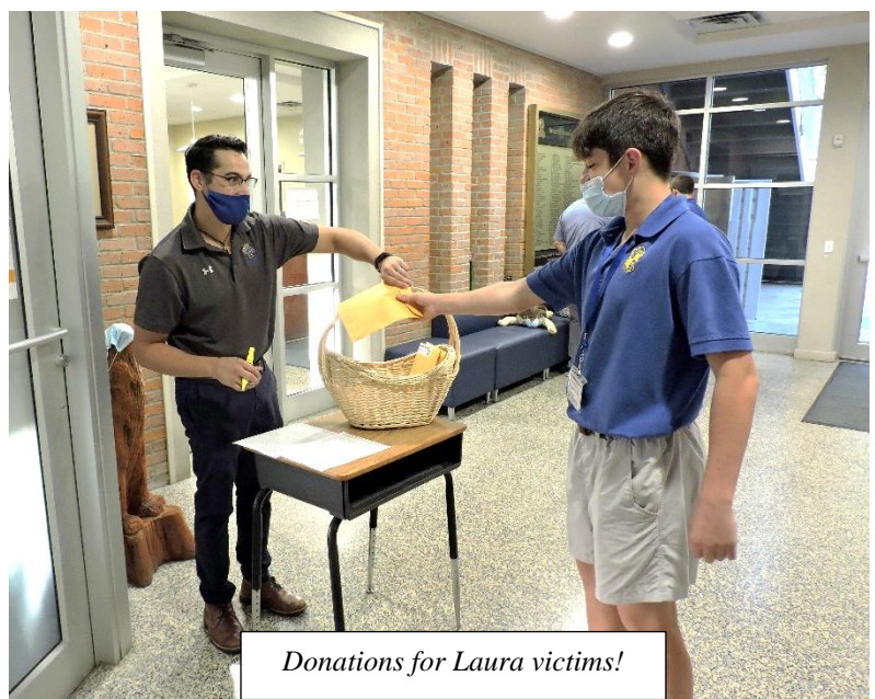
Donations for Laura victims!