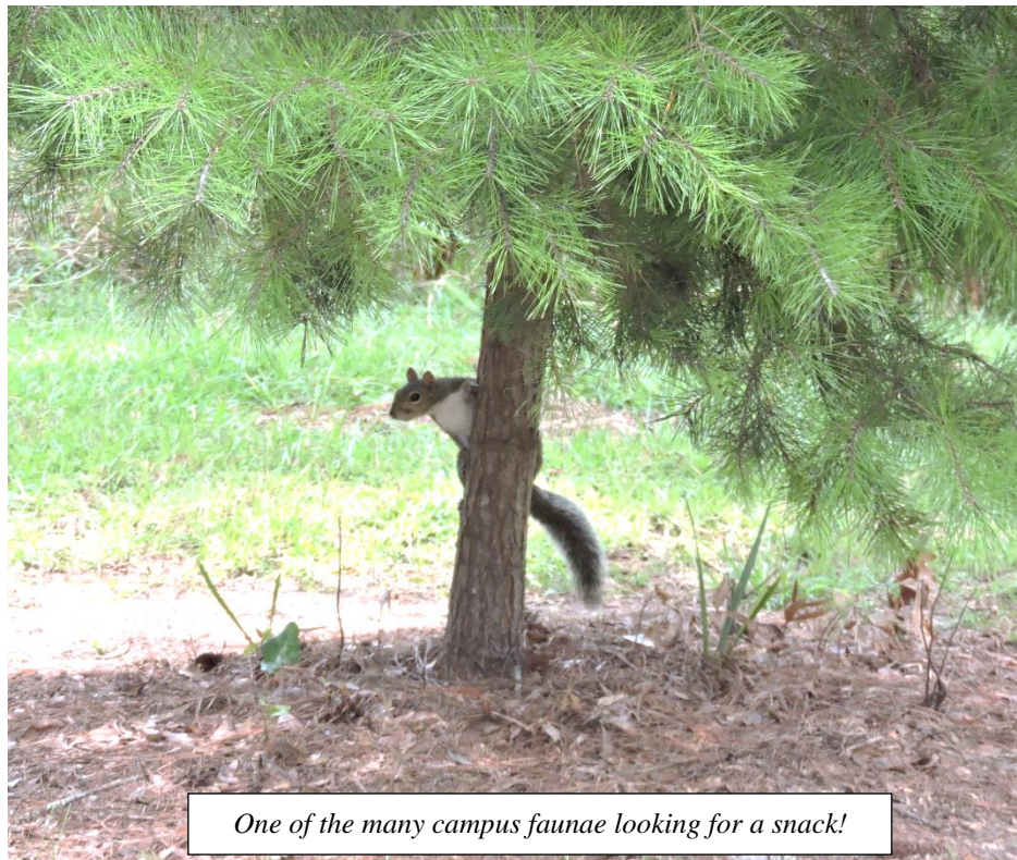
One of the many campus faunae looking for a snack!