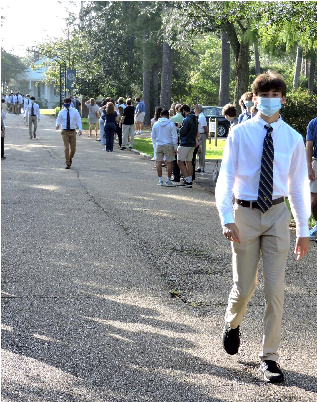
Seniors March through the Arch – Part II!

MASKS v. GAITERS: An email received from Children’s Hospital, our official COVID medical partner: We have new information that suggests gaiters might not be an optimal choice for face coverings due to the type of material in which they are usually produced. Until we have more info, we strongly recommend the use of traditional masks. Accordingly, we are instituting a “no gaiter” policy, only traditional masks.