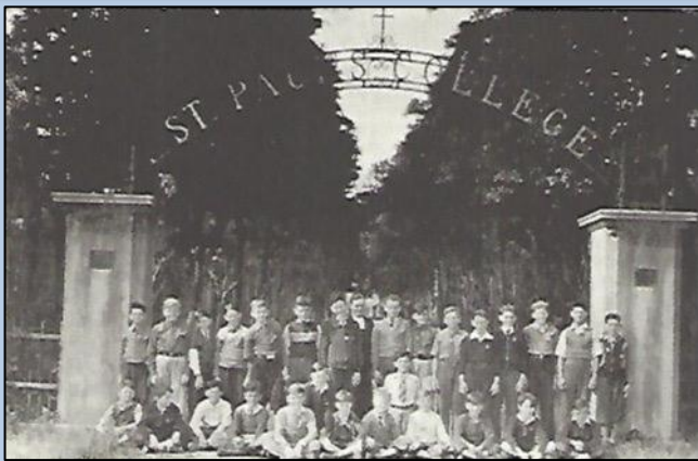
Arch circa 1930