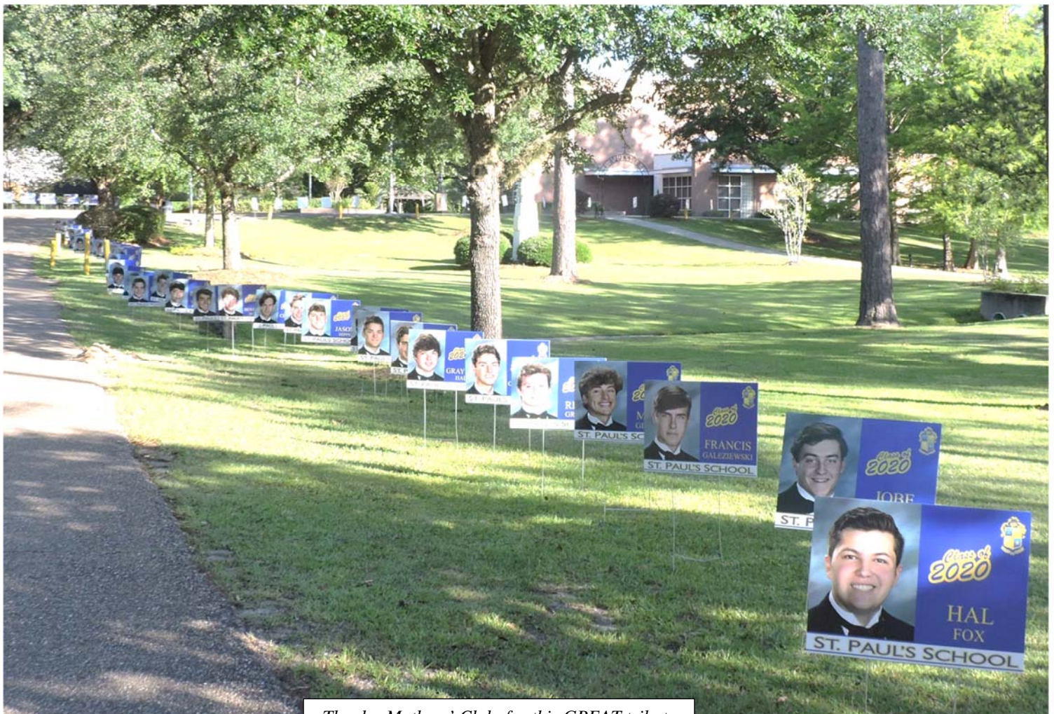
Thanks, Mothers' Club, for this GREAT tribute to the Class of 2020!

CLARION HERALD: Please know that the Clarion Herald can be found on line either by clicking here or using the url: http://clarionherald-la.newsmemory.com/