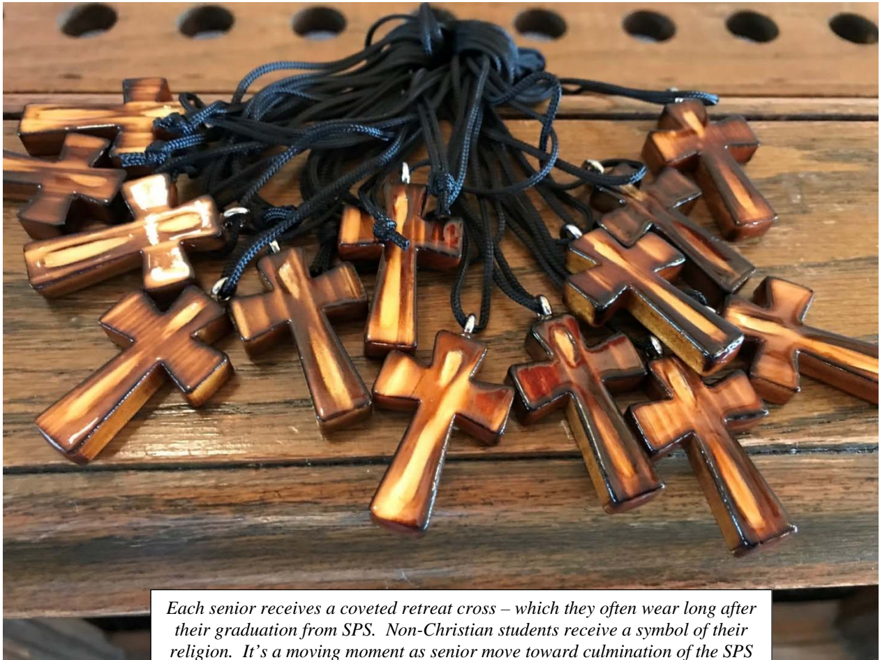
Each senior receives a coveted retreat cross – which they often wear long after their graduation from SPS. Non-Christian students receive a symbol of their religion. It's a moving moment as senior move toward culmination of the SPS careers.