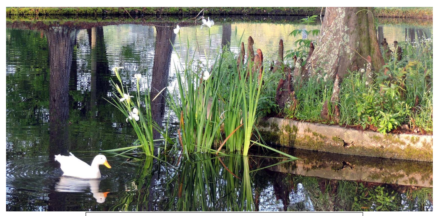
COVID-19 does not disrupt life in the campus pond, teeming with ducks, turtles, fish, geese, and irises! The ducks miss the students – a steady source of food after breakfast and lunch!

Our Lady of Prompt Succor! Hasten to help us!