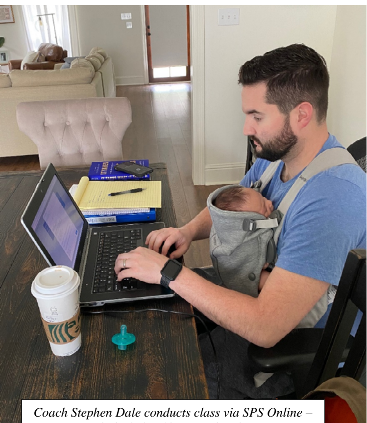
with the help of his new daughter!

April Fools Day: In 1700, English pranksters begin popularizing the annual tradition of April Fools' Day by playing practical jokes on each other. Although the day has been celebrated for several centuries by different cultures, its exact