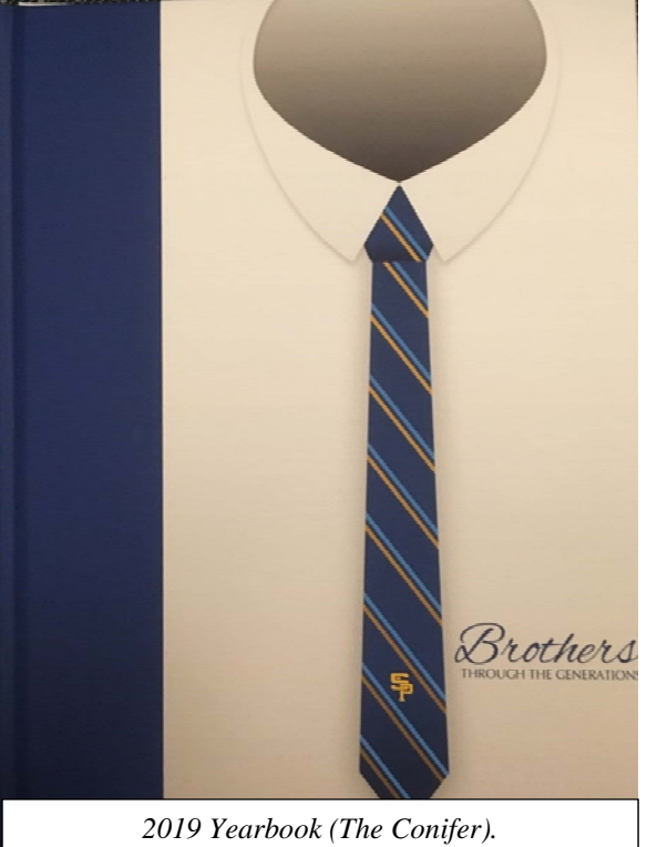
2019 Yearbook (The Conifer). Order yearbook before Mar 14's price increase.