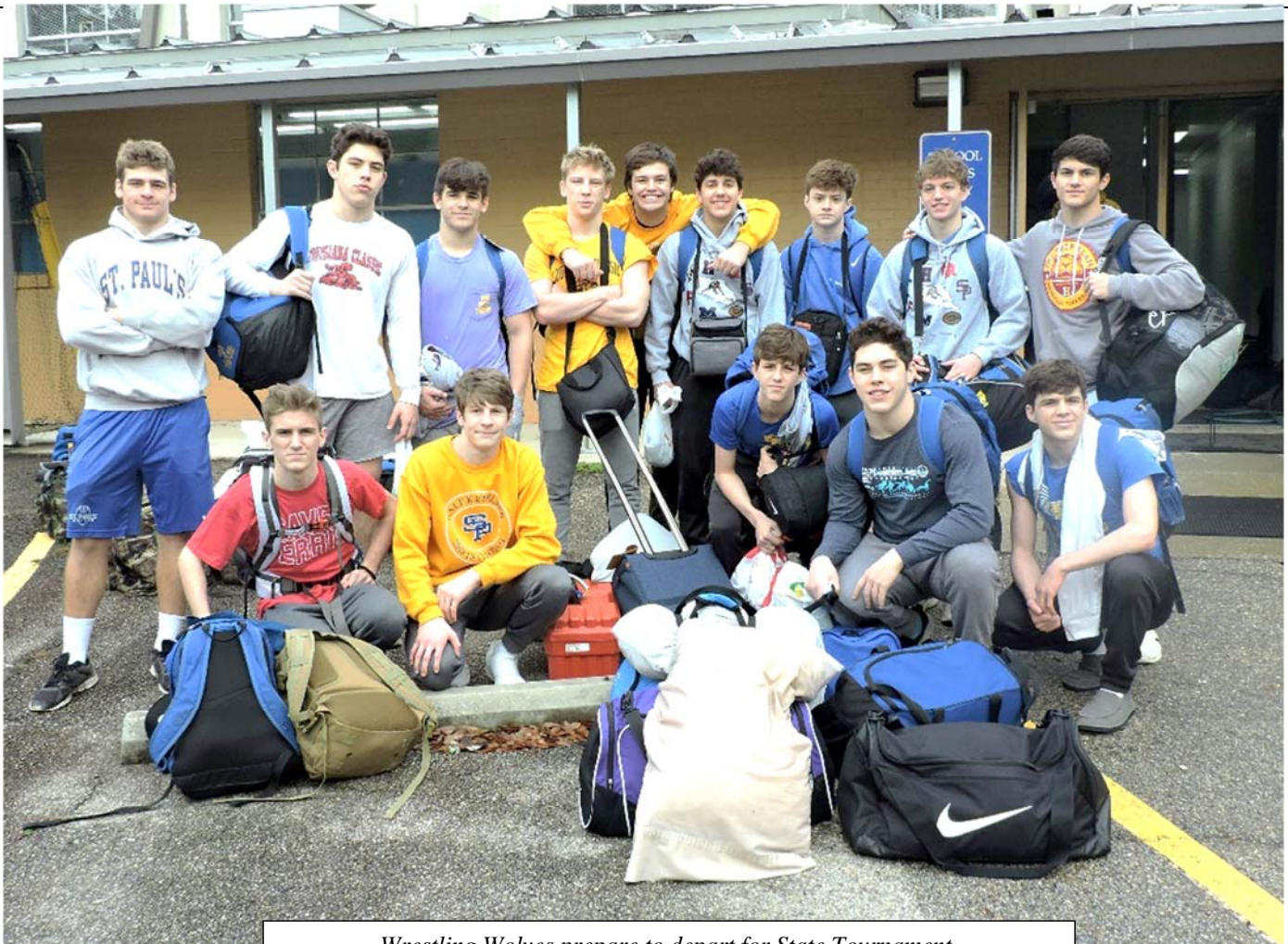
Wrestling Wolves prepare to depart for State Tournament.