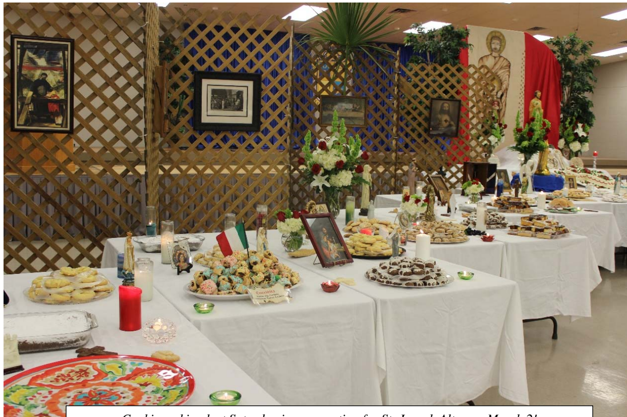
Cookie making last Saturday in preparation for St. Joseph Altar on March 2! The students are in for a treat!

SAFE DRIVING: Please obey the traffic laws: speed limit, no tailgating, no texting while driving, NO CELL PHONE USE DURING SCHOOL ZONE TIMES, buckle up, etc. Thank you!