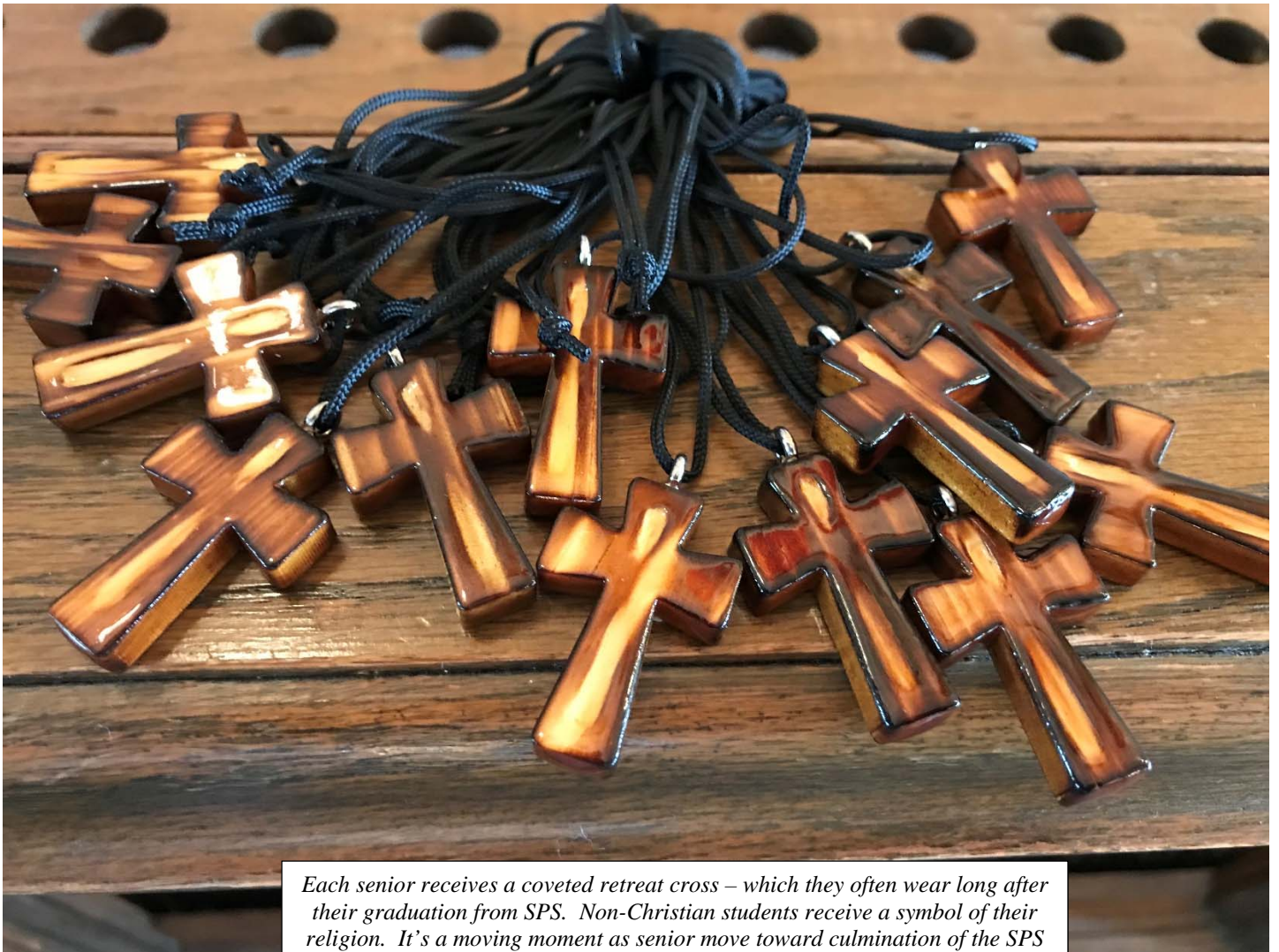
Each senior receives a coveted retreat cross – which they often wear long after their graduation from SPS. Non-Christian students receive a symbol of their religion. It's a moving moment as senior move toward culmination of the SPS careers.