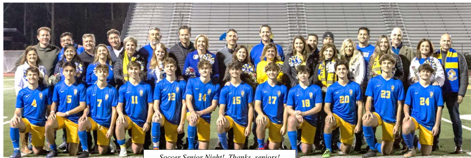
Soccer Senior Night! Thanks, seniors!

Can’t Believe It’s February 2020 and I’m Still the 17 th Christian Brother President of Saint Paul’s School