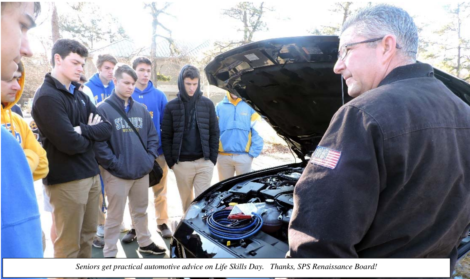
Seniors get practical automotive advice on Life Skills Day. Thanks, SPS Renaissance Board!