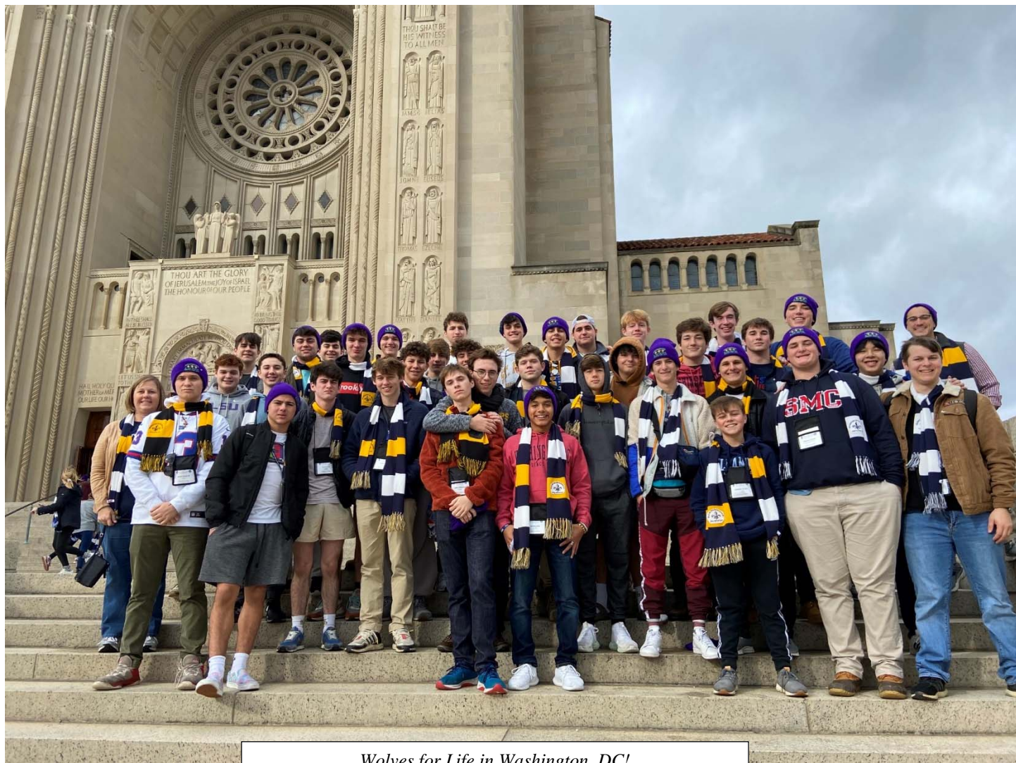
Wolves for Life in Washington, DC!