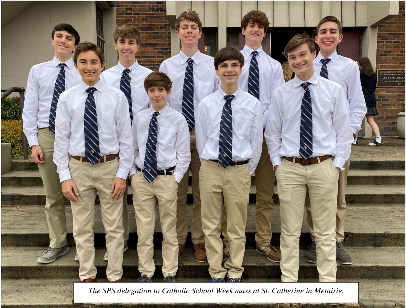
The SPS delegation to Catholic School Week mass at St. Catherine in Metairie.