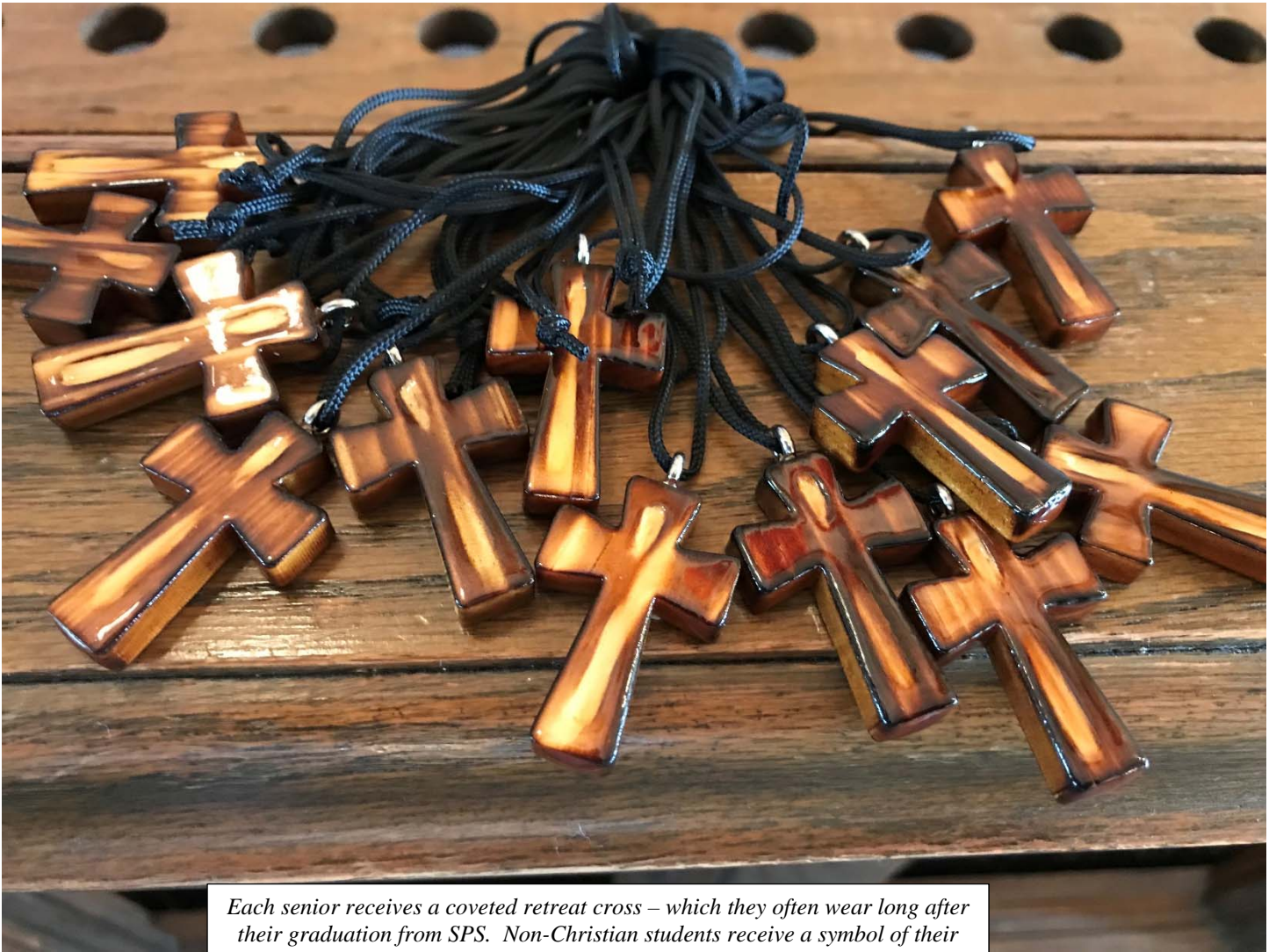
Each senior receives a coveted retreat cross – which they often wear long after their graduation from SPS. Non-Christian students receive a symbol of their religion. It's a moving moment as senior move toward culmination of the SPS careers.