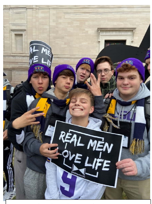
Wolves for Life in Washington, DC!