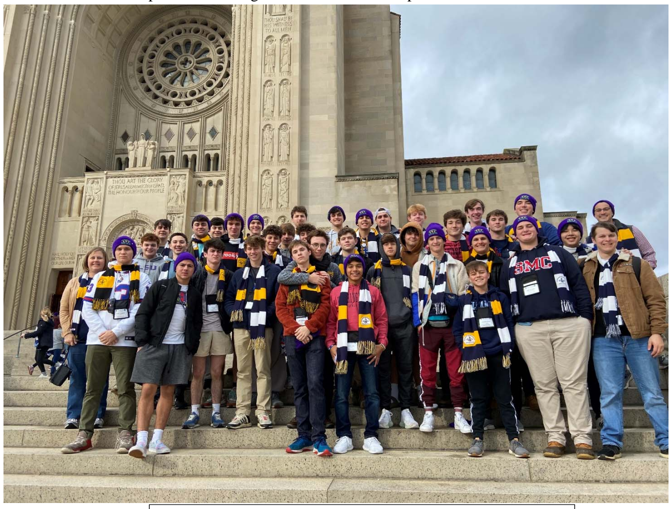
SPS was WELL-represented at March for Life in Washington, DC! Here are our Wolves in front of Shine of Immaculate Conception!

SOCIAL MEDIA: Get event and classroom pictures, latest scores, calendar reminders, and spiritual uplifting by liking our Facebook page <a href="https://www.facebook.com/St.Pauls.School.Covington.Louisiana/">https://www.facebook.com/St.Pauls.School.Covington.Louisiana/</a> or following us on Twitter @SPSWolfpack. The strength of the Wolf is in the pack!