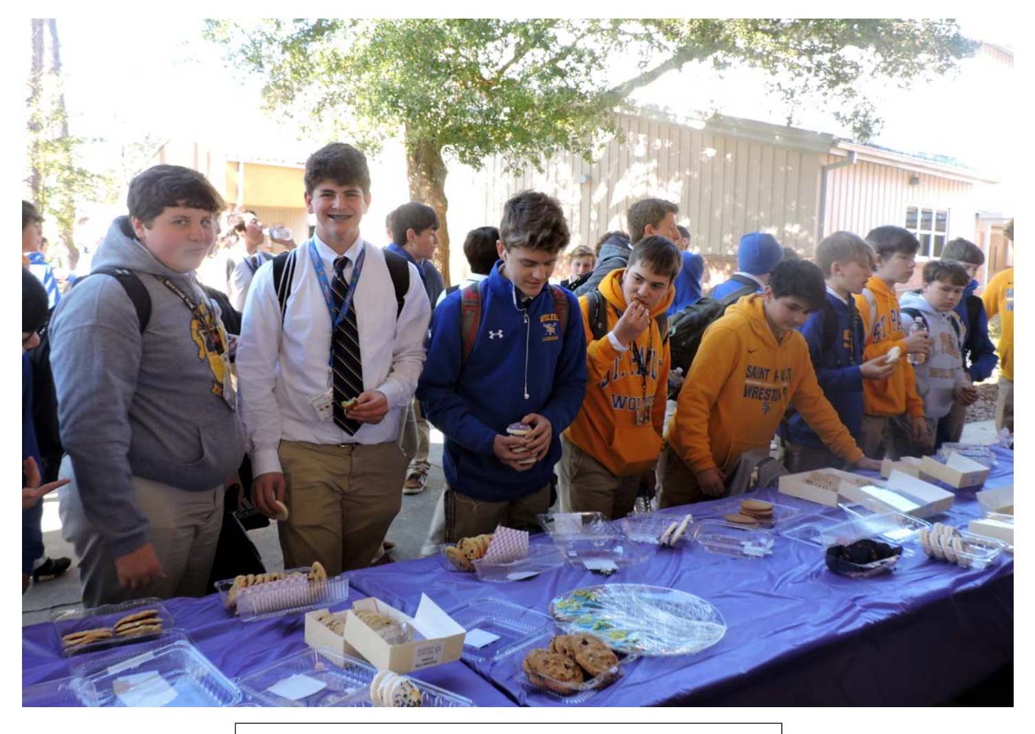
Pre-freshmen enjoy snack day. Thanks, Mothers' Club!

<u>A LOOK AHEAD</u> AND SECOND SEMESTER PERIOD ROTATION : For those who plan, here is the second semester period rotation. Use when making unavoidable doctor appointments, etc. so your son will know what classes he will miss.