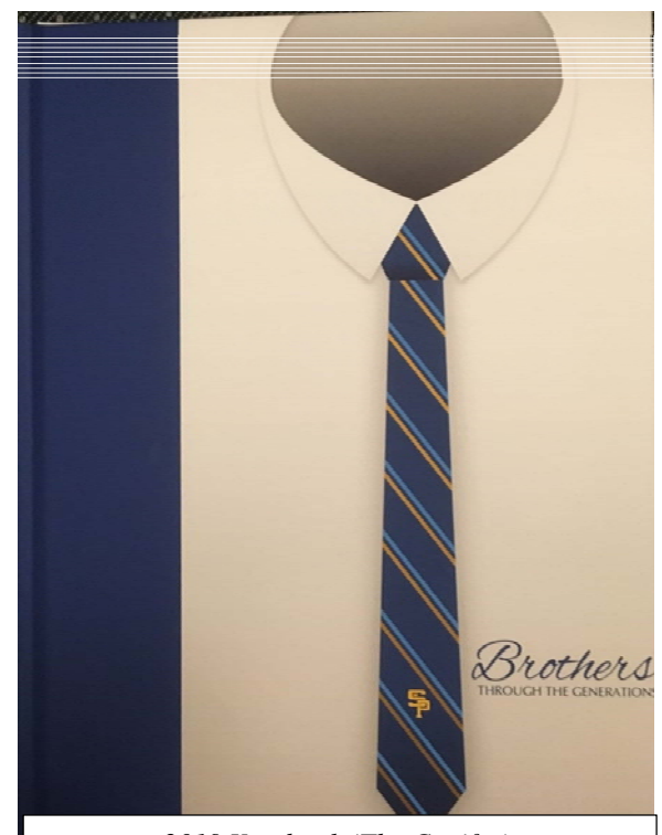
2019 Yearbook (The Conifer). Order this year's before Mar 14's price increase.